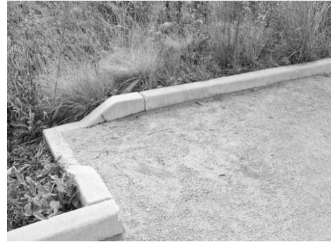
Figure I15: Interior Parking Lot Landscaping Example.