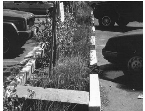
Figures I16: Interior Parking Lot Landscaping Example.