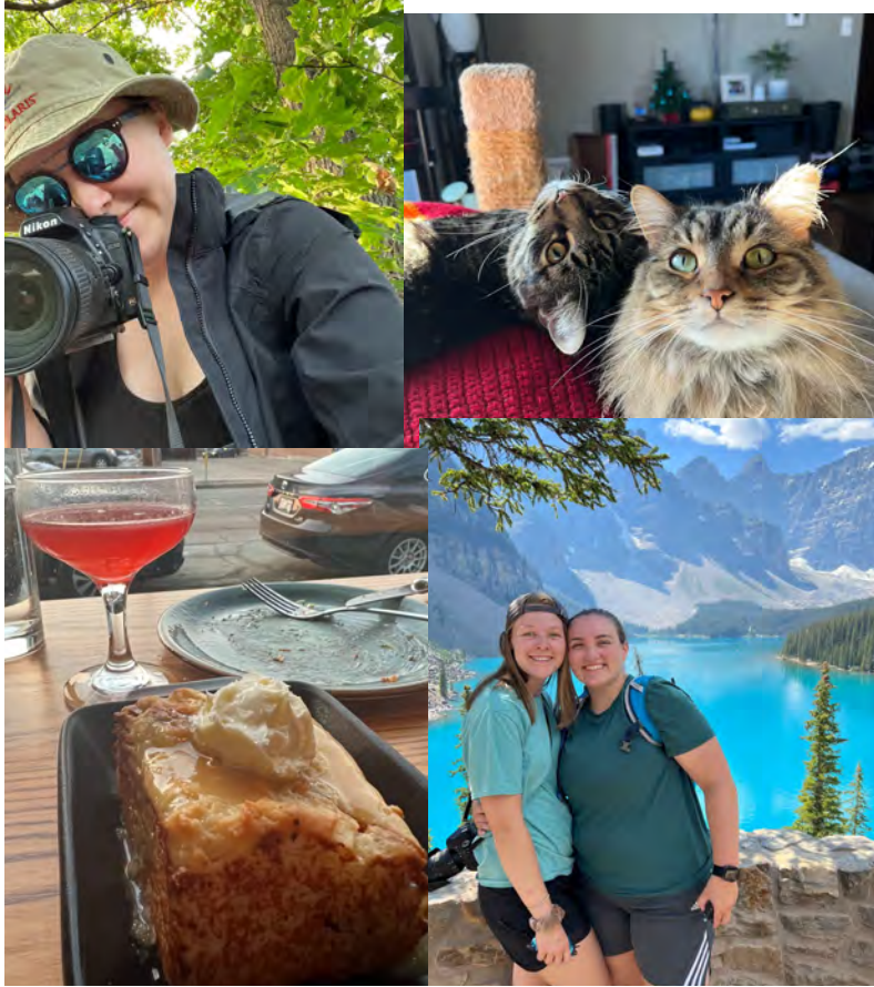
Cat mom, farm-to-table enthusiast, photography lover, and always looking to book the next trip

Fun Fact: I'll be traveling to the Netherlands next spring for about a month!