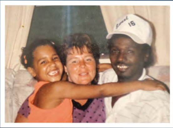
With my parents ❤️

I am a deeply-rooted, progressive community leader with a vision for a healthier & more equitable community.