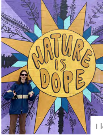
I love street art!