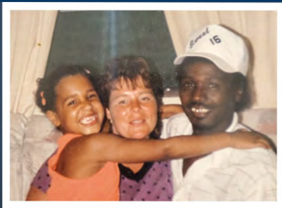
With my parents ❤️

I am a deeply-rooted, progressive community leader with a vision for a healthier & more equitable community.