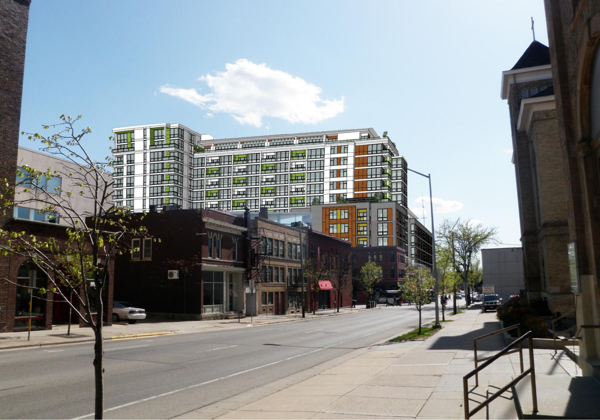
johnson street perspective - proposed