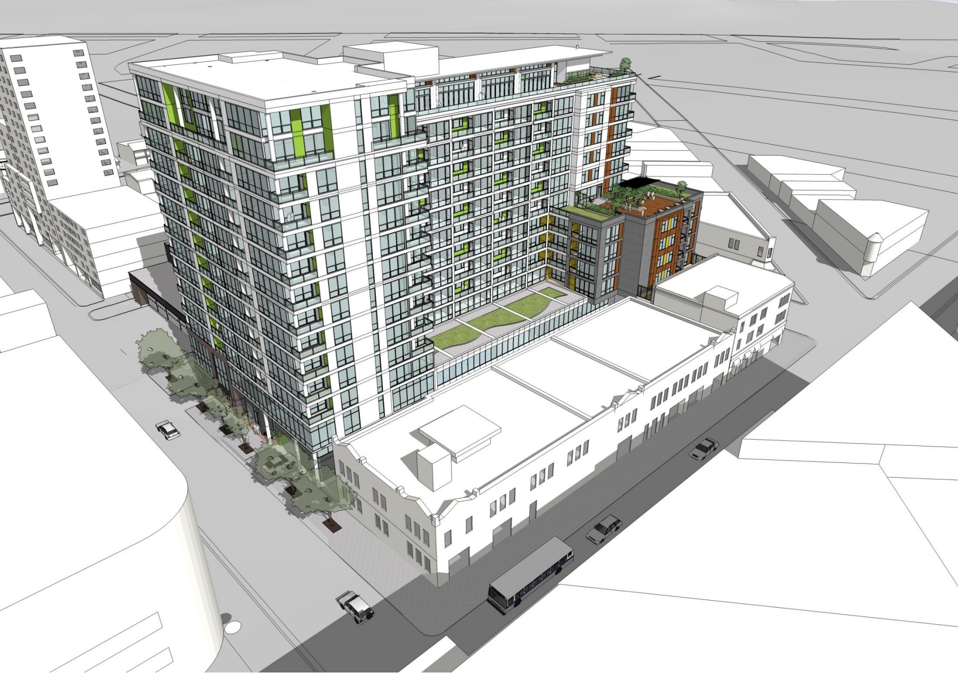
aerial looking west - proposed