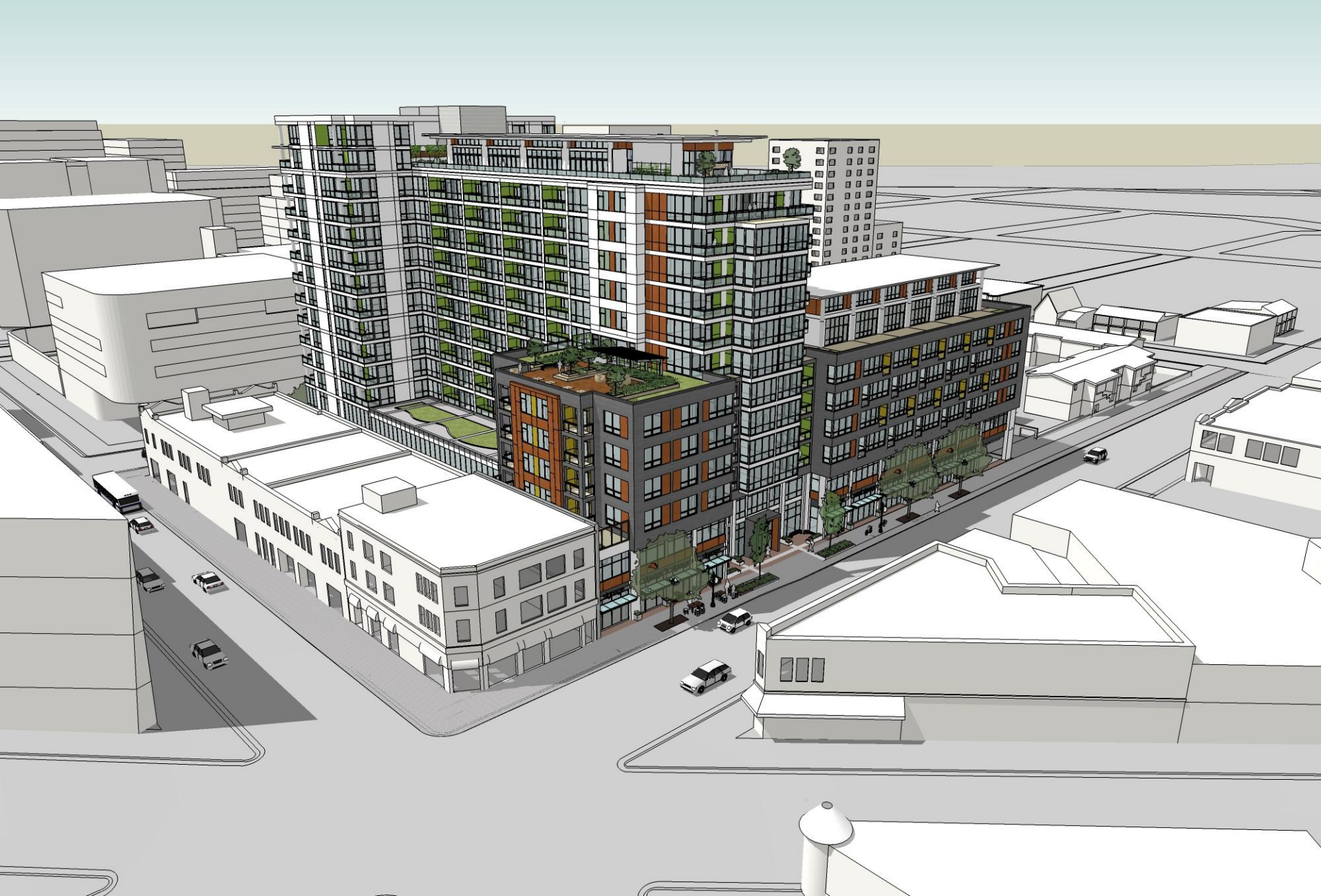
aerial looking south - 9/19/12