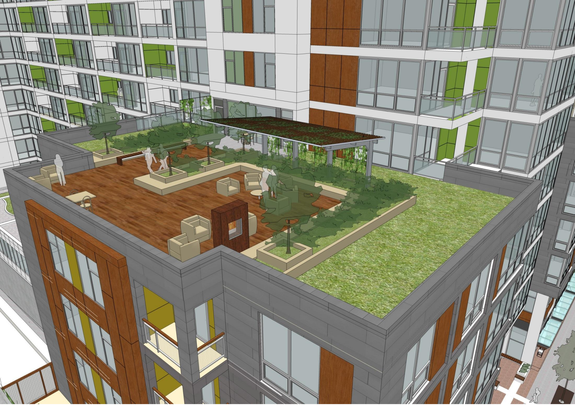
7 th floor landscape perspective