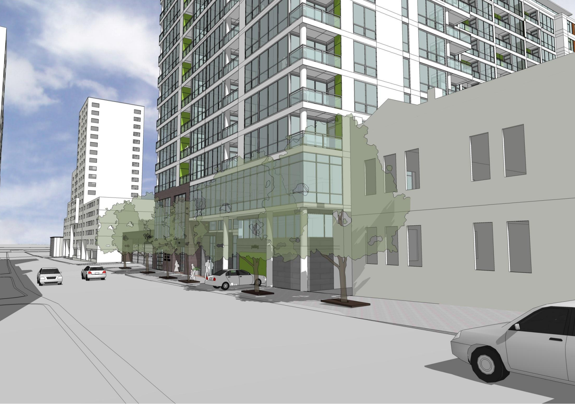
dayton street perspective – proposed