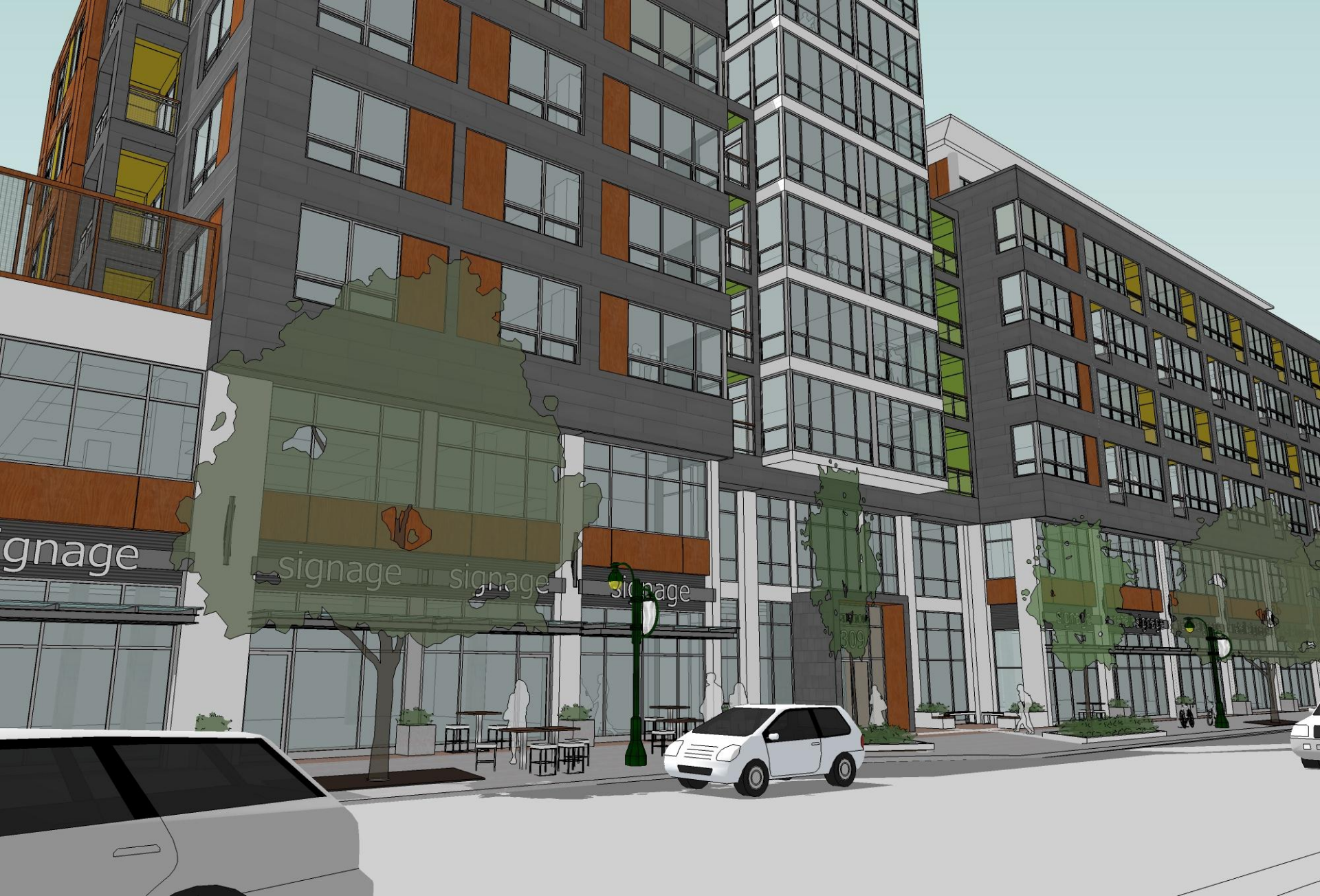
johnson street perspective - 9/19/12