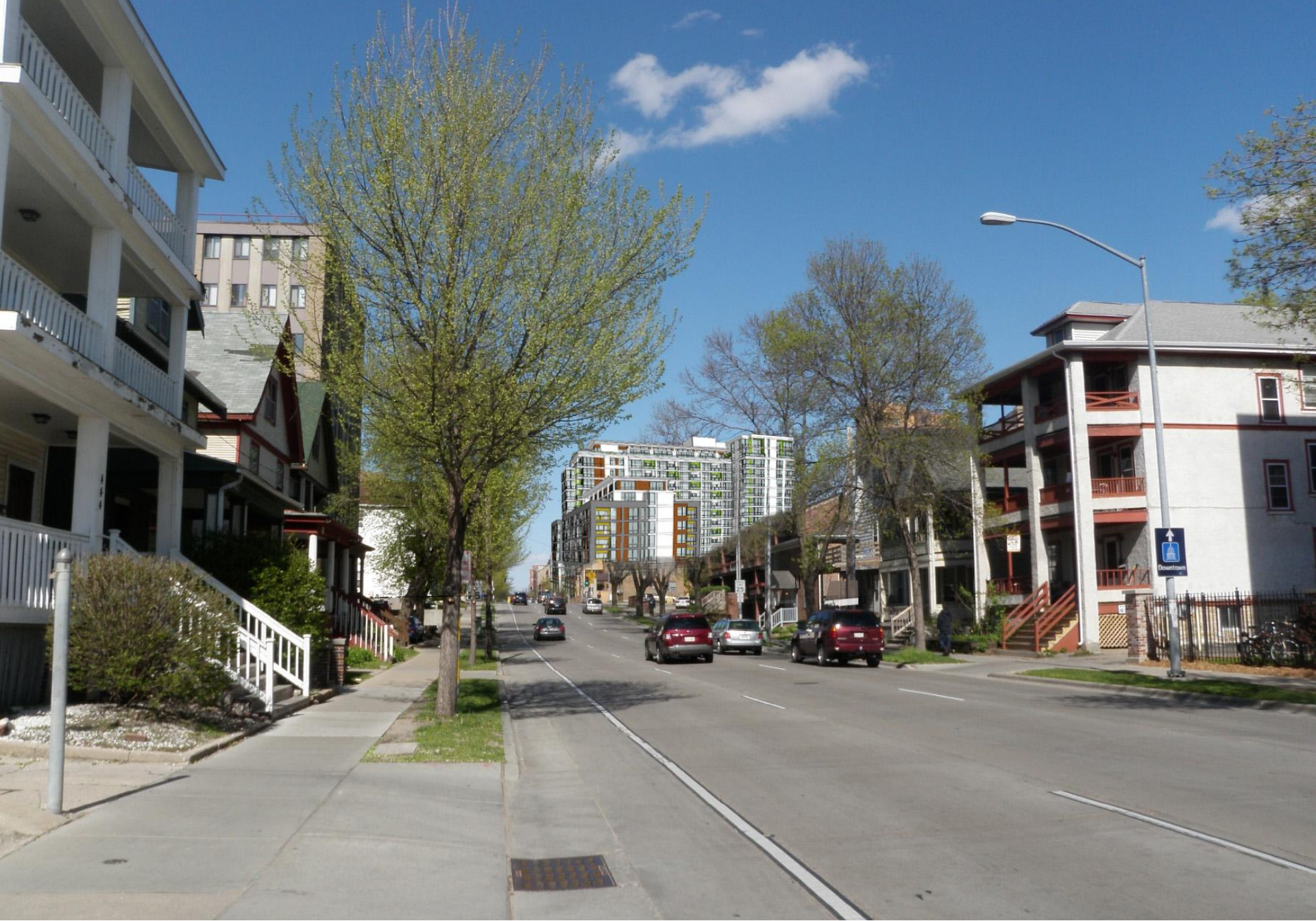
johnson street perspective – proposed