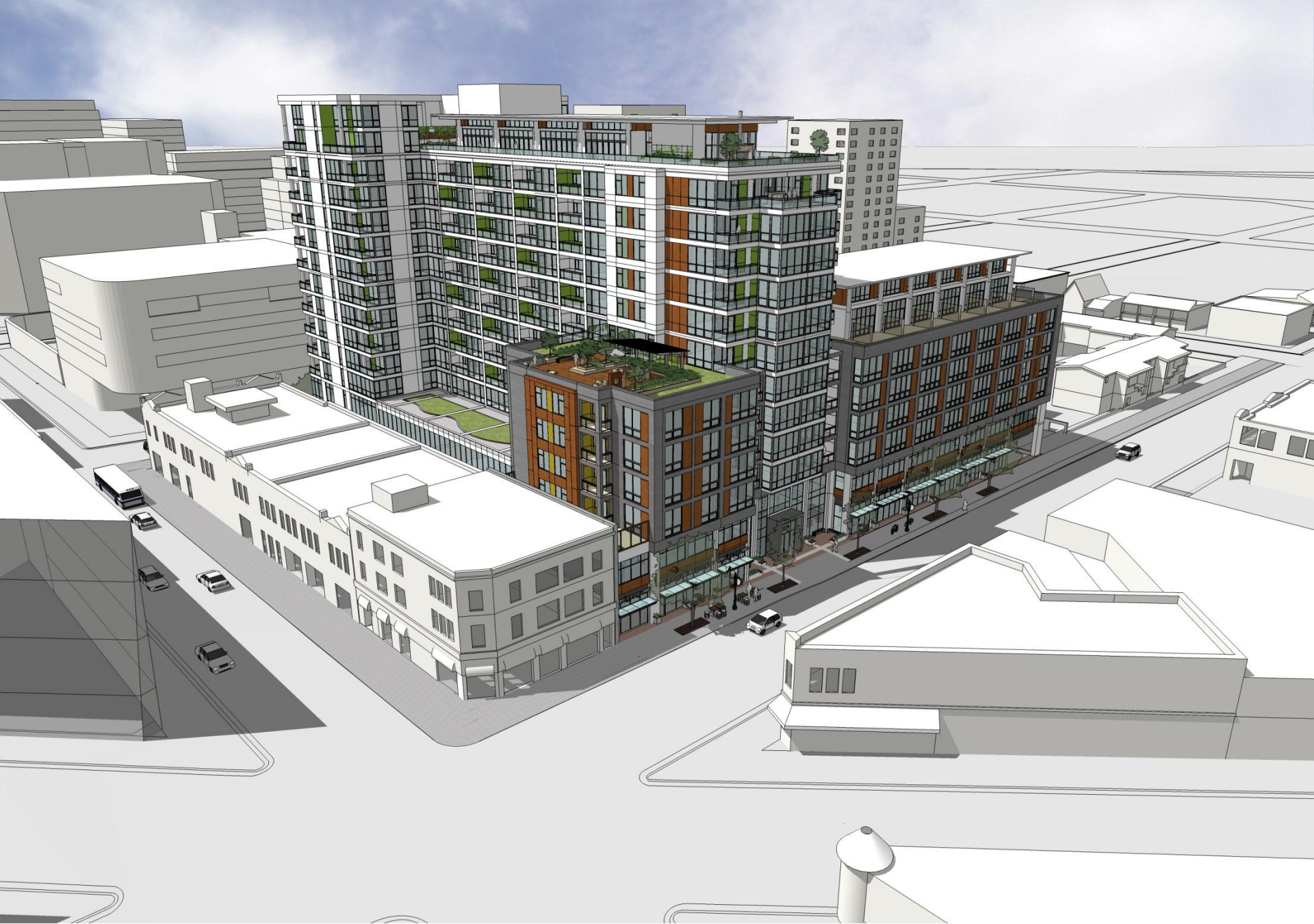
aerial looking south - proposed