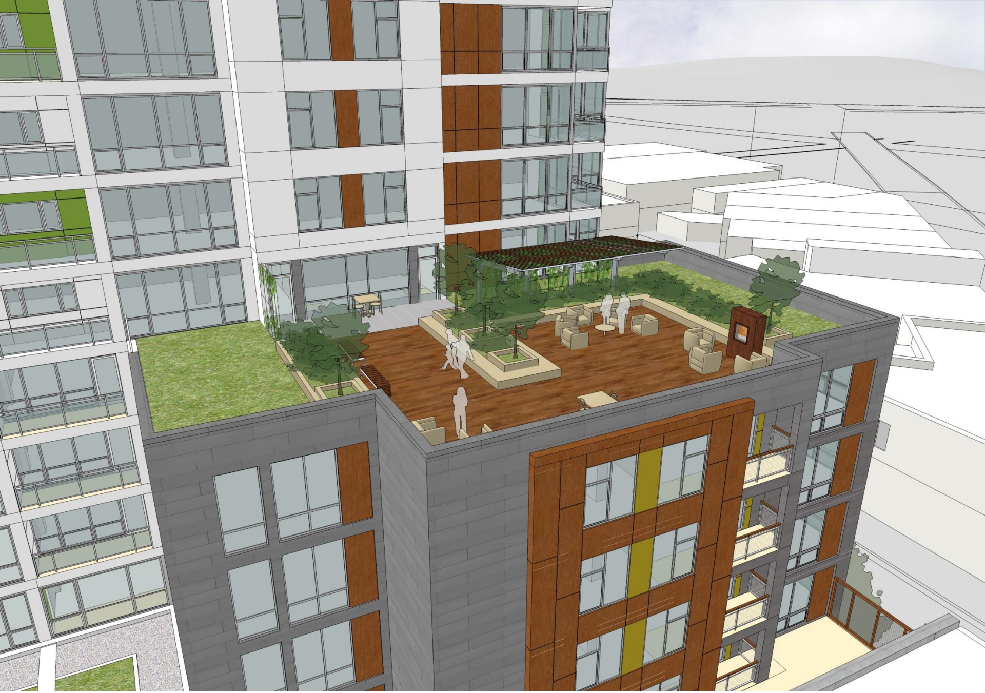
7 th floor landscape perspective