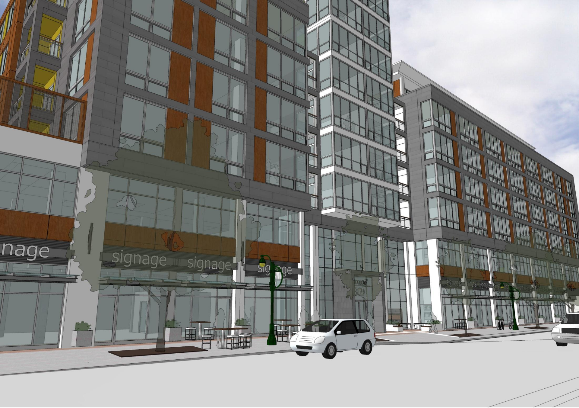
johnson street perspective - proposed