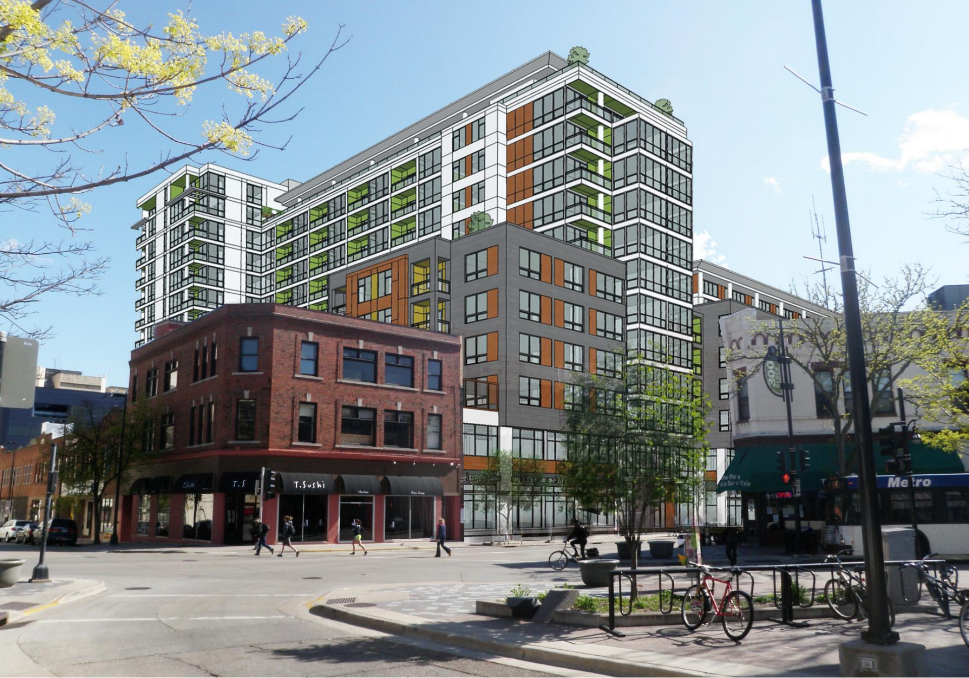
state street perspective - 9/19/12