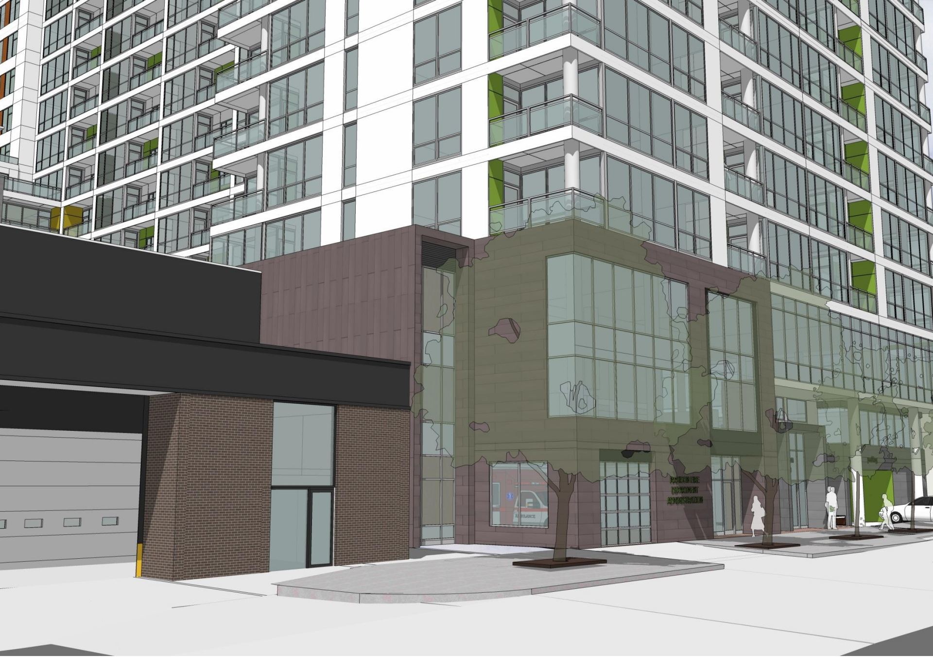
dayton street perspective – proposed