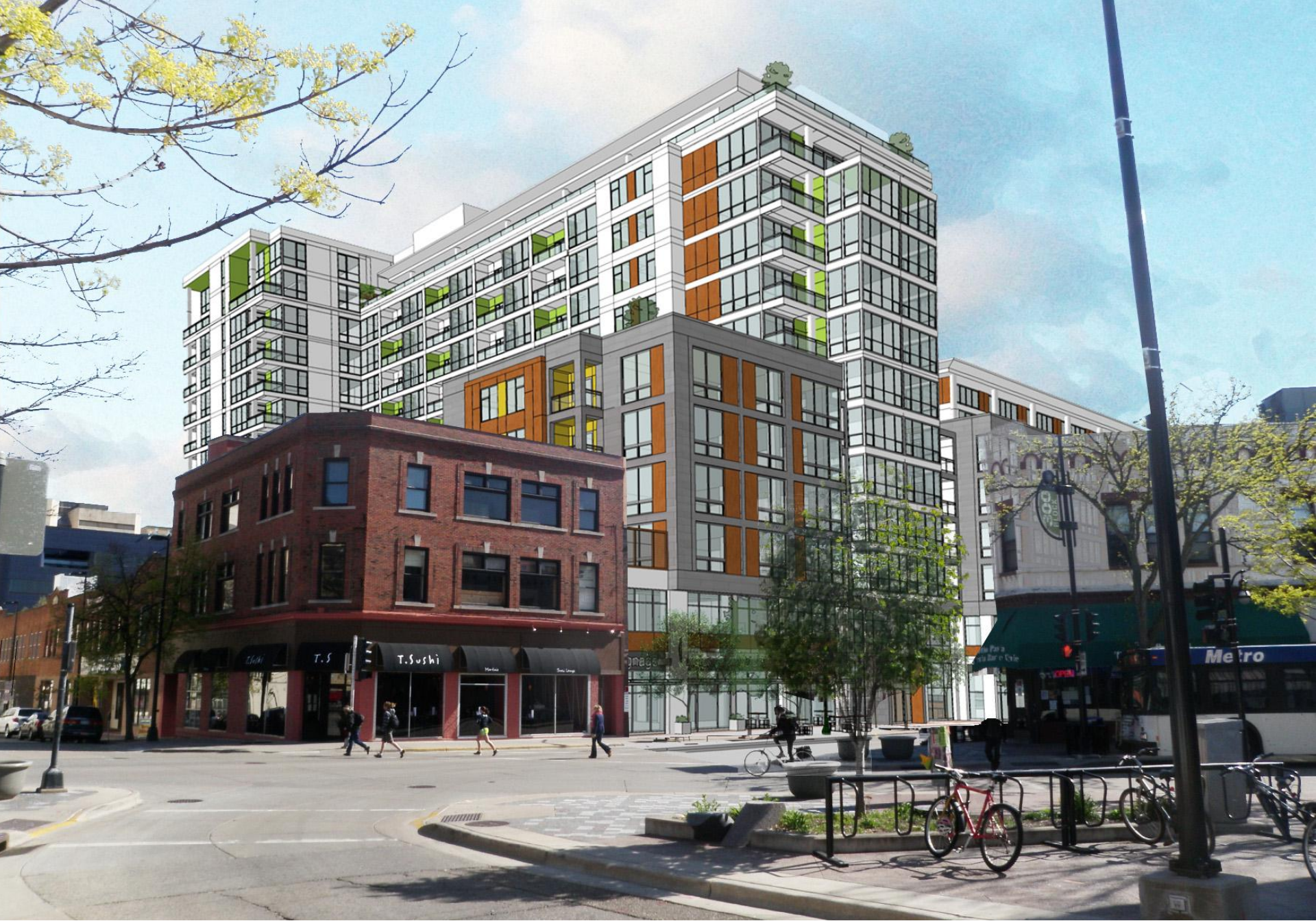
state street perspective - proposed