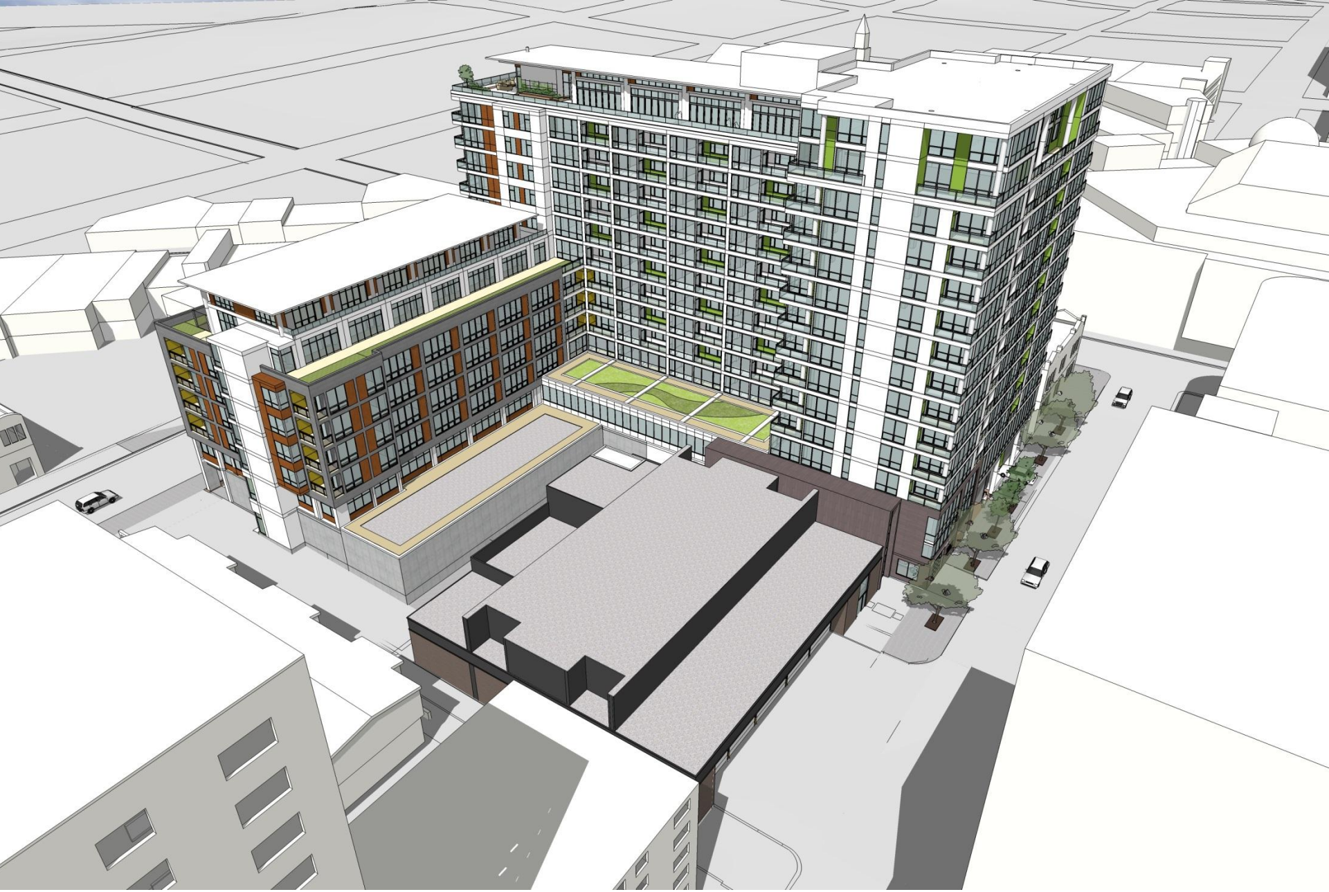
aerial looking north – proposed