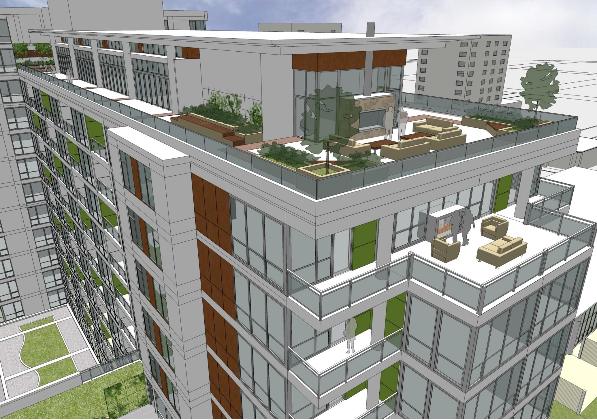
13 th floor roof terrace perspective