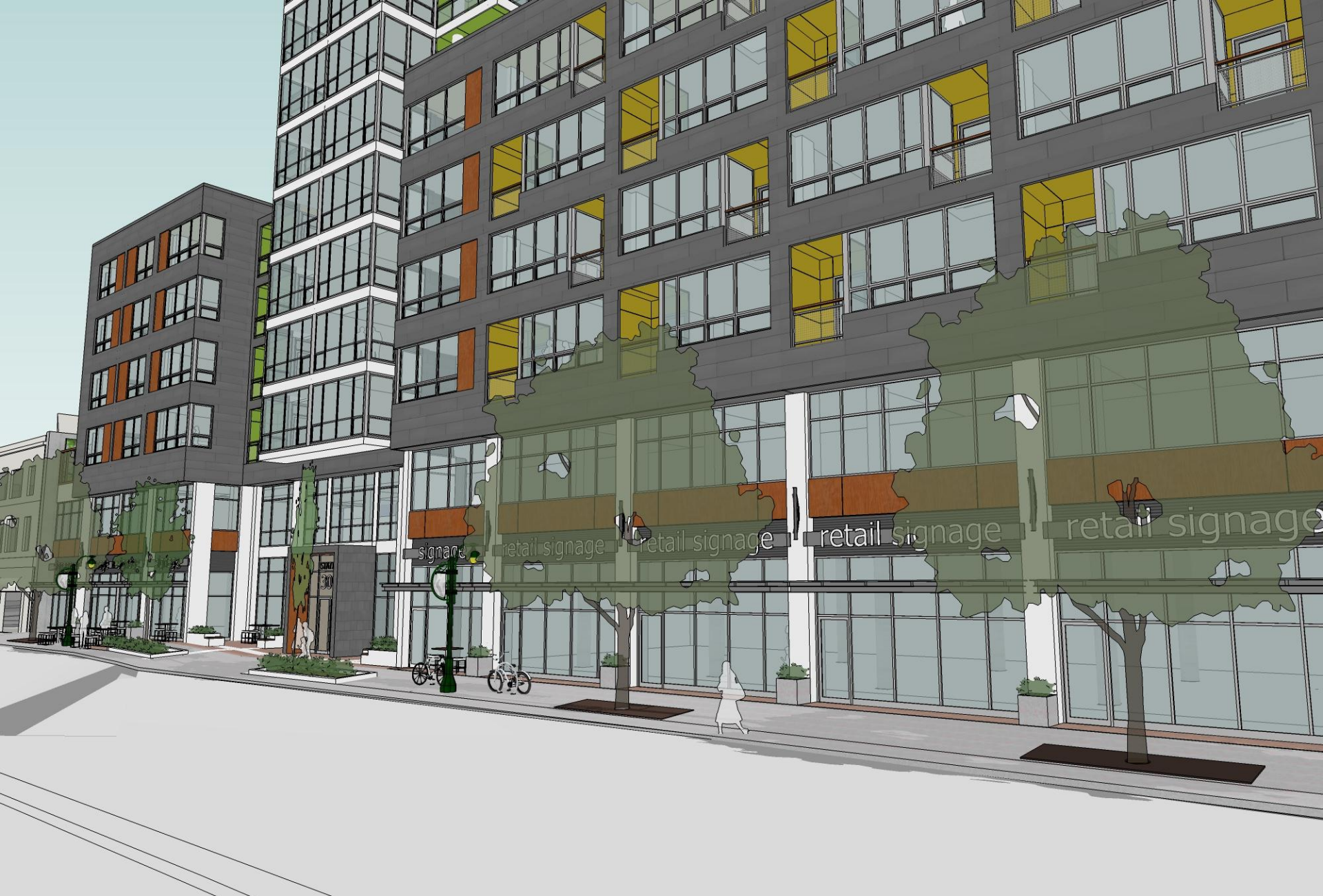
johnson street perspective - 9/19/12