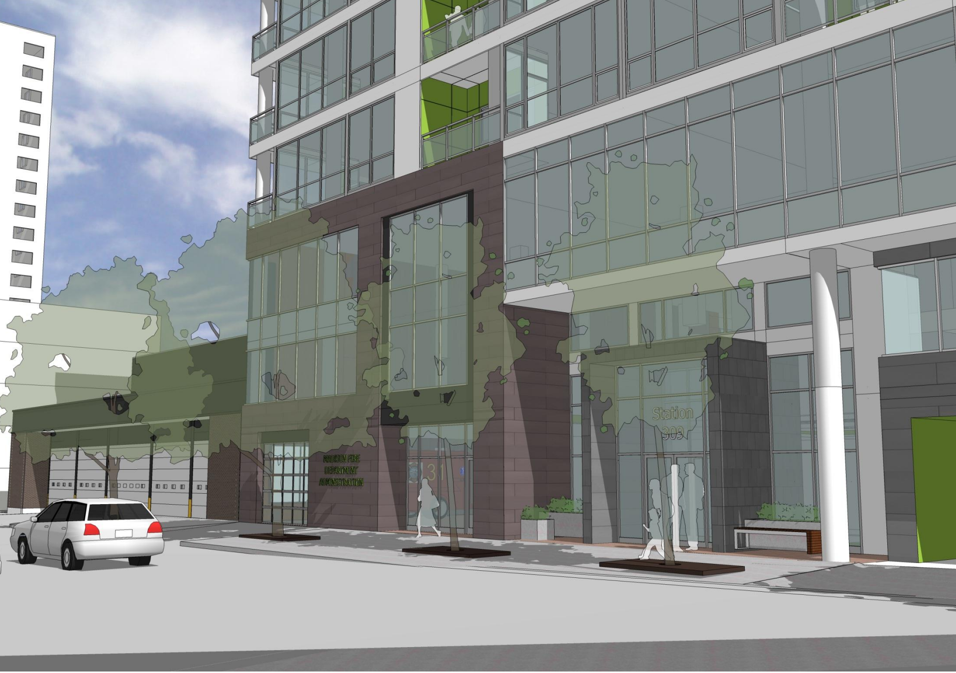
dayton street perspective – proposed