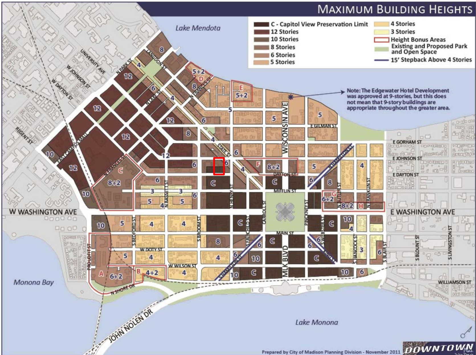
downtown plan land use

Note: The Edgewater Hotel Development was approved at 9-stories, but this does not mean that 9-story buildings are appropriate throughout the greater area.