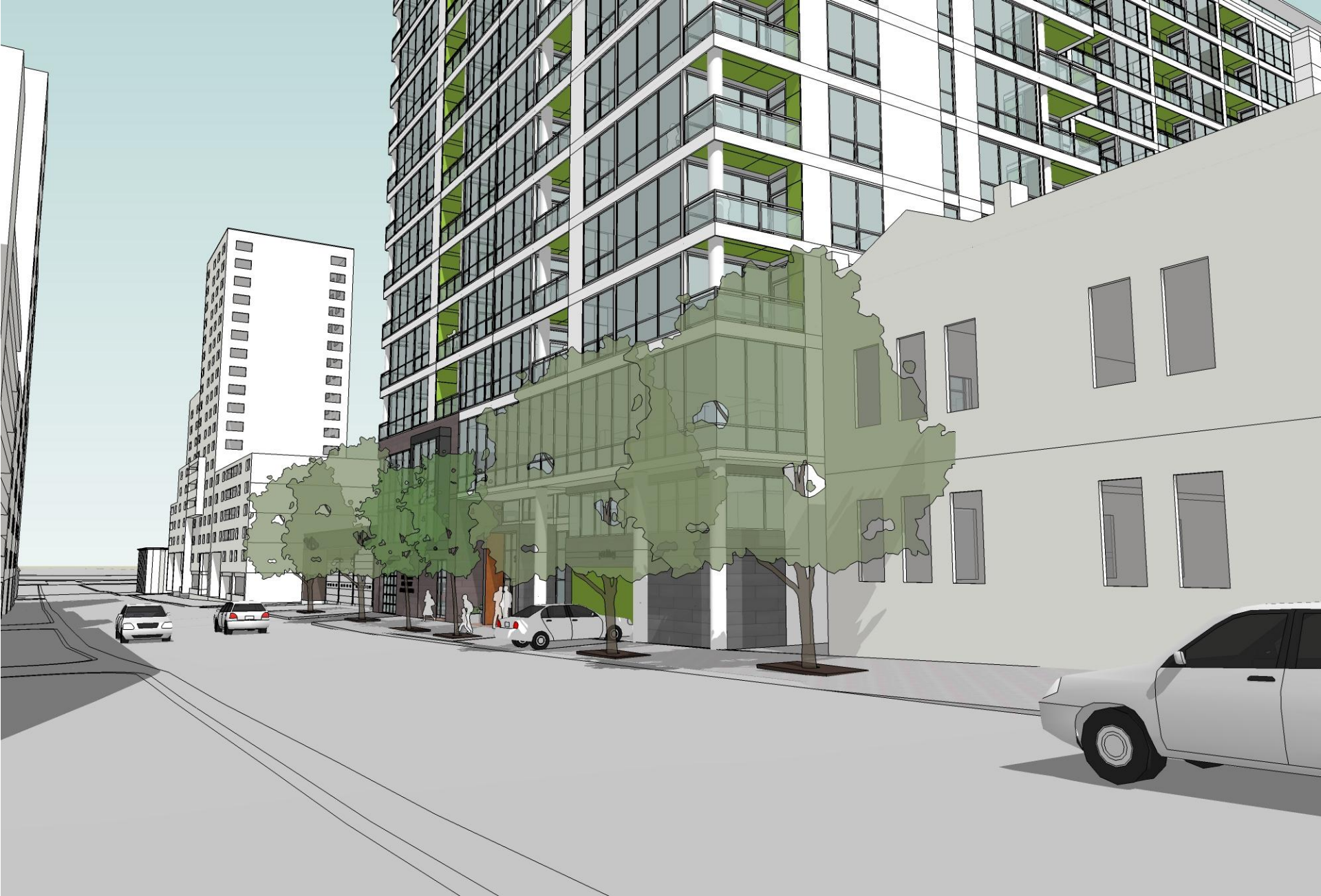
dayton street perspective – 9/19/12