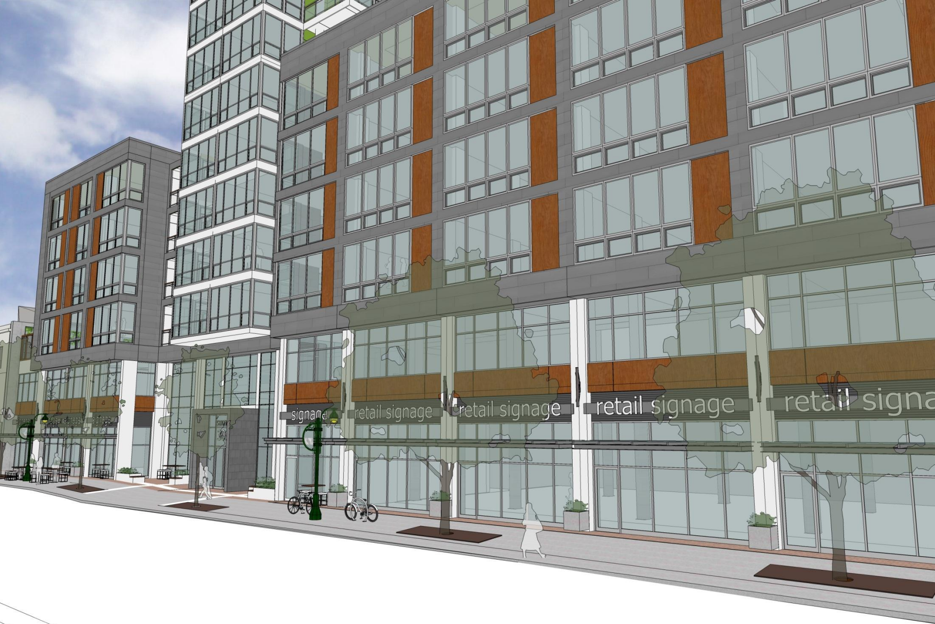
johnson street perspective - proposed