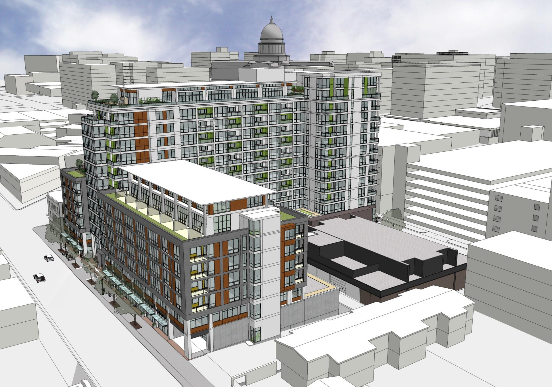
aerial looking east- proposed