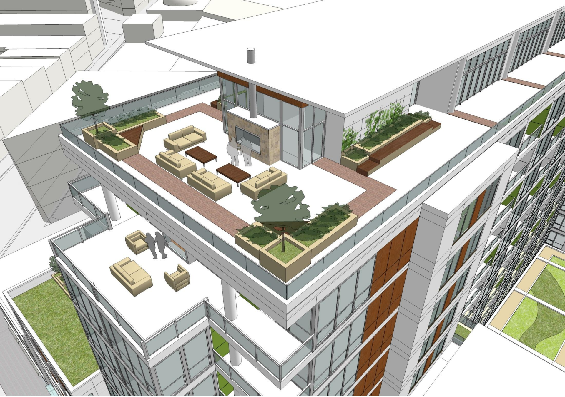
13 th floor roof terrace perspective