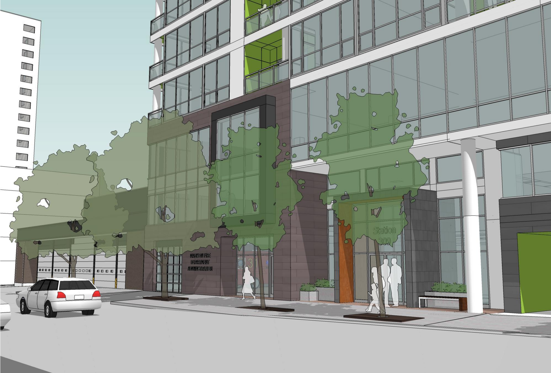
dayton street perspective - 9/19/12