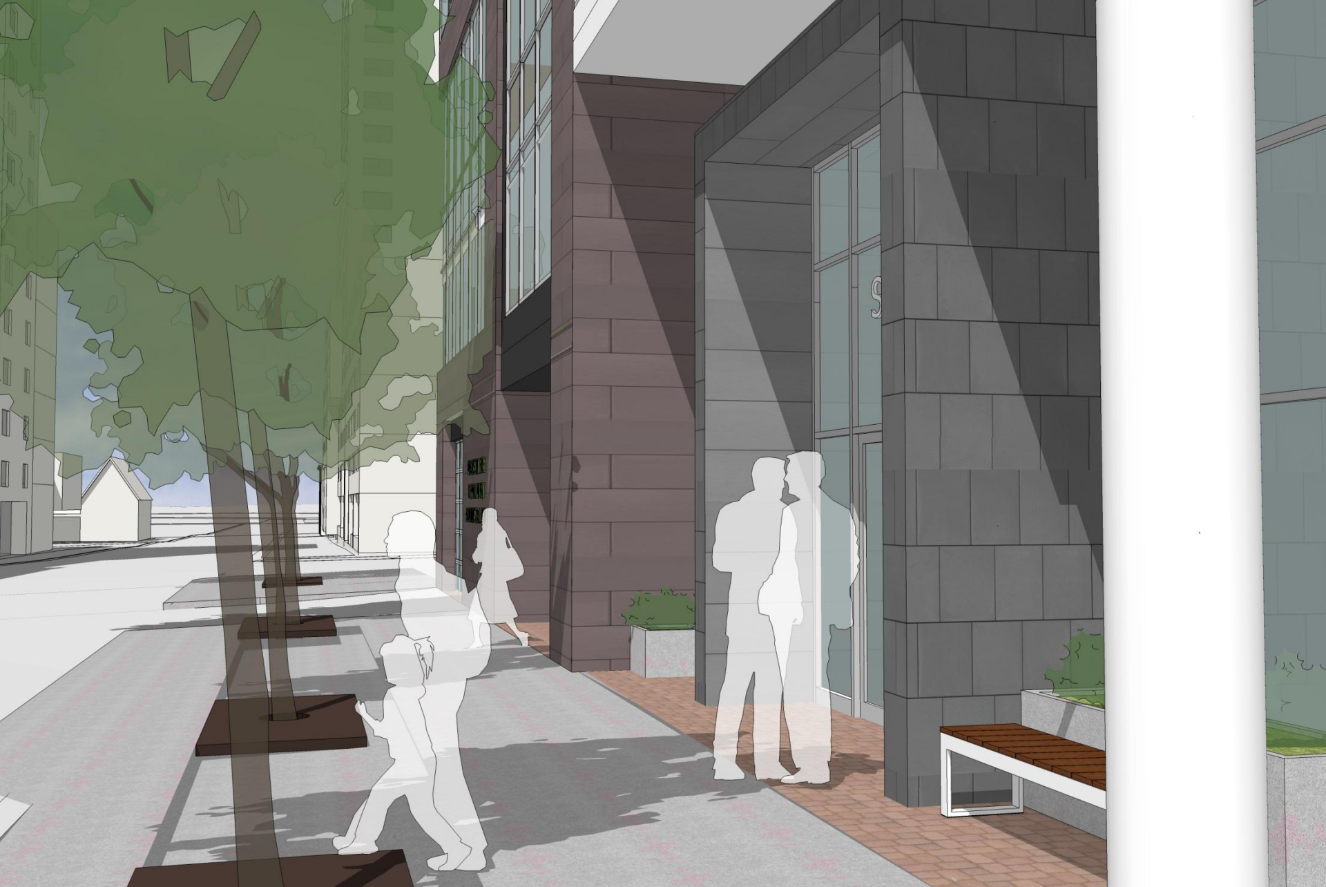
dayton street perspective – proposed