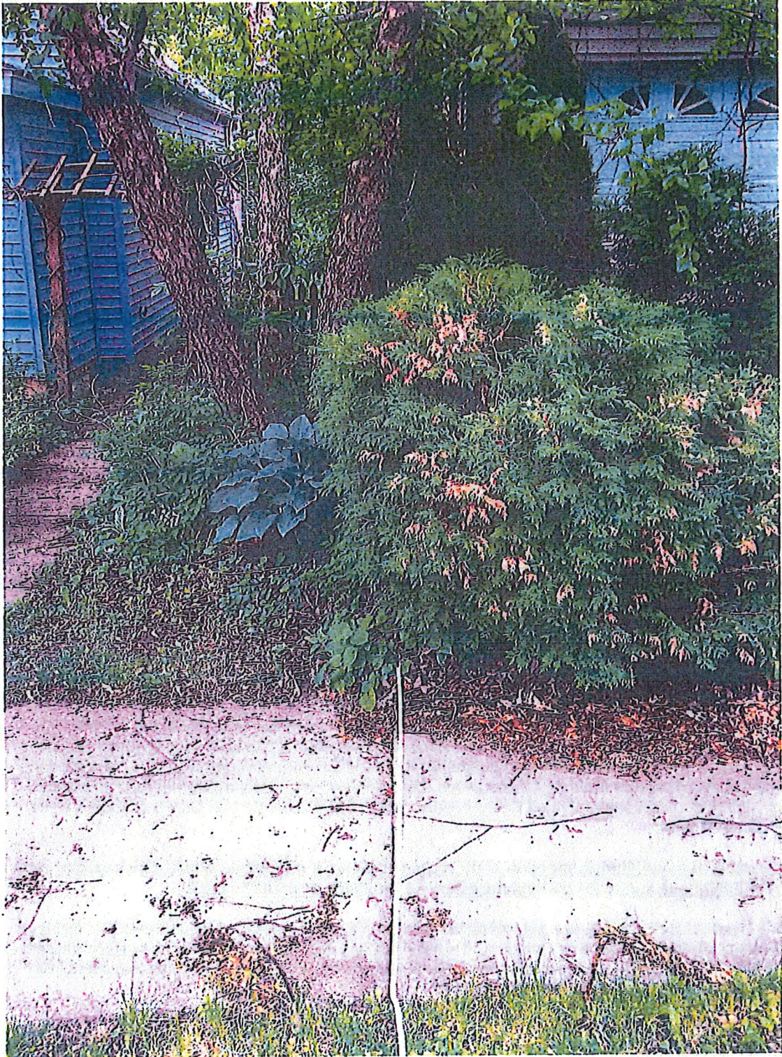
4017 Birch Ave. Property Line Picture