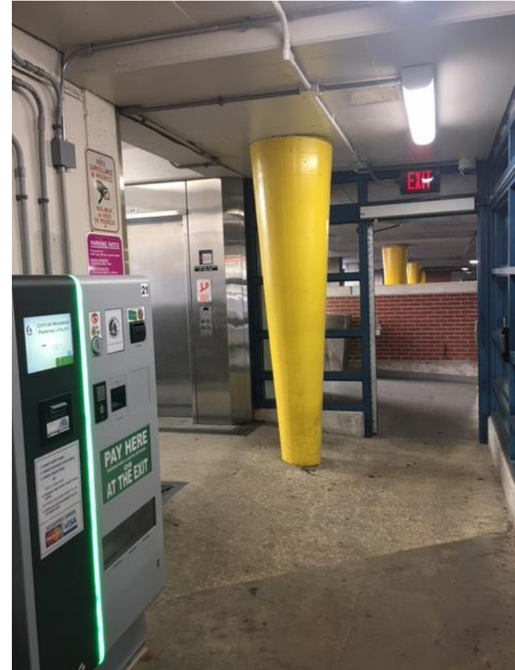
(Photograph - not a surveillance image)

Pay-on-Foot Stations – help line calls, revenue equipment theft/damage prevention, patron safety