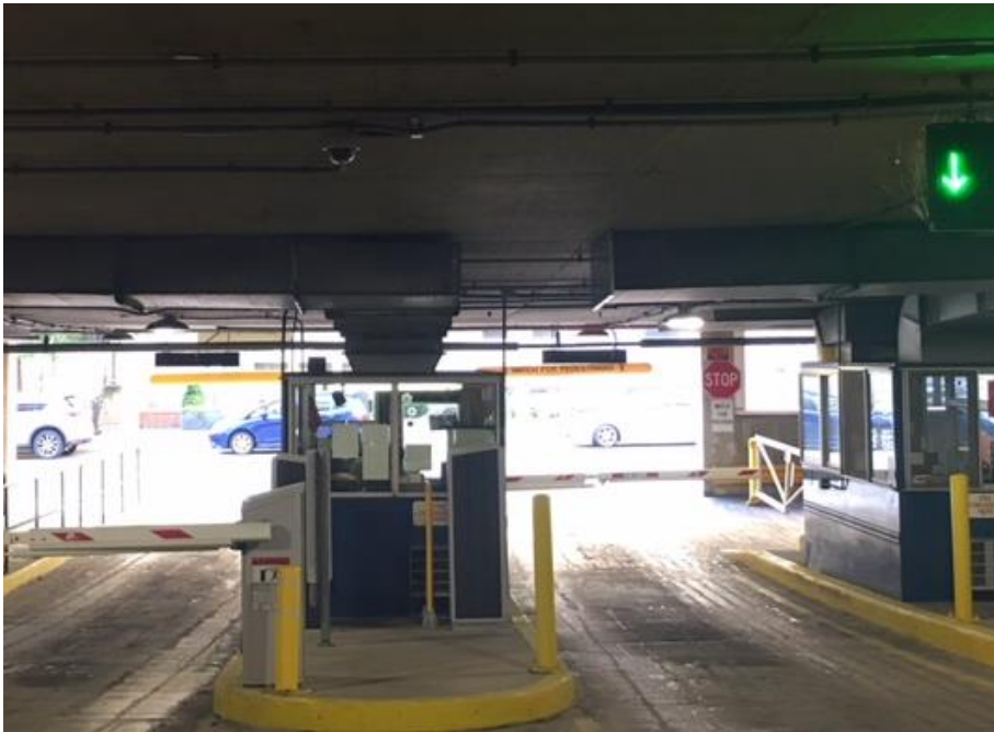
(Photograph - not a surveillance image)

Exit and Entry Gates – help line calls, collecting for damages (vehicles driving through gates to avoid paying), revenue equipment theft/damage prevention, queuing and operations