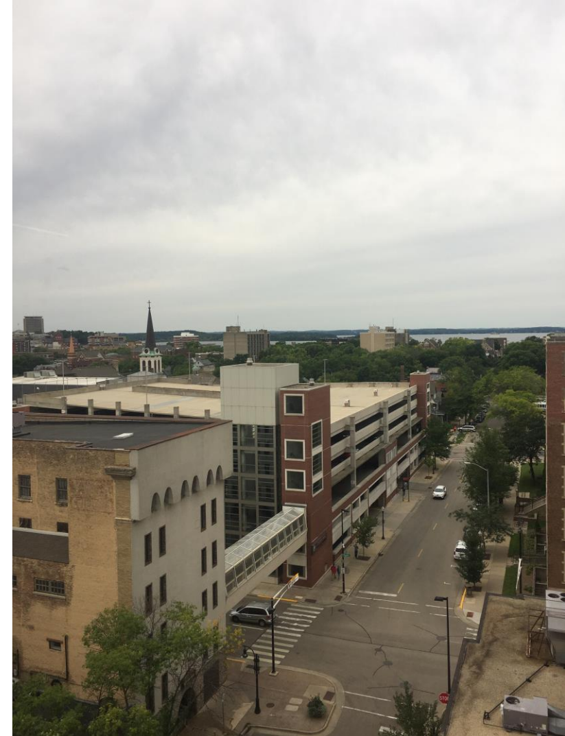
State Street Capitol Garage Rooftop (photo taken from 30 W Mifflin; not a surveillance image)