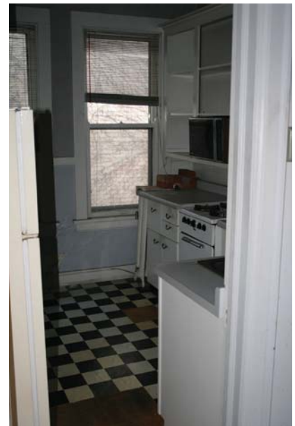
Second Floor Apartment