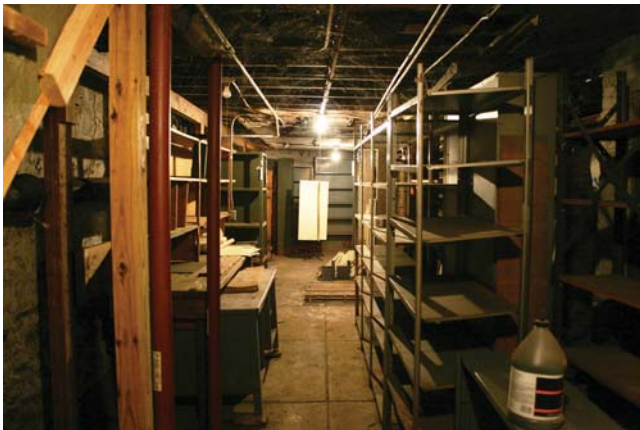
Basement: Temporary shoring to support first floor