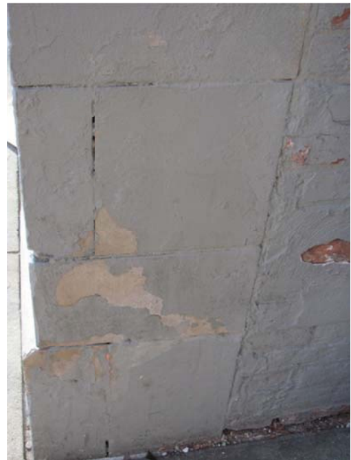
Figure 3. Right. At the limestone masonry of the first floor, some areas of coating have debonded.