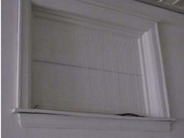
Figure 17. Leaded glass window, which has been painted over, at the southwest party wall.