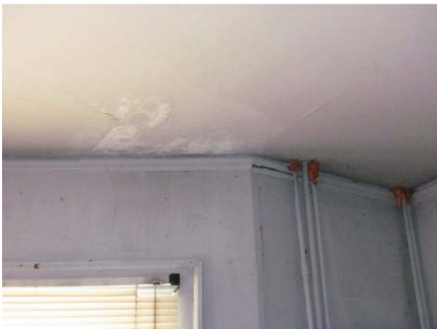
Figure 19. Moisture damage to plaster finishes at the second floor.