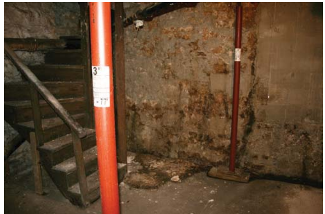
Basement: Temporary shoring to support first floor