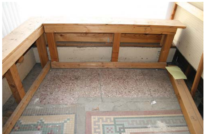
First Floor: View at bay window showing multiple types of flooring