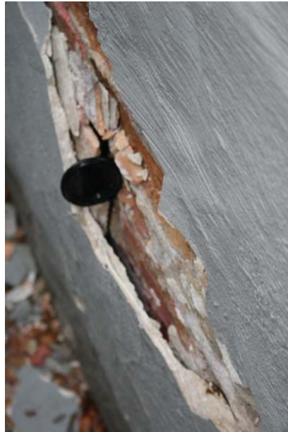
Exterior: View in the alley showing the delamination of the parging system from the brick veneer