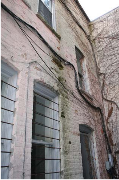
Exterior: View of the back of building showing eroding brick veneer