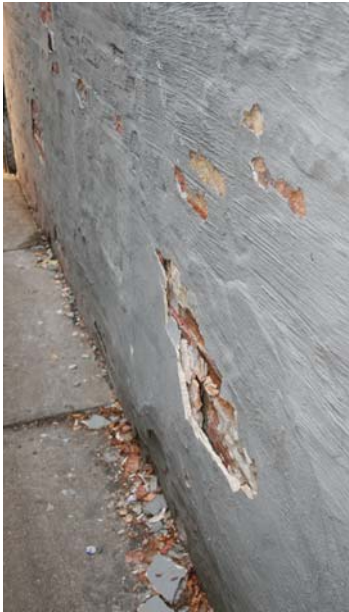
Exterior: View in the alley showing a section of delaminated parging