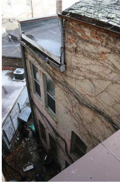
View of the back of facade