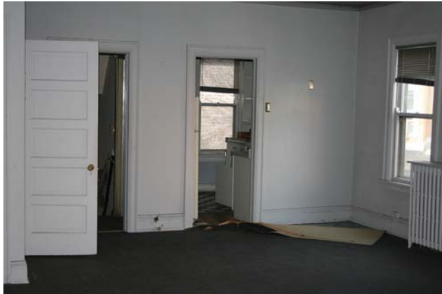
Second Floor Apartment