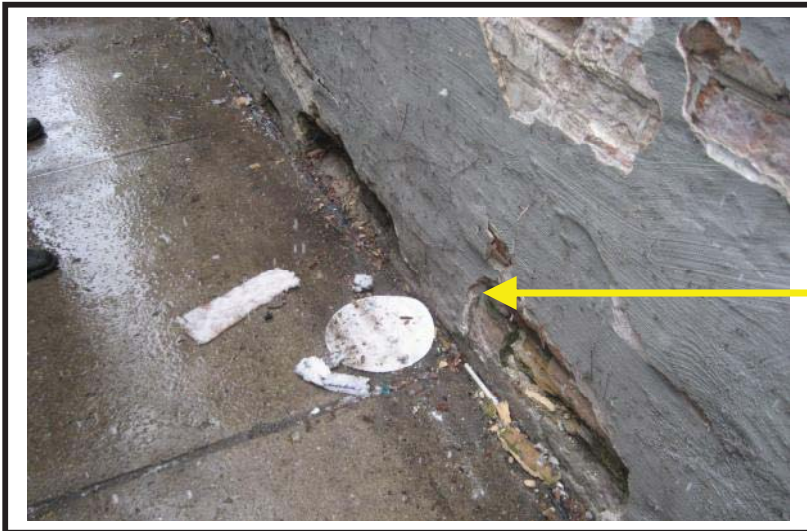
Figure 4 – Spalling brick face-east exterior wall.