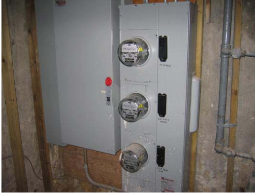
Electrical service in the basement.