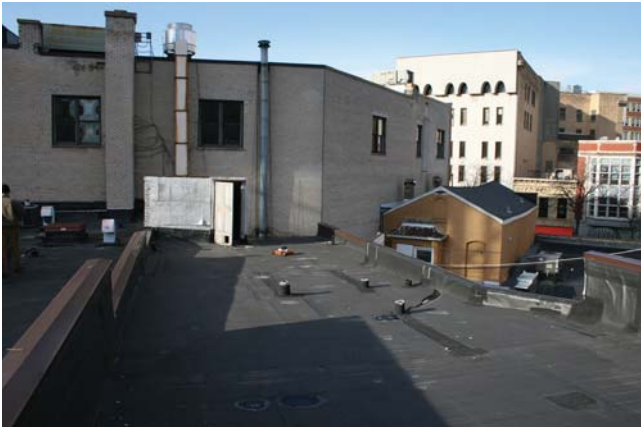
Roof showing roof access structure