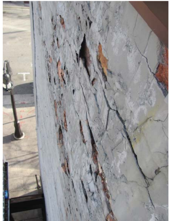
Figure 8. Right. Deterioration of brick and parging near the top of the side wall.