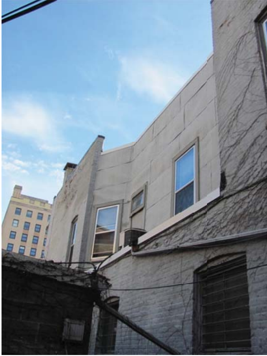
Figure 9. A portion of the side wall is recessed at the second floor and is clad with painted sheet metal.