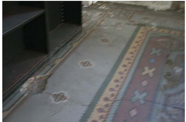
First Floor: View at back of room showing areas where tile floor has been removed