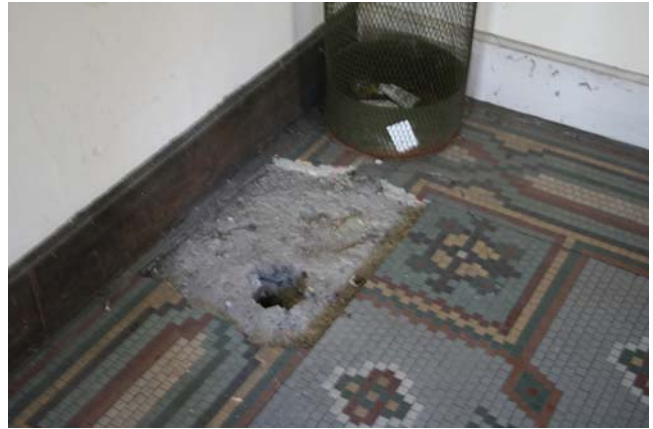
First Floor: View at back of room where the floor has been removed