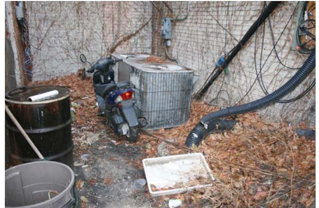
View of space behind existing building showing storm basin collecting water from adjacent buildings