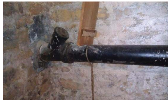
Storm main support/pitch