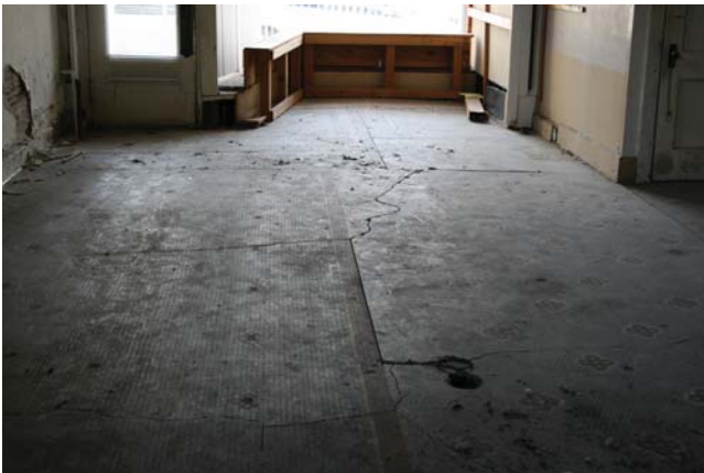
First Floor: View toward Mifflin Street entry showing multiple cracks in floor tiles