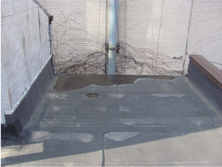
Figure 11. Ponding on the roof near the gutter.