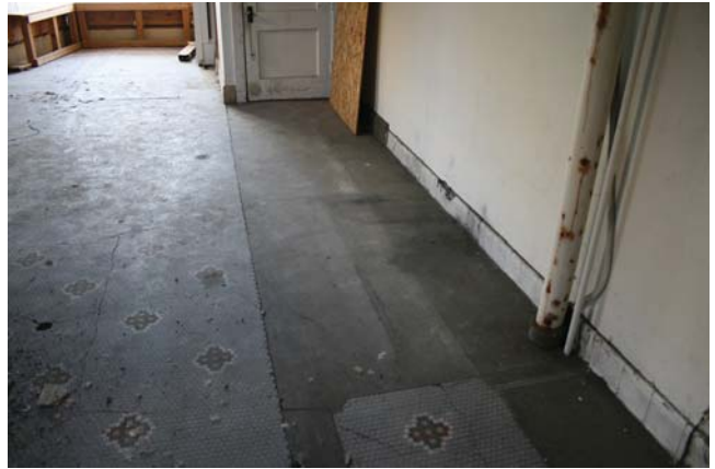
First floor: View of area where exposed concrete is installed