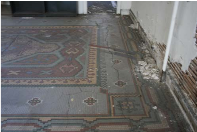
First Floor: View toward back exit showing multiple cracks in floor tile