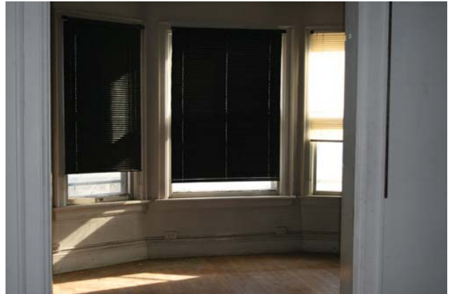
Second Floor Apartment