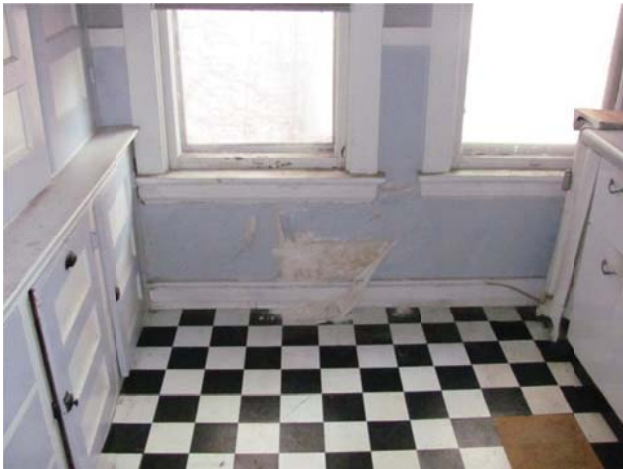
Figure 18. Plaster damage at the rear wall at the second floor of the building.