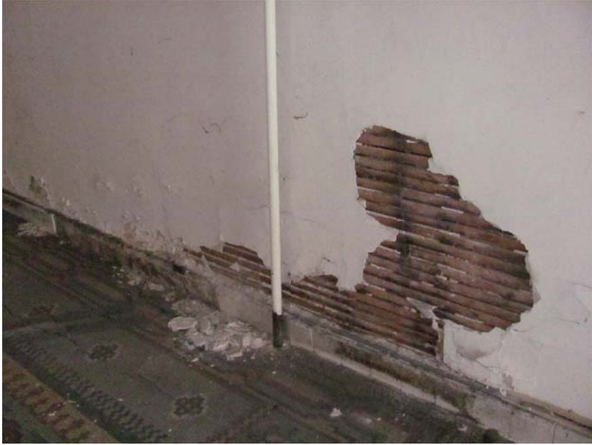
Figure 15. Damage to interior plaster wall finish.