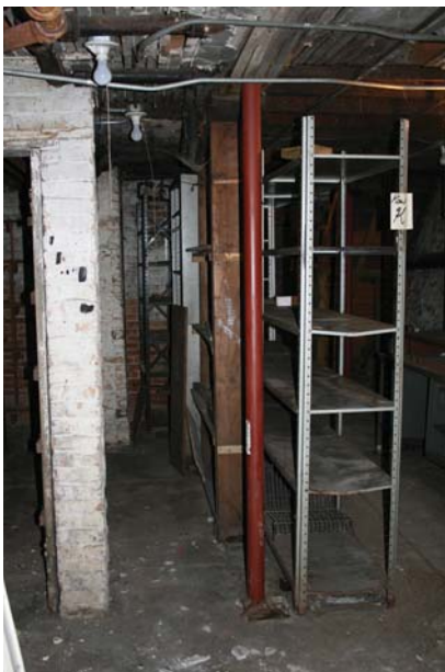
Basement: View of one temporary column supporting the first floor