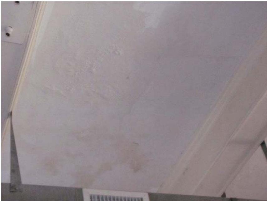
Figure 16. Water staining and bubbling of interior plaster ceiling.