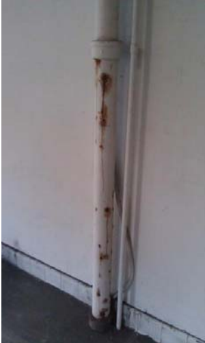
Leaking sanitary pipe