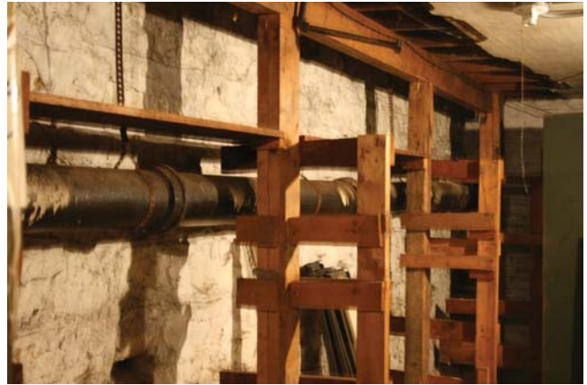
Basement view showing stormline routing storm water from adjacent building(s) through the basement of 120 West Mifflin Street