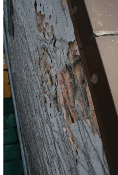
View from roof looking at condition of brick and parged wall