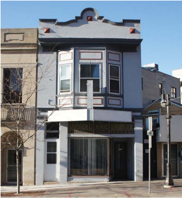
View of the Front Facade