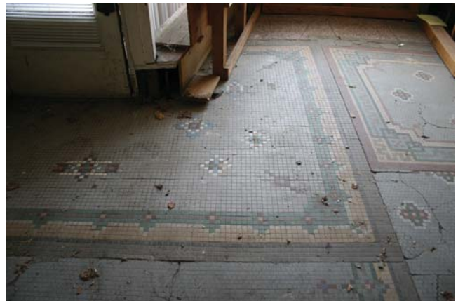
First Floor: View at entry off Mifflin Street showing three flooring surfaces. 1) Original 3/4" square tiles 2) 1" square tiles at entry 3) composite flooring at window