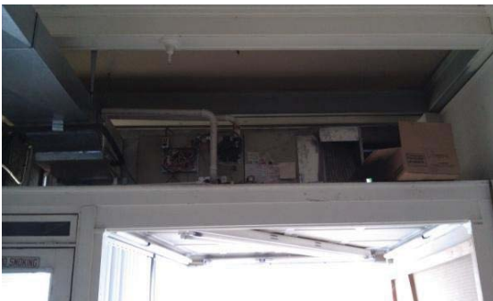
Furnace above entrance

The heating system consists of an atmospheric hot water boiler that serves the upper floors. The first floor is heated from a gas-fired furnace located above the first floor front entrance. A functional domestic water heater exists in the boiler room. The roof is pitched from the front to the back and drains off the back edge to the alley below. While there are no roof drains, there is a horizontal cast iron storm pipe that runs the length of the basement. This pipe originates from a cistern in the alley that receives storm water from adjacent building downspouts (to the east of building 117-119 State) through corrugated tubing. It appears that the stormwater from the 117-119 State Street building also discharges into this cistern through an underground lateral. From the cistern, it is piped through the basement of this building and into a storm main in West Mifflin St. The sanitary piping is entirely cast iron, most all of it original. Water piping from the basement to the second floor appears to be lead.