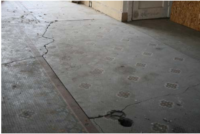
First Floor: View toward basement stair showing multiple cracks in tile floor