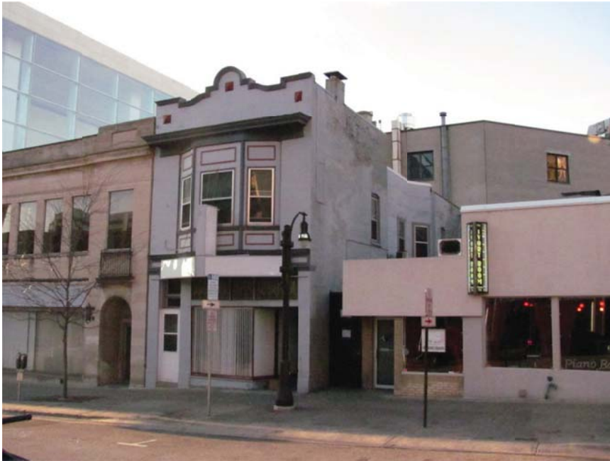
Figure 1. Overview of the building from the south. The Mifflin Street facade is at left.