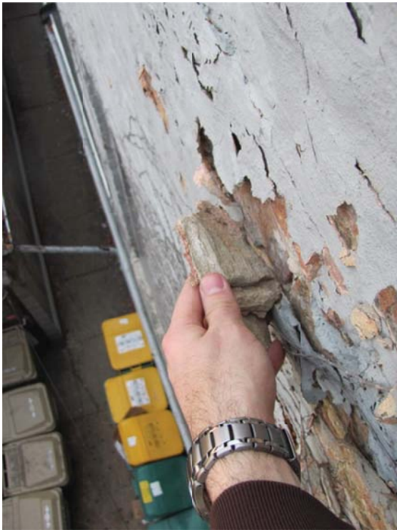
Figure 7. Left. Loose fragments of brick/mortar/parging were removed by hand from the side wall.