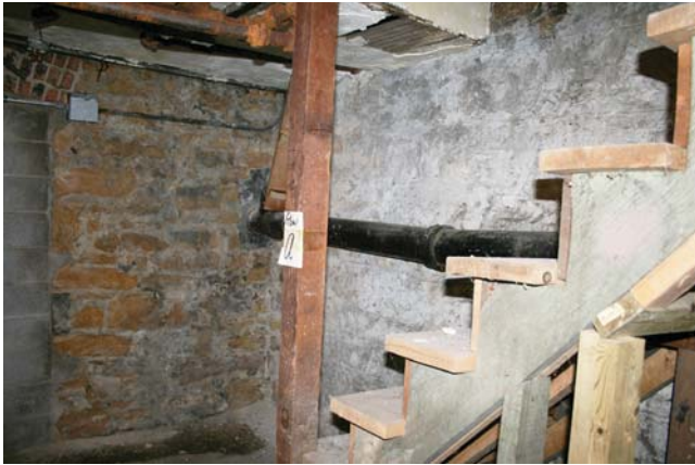
Basement: stormline routing to West Mifflin Street