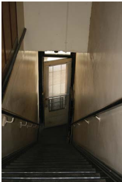
Second Floor: Access from Mifflin Street