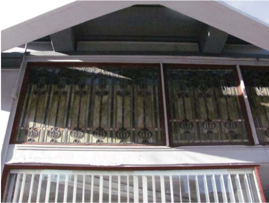
Figure 4. The first floor storefront includes a three-part leaded art glass transom.