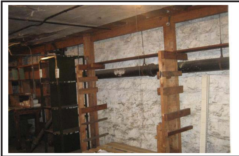
Figure 1 – Shoring along basement wall –also used as shelving.