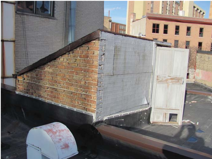
Figure 12. View of the penthouse walls constructed of brick masonry and painted sheet metal.