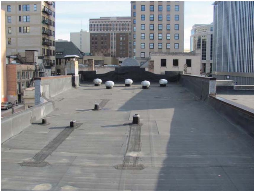
Figure 10. Overview of the roof.