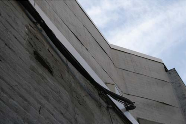
Alley view of sheet metal stamped with brick pattern