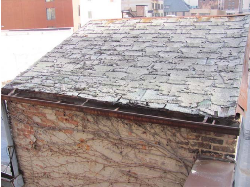
Figure 13. The penthouse roof is covered with asphalt shingles in deteriorated condition.