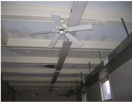
First floor lights.