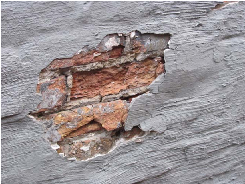
Figure 5. Failure of cementitious parge coat, revealing deteriorated brick masonry.