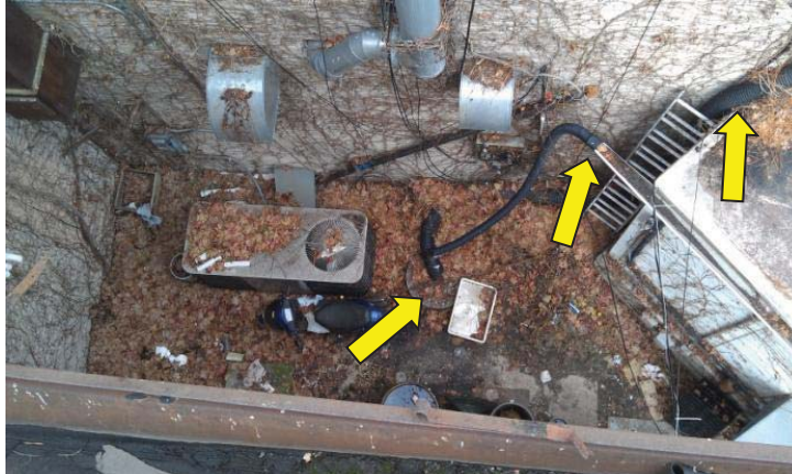
Roof drains into cistern that discharges through basement