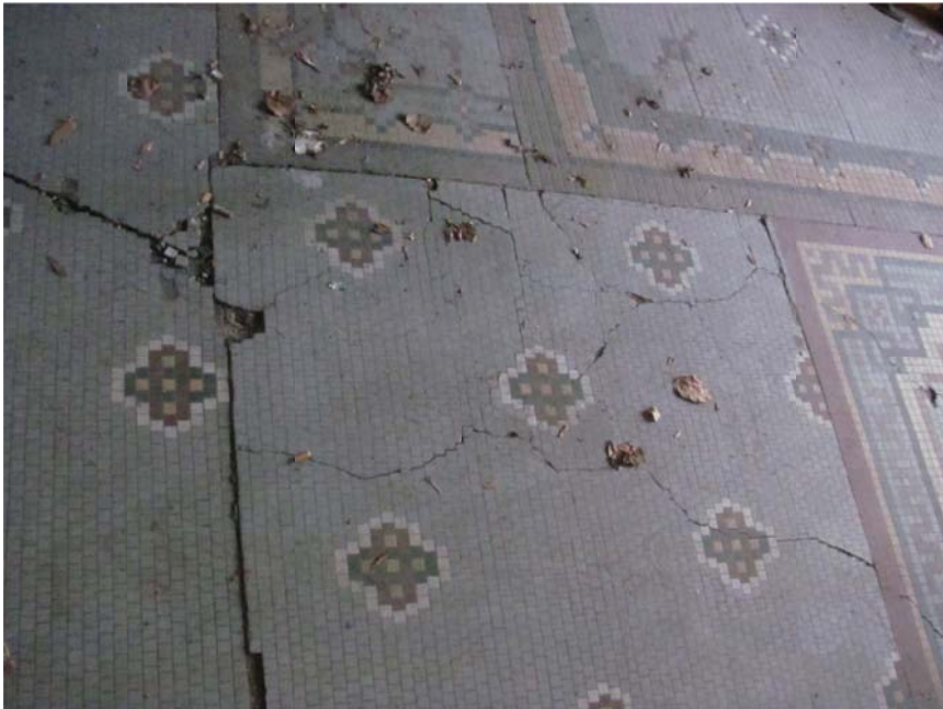
Figure 14. There is elaborate mosaic tile flooring at the first floor; the flooring has suffered extensive cracking and displacement.