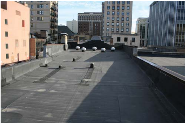
Roof view toward Mifflin Street