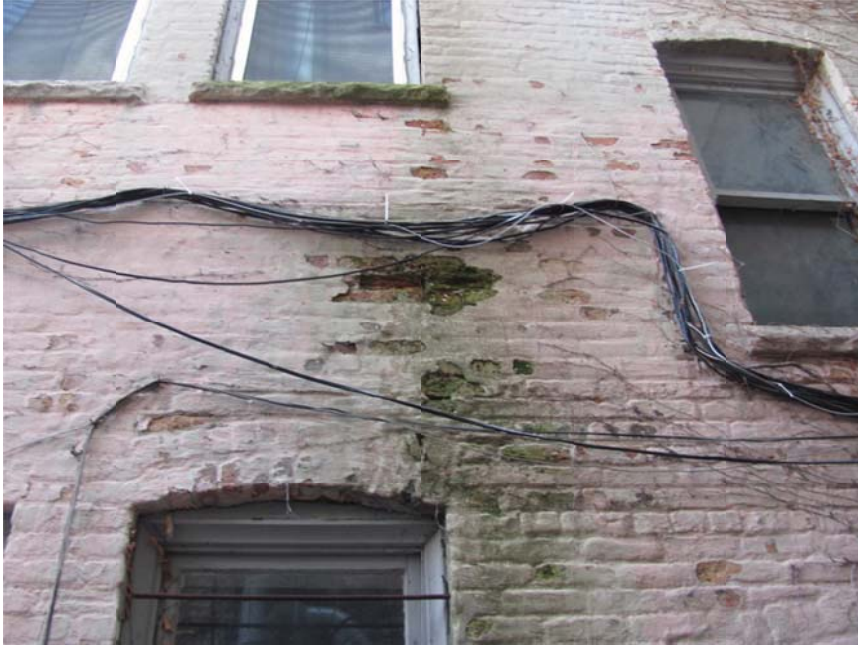
Figure 6. Deterioration of brick masonry at the rear facade.