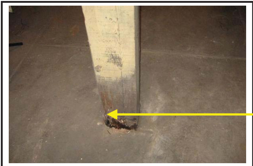
Figure 2 – Rooted column base in basement.