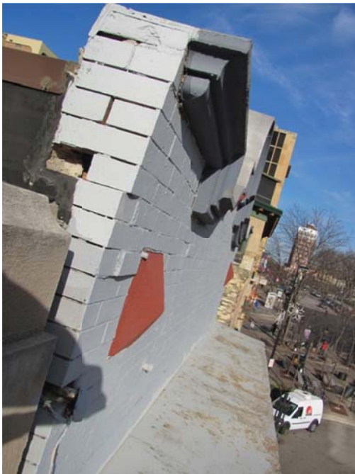
Figure 2. Left. View of displaced masonry at the top corner of the parapet wall.