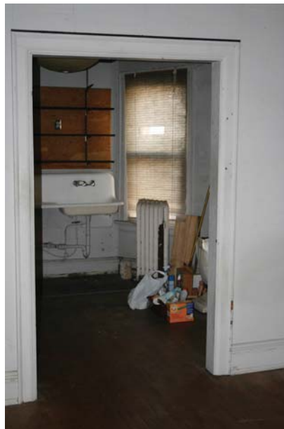
Second Floor Apartment