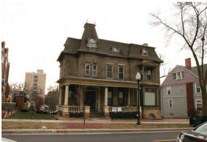
IMAGE 31: The John J. Suhr House built 1886-87 at 121 Langdon Street one of few remaining in the Second Empire Style.