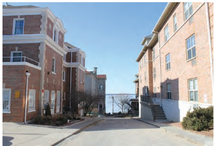
IMAGE 19: Looking north on East Lakelawn Place from the intersection with Lakelawn Place.