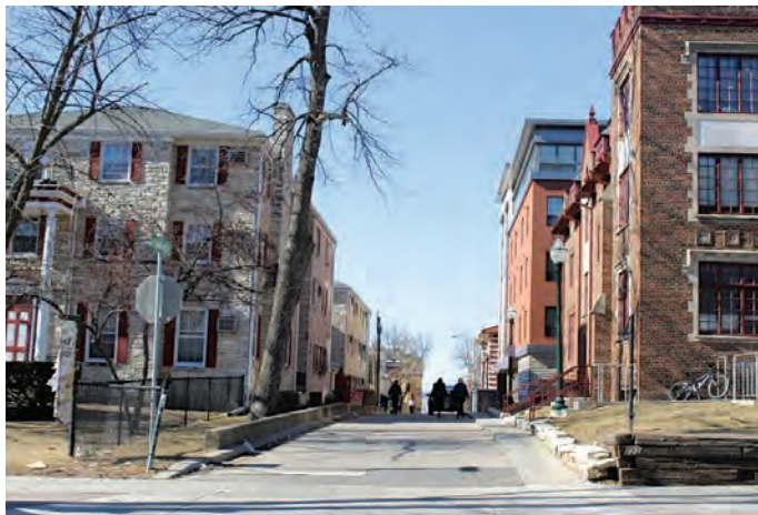
IMAGE 14: Streetscape looking toward Lake Mendota on West Lakelawn Place from the intersection with Langdon Street.