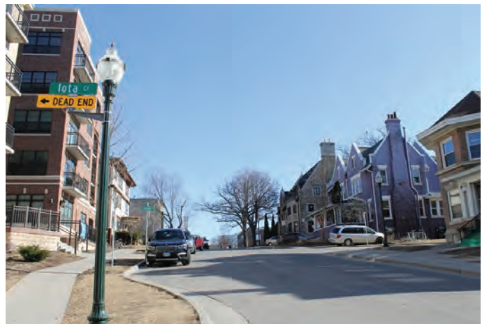
IMAGE 12: Streetscape looking southeast on Henry Street at the intersection with Iota Court.