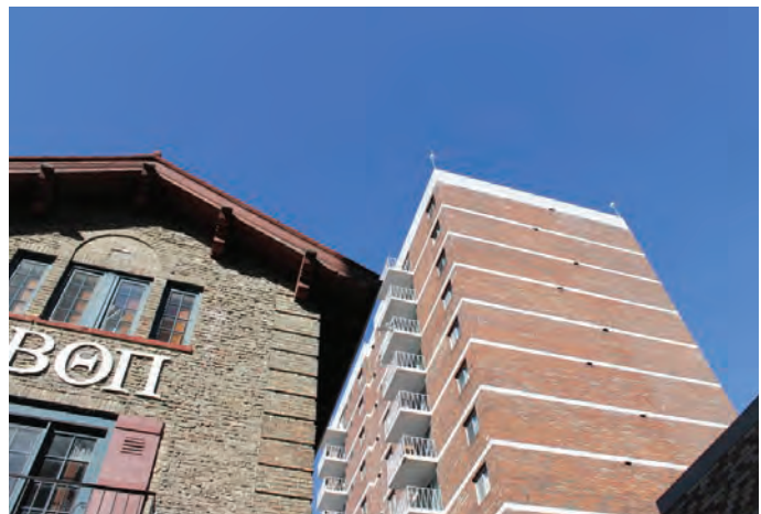
IMAGE 24: Scale shift between 622 (left) and 661 Mendota Court (right).

Neighboring structures can also impact how a building is viewed within the neighborhood context. A parking structure behind its larger scale building has become a predominate streetscape appearance at the end of Mendota Court, where smaller scale historic buildings line the lake side of the street. While it is inarguable that this parking structure is necessary, a more thoughtful approach might have retained a more neighborhood feel to the terminus of Mendota Court.