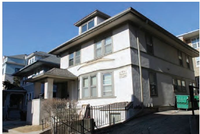
IMAGE 35: The Ole Norseman House, an American Foursquare house built at 609 Howard Place in 1914.

The American Foursquare is a 20th century house form characterized by a two-in-a-half story home. The plan is square with one room in each corner, and centrally located stair, and a hipped roof. Symmetrical placement of windows and dormers is only offset by either a centered or off center front entry. Porches are across the entire front of the first floor or only half. Detailing is straightforward with no ornamentation. This style's popularity was due in large part to mail order home catalogs. A Langdon neighborhood American Foursquare example includes: 609 Howard Place