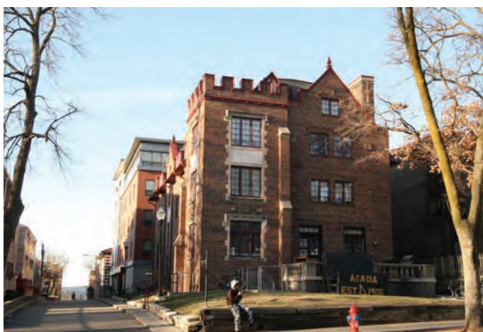
IMAGE 39: The original Phi Mu Sorority House at 222 Langdon Street was built in 1927 in the Tudor Revival Style.