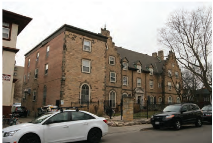
IMAGE 30: The original German Renaissance Revival Kappa Kappa Gamma Sorority House at 601 N. Henry Street, built 1929.