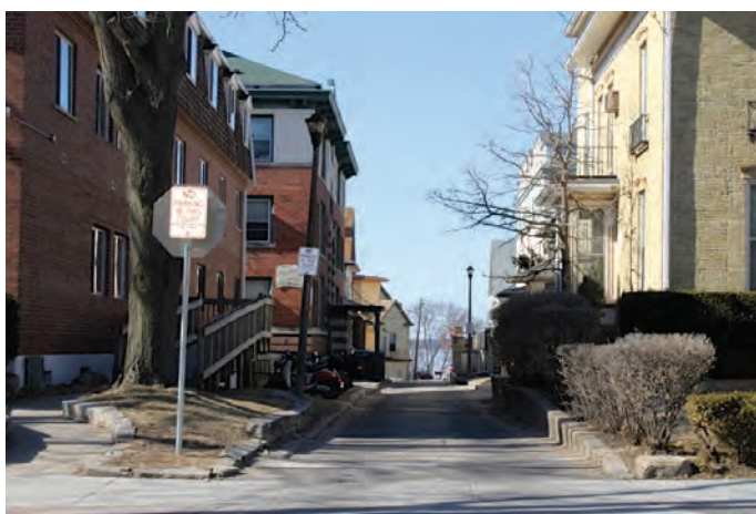
IMAGE 16: Streetscape looking toward Lake Mendota on Howard Place at the intersection with Langdon Street.

Sidewalks are limited-to-non-existent in these areas and street widths seem more appropriate for horse and buggy traffic rather than modern day automobiles. The scale of these streets' relationships to buildings and pedestrians is intimate. Pedestrians often walk in the roadway, safely so, as traffic is minimal. Wide walkways (easements) between parcels also exist to provide additional pedestrian and bicycle options for access to Langdon Street (one example is at the end of Mendota Court). One feels while walking through these streets and walkways that this is a truly a special place and this urban environment provides a glimpse into the past. These narrow streets exist in the Langdon neighborhood as larger lots were subdivided haphazardly to feed the need for student housing while still providing access to the parcels close to Lake Mendota. Regardless of the impetus, rarely can such an experience be had outside of Colonial area settlements such as Boston or Philadelphia, yet it exists here in Madison.