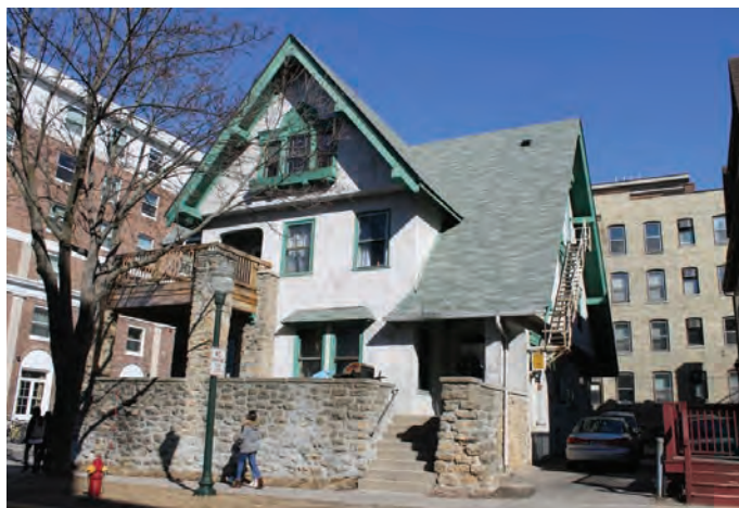
IMAGE 21: A residential scale home converted into apartments at 621 North Lake Street.