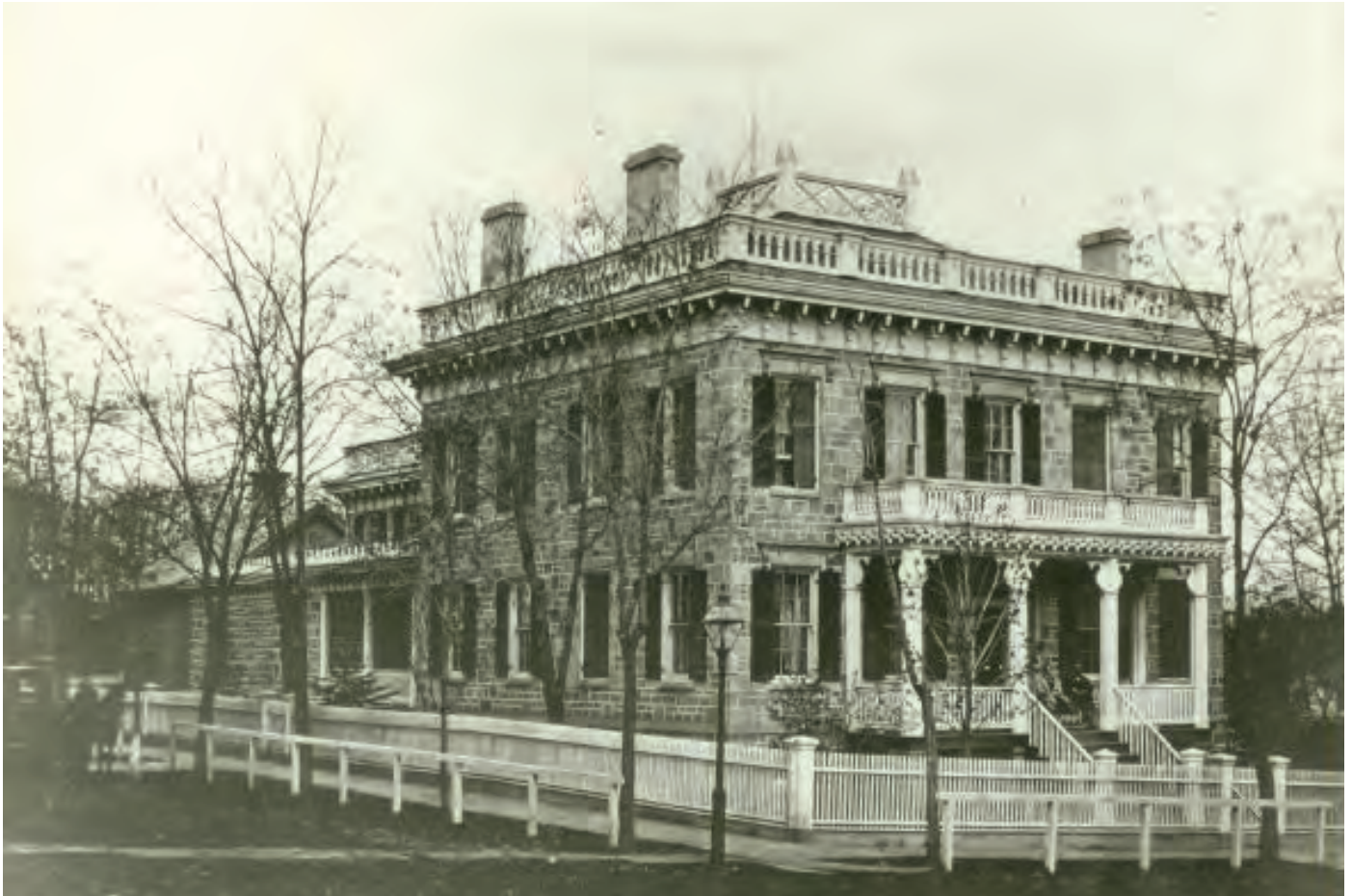
IMAGE 1: Levi Vilas House, one of the first mansions in the area, 1880.