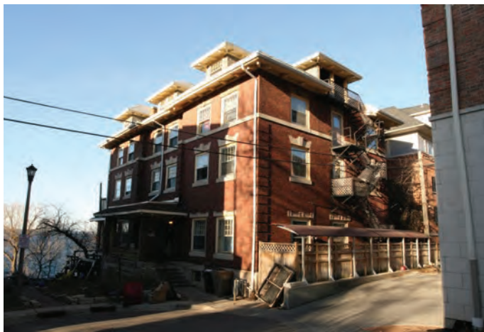
IMAGE 37: The Alpha Tau Omega Fraternity, 225 E. Lakelawn Place, is a nice example of a larger Craftsman Style building.