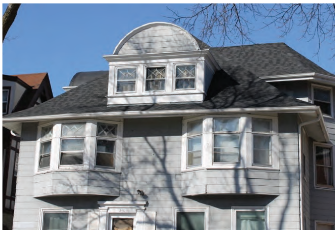
IMAGE 44: Bays, dormers, and other volumetric window articulation present on 248 Langdon Street is common throughout the district.