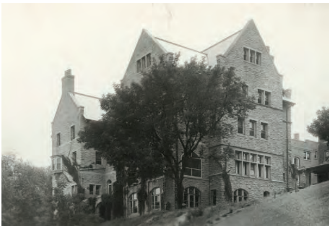
IMAGE 6: Chi Psi fraternity house, 150 Iota Court, 1917.