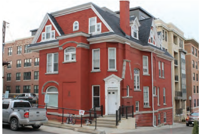
IMAGE 28: The Queen Anne style Halle Steensland House at 150 Langdon Street was built in 1892 and moved c. 1927 (largely altered).

Langdon neighborhood Queen Anne examples include: 127 Langdon Street 150 Langdon Street