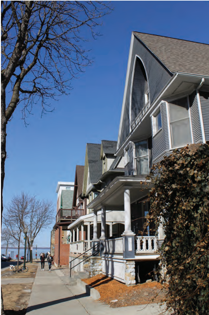
IMAGE 45: Looking at uniformity of size, scale, and rhythm of buildings on the east side of Lake Street north of Langdon Street.