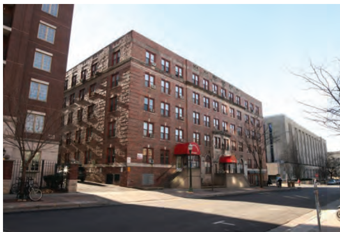
IMAGE 20: Large-scale apartment building at 633-635 Langdon Street.