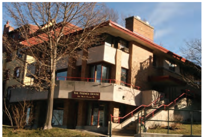
IMAGE 36: The French House at 633 North Frances Street designed in the Prairie Style and built in 1965.

Prominent between 1900-1920, the Prairie style is heavily influenced by Japanese and Arts and Crafts styles and forms. Asymmetrical configurations are prominent featuring low-pitched hip and gable roofs (cross or end), broad, flat central chimney, wide overhanging eaves, wings allowing windows on all three sides of a form, tall narrow casement windows (often in rows), and massive square porch supports. A Langdon neighborhood Prairie example includes: 633 N. Frances Street