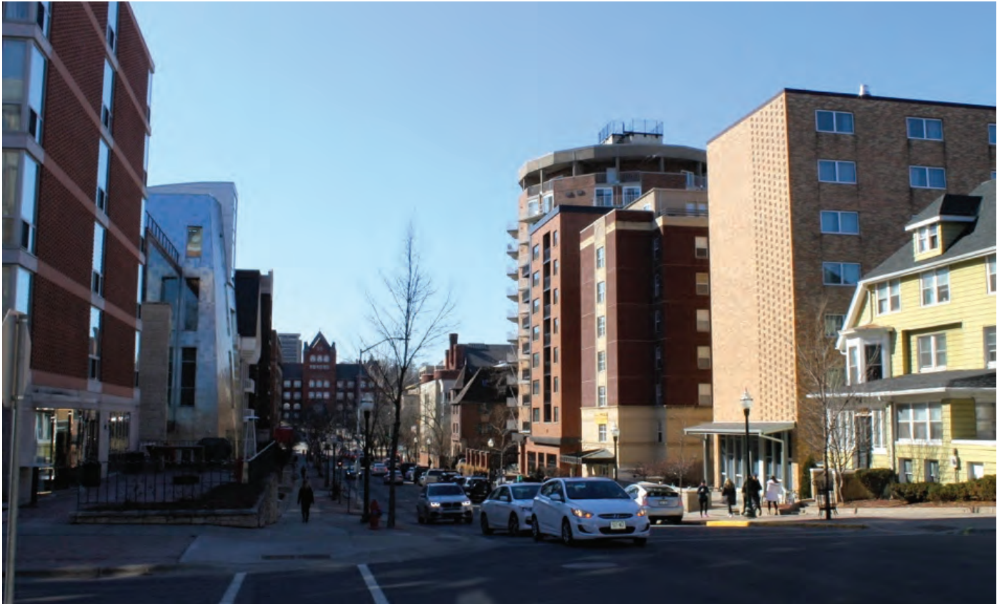
IMAGE 10: Streetscape looking west on Langdon Street from the intersection with North Frances Street showing larger scale, newer development closer to the University of Wisconsin-Madison.