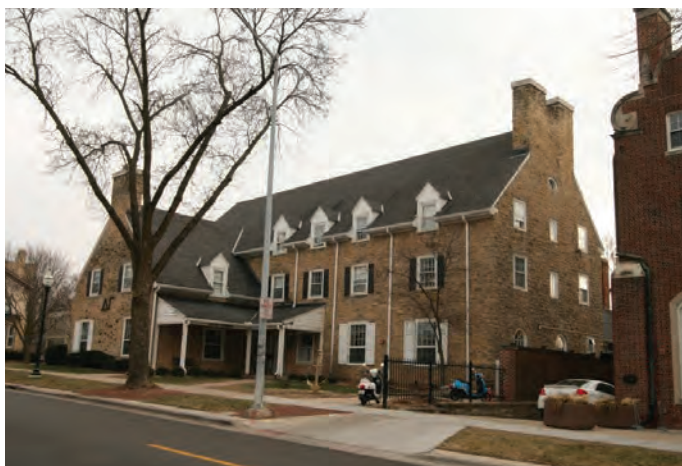
IMAGE 32: The Delta Gamma Sorority has occupied their Colonial Revival house at 103 Langdon Street since it was built in 1926.