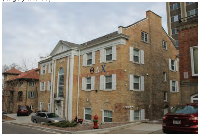
IMAGE 29: The original Georgian Revival Theta Chi Fraternity House built at 144 Langdon Street in 1924-25.

103 Langdon Street 124 Langdon Street 142 Langdon Street 144 Langdon Street