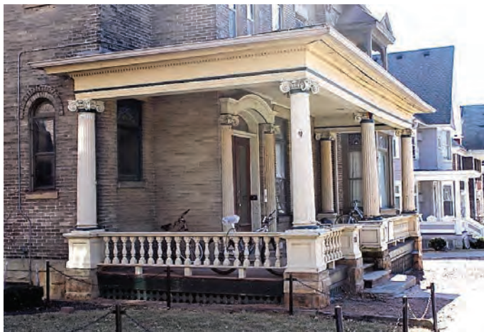
IMAGE 42: The porch at 121 Langdon Street is a good example of finely-detailed wood porch elements in the district.