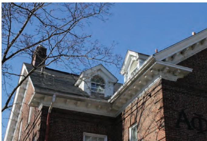
IMAGE 43: End gable moldings and dormers are prevalent throughout the district as seen here at 28 Langdon Street.