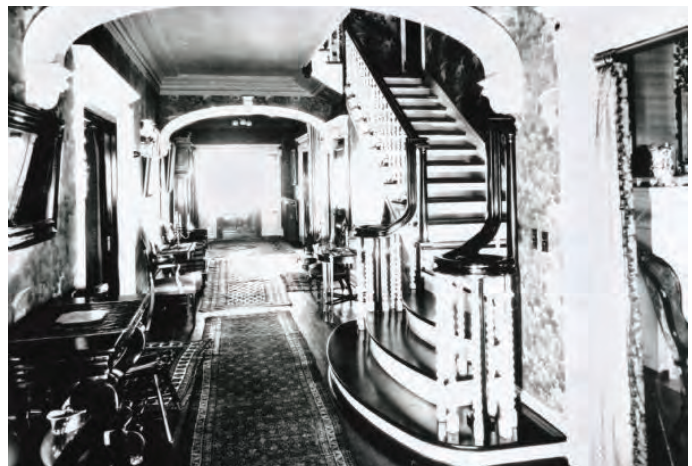
IMAGE 3: Interior of the Frank G. Brown House, 28 Langdon Street, 1905.