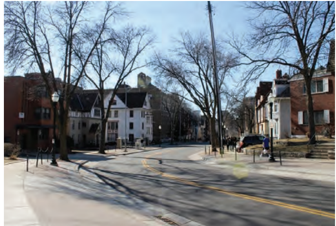
IMAGE 11: Streetscape looking northwest from the bend in Langdon Street near 237 Langdon Street.

A unique exception to this consistency within Langdon are the narrow roadways and dead-end courts. Mendota and Iota Courts, Lakelawn Place, East Lakelawn Place, West Lakelawn Place, and Howard Place exist in direct opposition to standard streets within Madison. These unique narrow streets have little front yard setback, with only a few feet separating buildings from roadways.