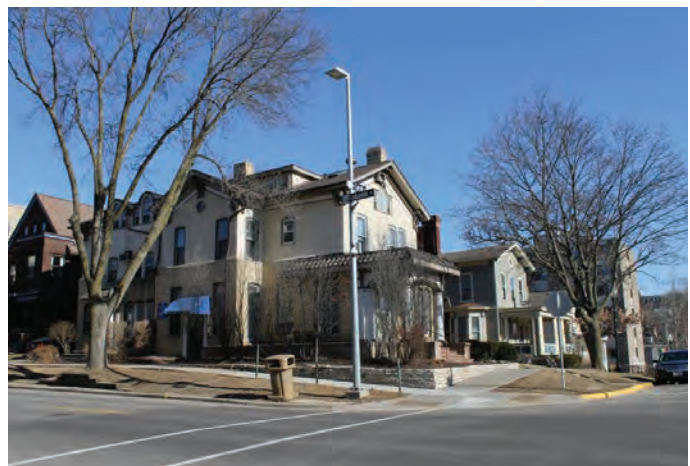
IMAGE 13: Streetscape looking northeast at the intersection of North Carroll and Langdon Streets.