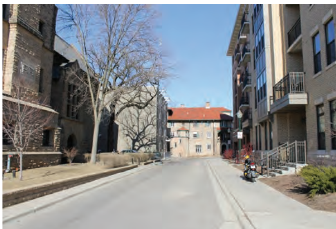
IMAGE 15: View looking northeast down Iota Court from the intersection with North Henry Street.