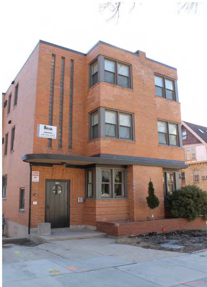
IMAGE 40: The Osborne Apartments at 245 Langdon Street are a nice example of Art Moderne built in 1961.