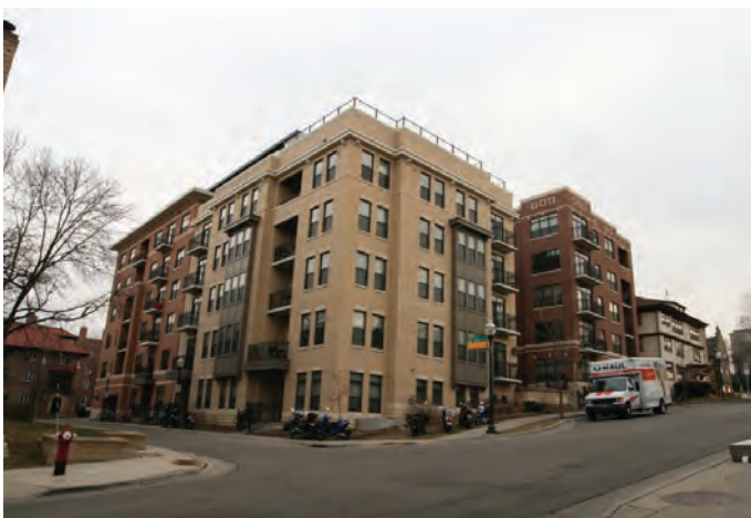
IMAGE 46: Large scale modern development at 633 North Henry Street combined several smaller scale parcels.

A neighborhood conservation overlay district or NCOD is a zoning tool used to preserve, revitalize, and enhance older, established neighborhoods and commercial districts to a level beyond the standard zoning code. A