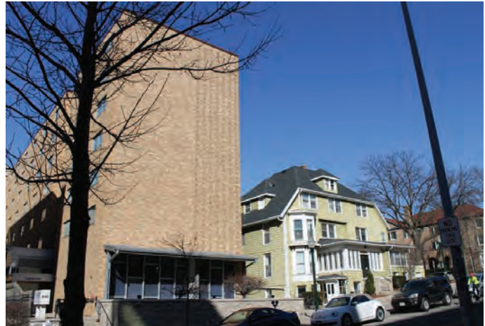
IMAGE 25: Scale shift between 610 (left) and 602 (right) Langdon Street.

The clear exception to this neighborhood pattern is modern era structures that not only have more floors than adjacent buildings but also out mass adjacent buildings. Large, broad, tall buildings (modern era) dominate the landscape in direct opposition to the continuity already present within the Langdon neighborhood. Several examples exist within the neighborhood where two-in-a-half story to three story structures that have typical historic character defining features such as sloped roofs and end gable parapets, sit next to contemporary shaft-like structures that tower over adjacent historic buildings. When this scale shift occurs, the neighborhood continuity is lost. Abrupt transitions in building scale undermine the neighborhood feel and character of the Langdon neighborhood.