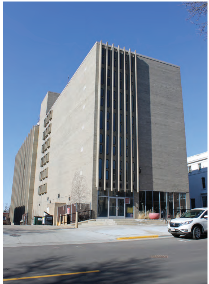
IMAGE 41: The Royal Tower was built at 126 Langdon Street in 1962 as a private dormitory in the Mid-Century Modern Style.