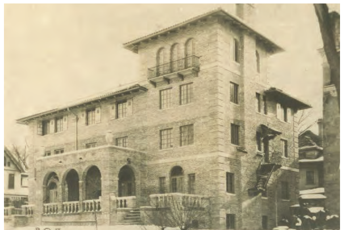
IMAGE 4: Beta Theta Pi Fraternity House built in 1925, 622 Mendota Court.