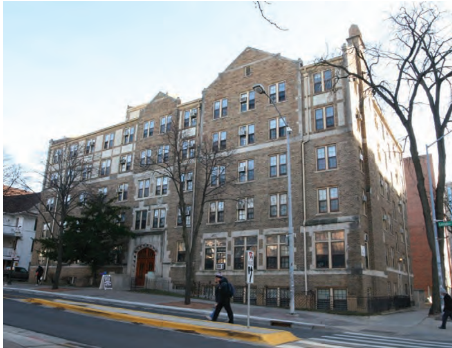
IMAGE 47: Large Period Revival apartment building at 265 Langdon Street.