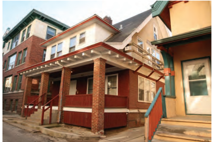
IMAGE 34: The Mary Harnden Bungalow was built at 622 Howard Place in 1909.

The bungalow is more a set of building principles than an actual style. Concepts used to create the bungalow form include materials that express their natural state, interconnected interior spaces, and a low, broad building form, typically one-and-a-half stories tall. Bungalows are often asymmetrical with hip or gable roof forms (most often the roof slope faces the street). Open soffits with exposed rafter tails, low-dormers, shingle patterns, and porches or verandas are also hallmarks of this style. This style's popularity was due in large part to mail order home catalogs where Bungalows were a featured style. A Langdon neighborhood Bungalow example includes: 622 Howard Place