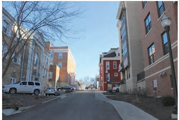
IMAGE 18: Side street providing access to 140 Langdon Street with varying, smaller setbacks.