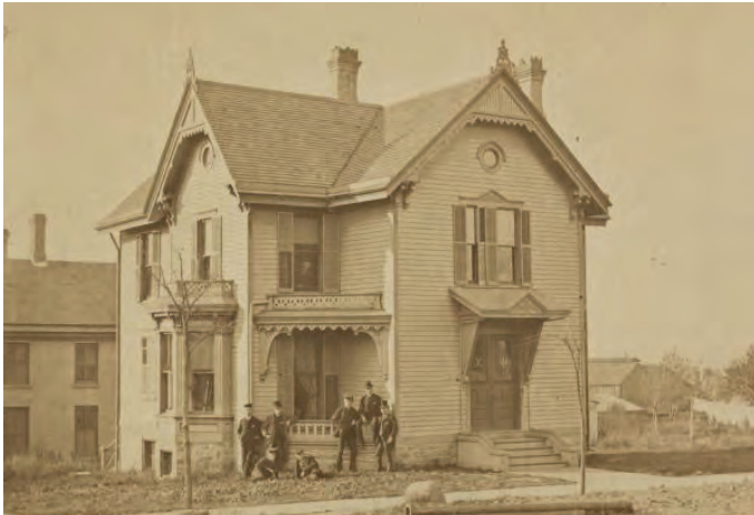
IMAGE 5: Chi Psi's first rental house, 602 Frances Street (demolished).