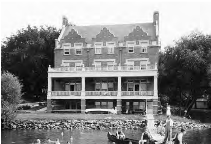
IMAGE 7: Delta Upsilon (644 N. Frances Street) from Lake Mendota, 1915.

company closed, ample land was made available for redevelopment catering to the growing student population of the nearby University. By 1902, Sanborn fire insurance maps show that the manufacturing site and several other lots were subdivided and built up. By 1908, Sanborn maps show even more dense development, especially closer to the University at Langdon Street and North Frances Street. The W.A.P. Morris House built in 1901-02 was the first to occupy new subdivisions platted north of Langdon Street up to the lakefront. Between 1890 and 1920, wealthy business and University professionals built houses on newly divided lakefront land.