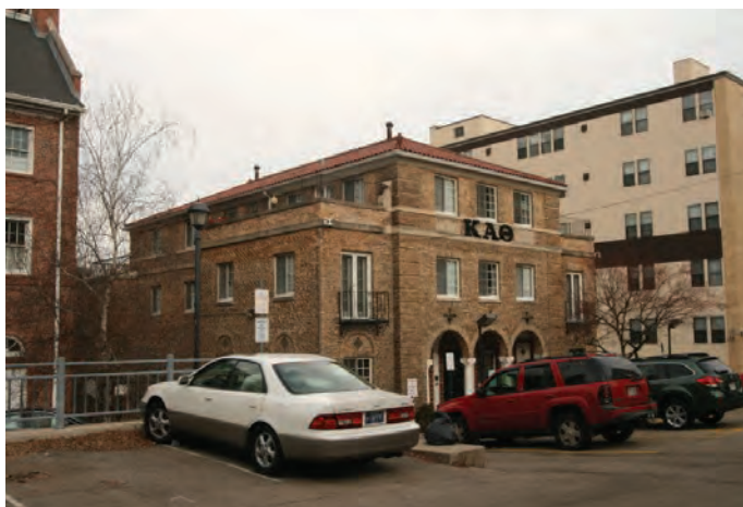
IMAGE 38: The Mediterranean Revival house at 108 Langdon Street was built in 1924 for the Acacia Fraternity.