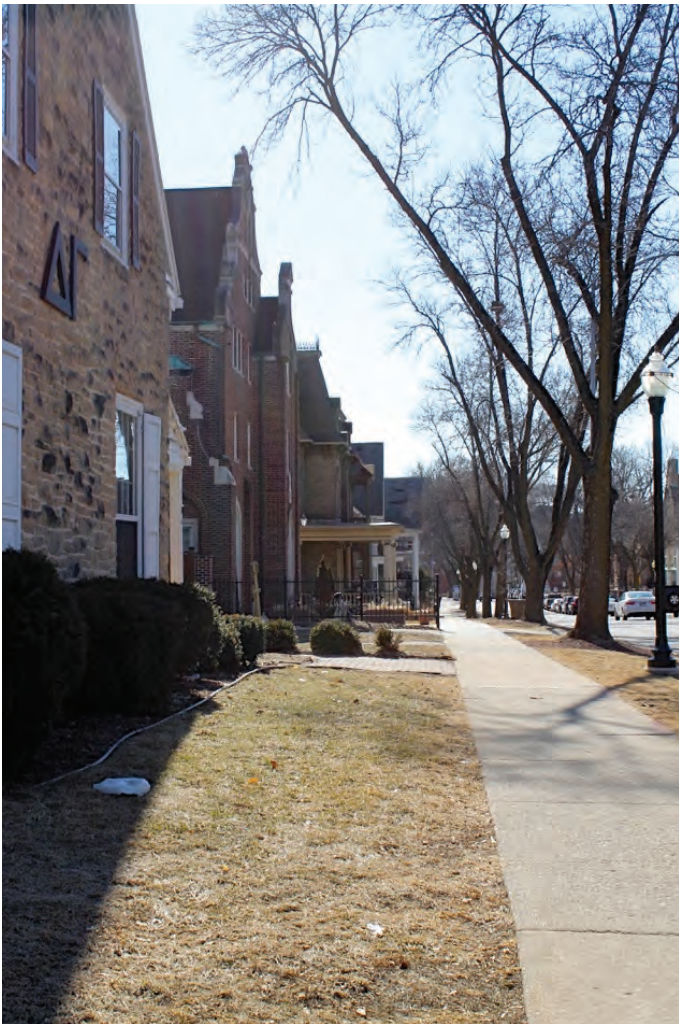
IMAGE 17: Uniform street setbacks and terraces at North Carol Street north of Langdon Street.

Spacing between buildings along side yards within a given street is fairly consistent, but does vary from street-to-street. This side-to-side spacing increases towards the northeast end of the Langdon neighborhood where building scale is smaller. Backyards vary based on parcel depth and juxtaposition. Lakefront properties have large yards facing the lake; these buildings typically were designed to address the lake, essentially turn their back on the street. Howard Place's southwest side abuts the backside of buildings at Langdon Street's dog leg, changing the character of both back yards. This spatial character or spacing is maintained relatively consistently throughout the neighborhood with the exception of a few surface parking lots.