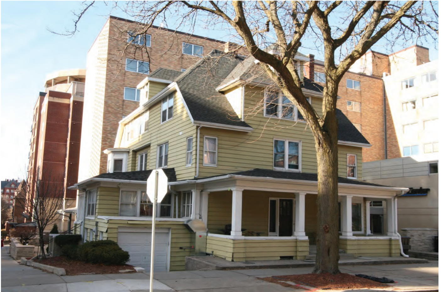
IMAGE 9: Looking west at Ella Cochrane House, 602 North Frances Street, with the Lowell Center and the Lowell Center at 610 Langdon Street and the Roundhouse Apartments at 626 Langdon Street in the background.