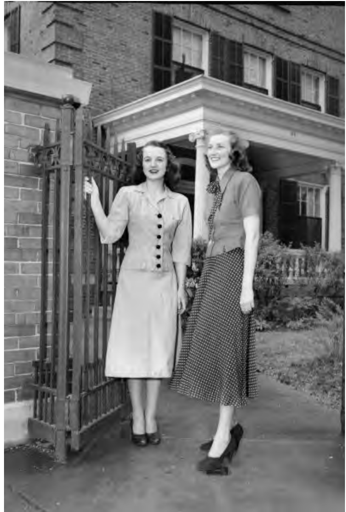
IMAGE 8: Members of Alpha Phi sorority during a 1948 Garden Party at their chapter house at 28 Langdon Street. The house was built for Frank G. Brown and converted to a sorority.

The National Register nomination for the Langdon Street NRDH was submitted in 1986. The district was added to the National Register of Historic Places on June 26, 1986.