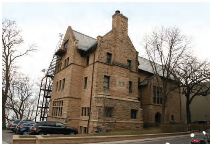
IMAGE 22: Residential scale, one of the first purpose-built fraternities in the district, Chi Psi at 150 Iota Court.