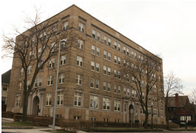
IMAGE 33: The Neo-Classical Revival Kennedy Manor Apartments at 1 Langdon Street was built in 1929.