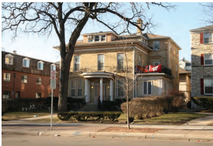
IMAGE 27: The Italianate style Sloan-Ogilvie House at 234 Langdon Street was built in 1875-76 and remodeled as a fraternity in 1928.