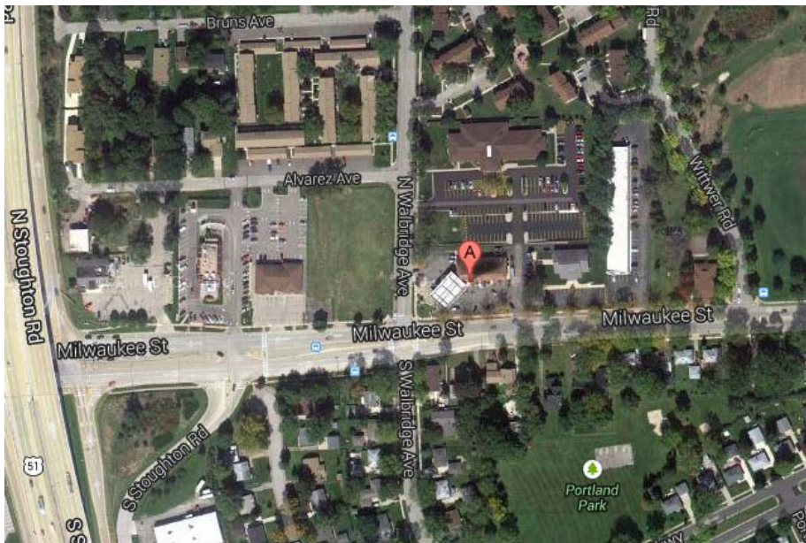
Google aerial view

Commercial property, constructed in 1979.