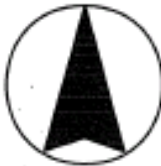
EXHIBIT C - REVISED 1/17/2007 (Page 1 of 3)