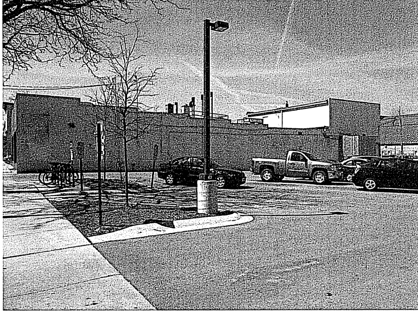
Plan B- Parking Lot Side – Site of Michael Owen Mural