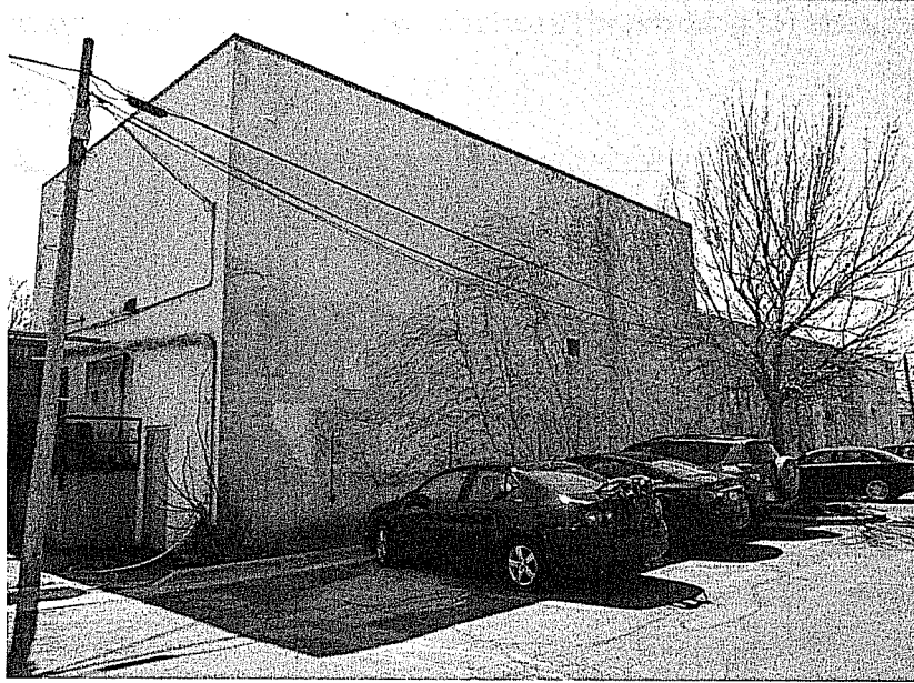
Plan B – Rear of Building – Site of Potential 3 rd Mural