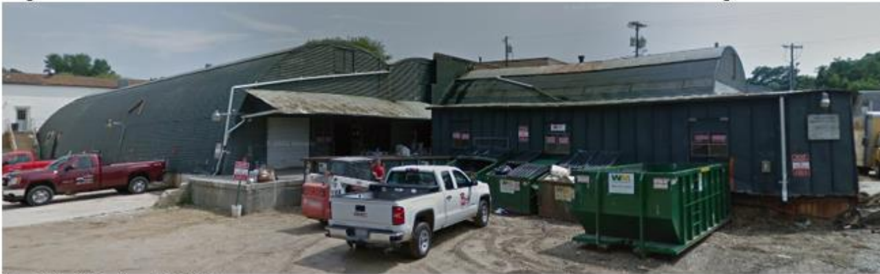
(rear of building)

Staff Recommendation: Staff recommends a finding of no known historic value, but recommends exploring the relocation or salvage of the Quonsets, particularly the triple Quonset.