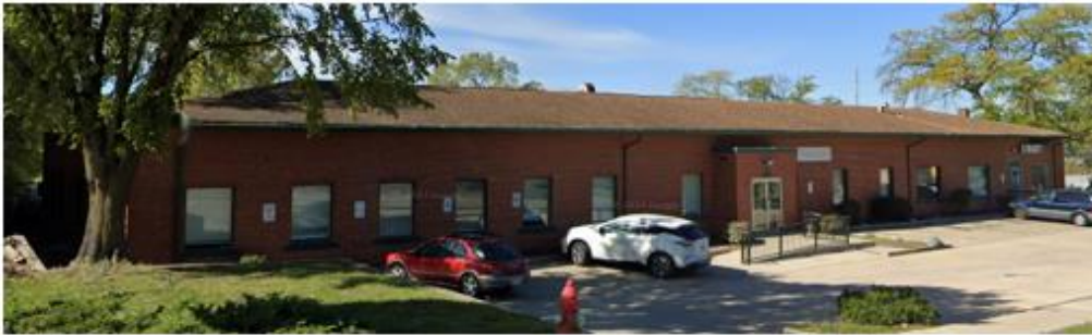
Google Street View