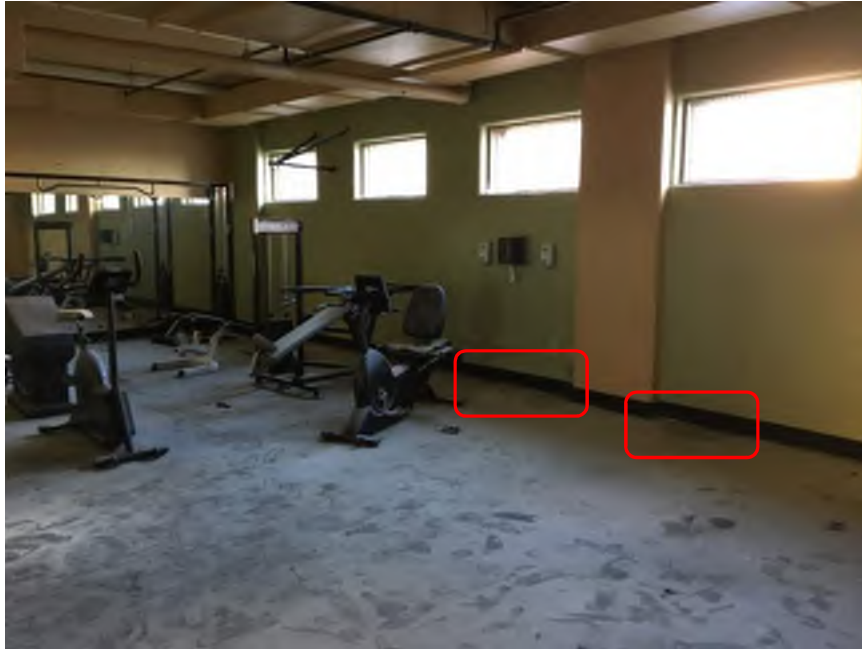
Figure 11: Sub-Basement Water Stain.