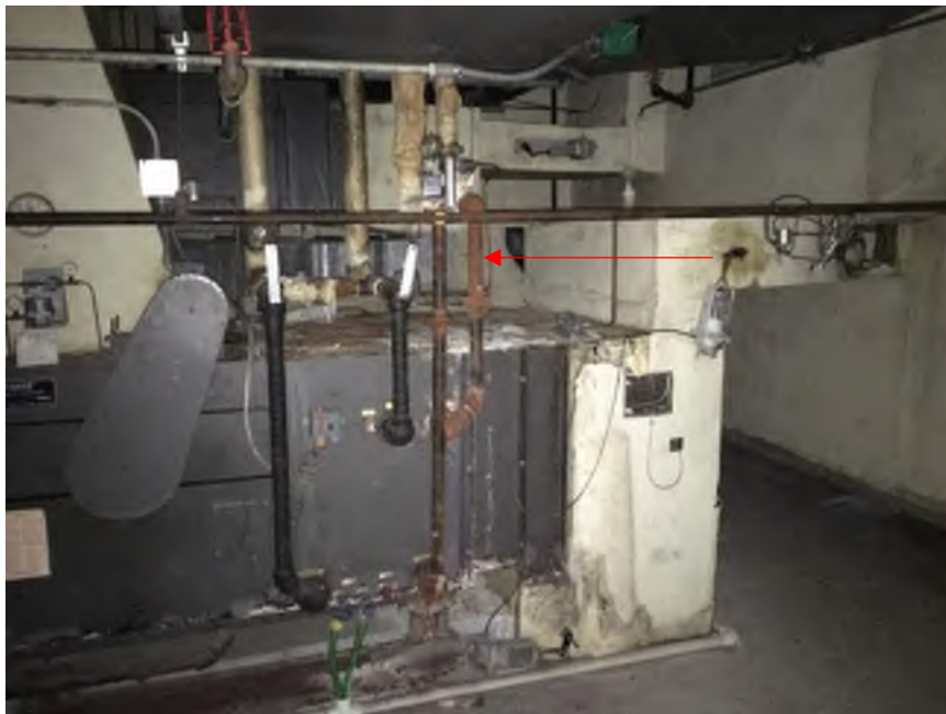
Figure 12: Sub-Basement Plumbing Piping and Fitting Corrosion.