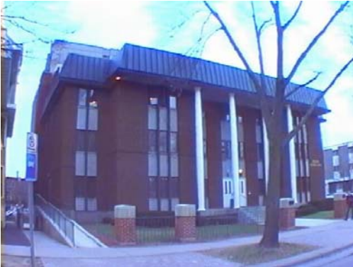
City Assessor's Office