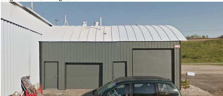
Google street view – October 2016