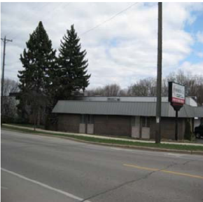
City Assessor's Office

Commercial building originally constructed in 1903