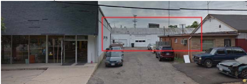
Google street view – August 2011

Contractor shop, date of construction unknown.