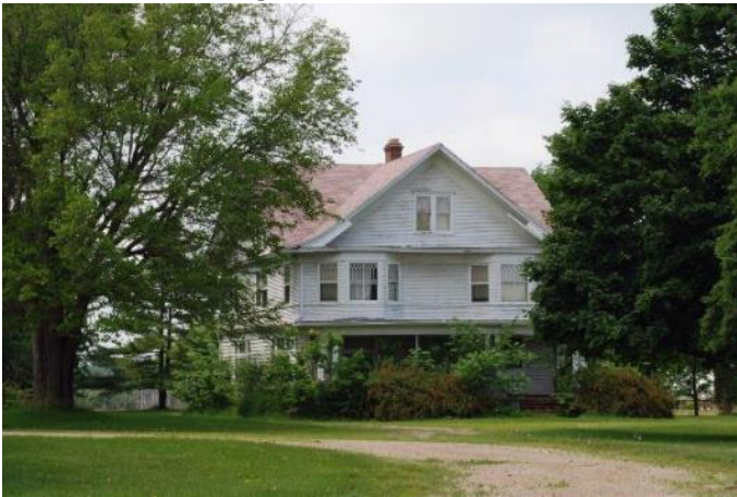
WI Historical Society

Commercial building, date of construction unknown.