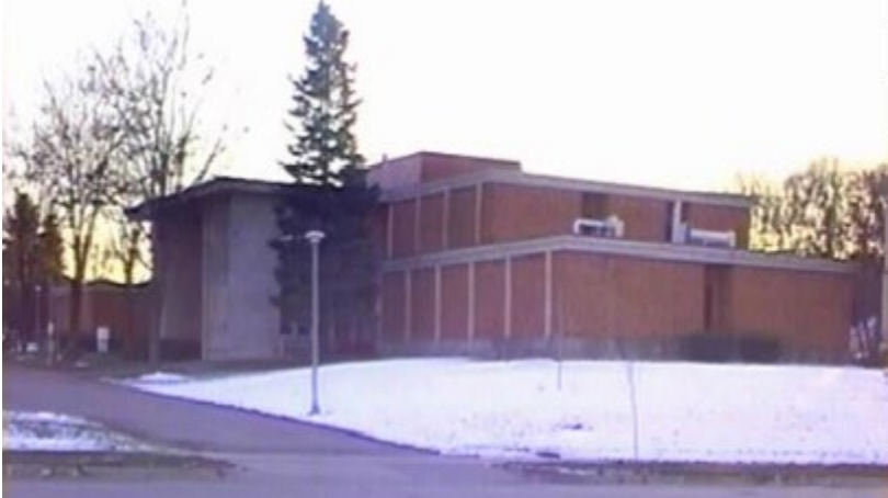
City Assessor’s Office

Commercial building, date of construction unknown.