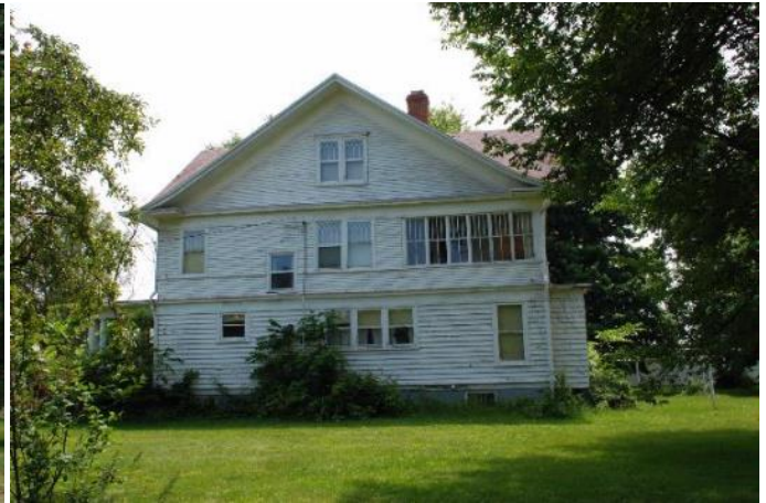
WI Historical Society