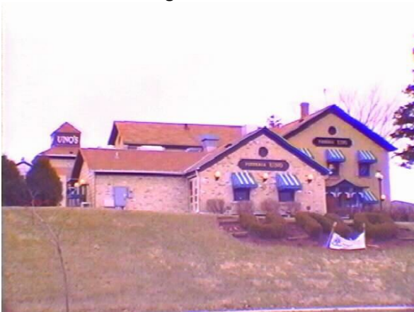
City Assessor's Office

Commercial building constructed between 1873-1890 and remodeled in 1981 with an addition in 1991.