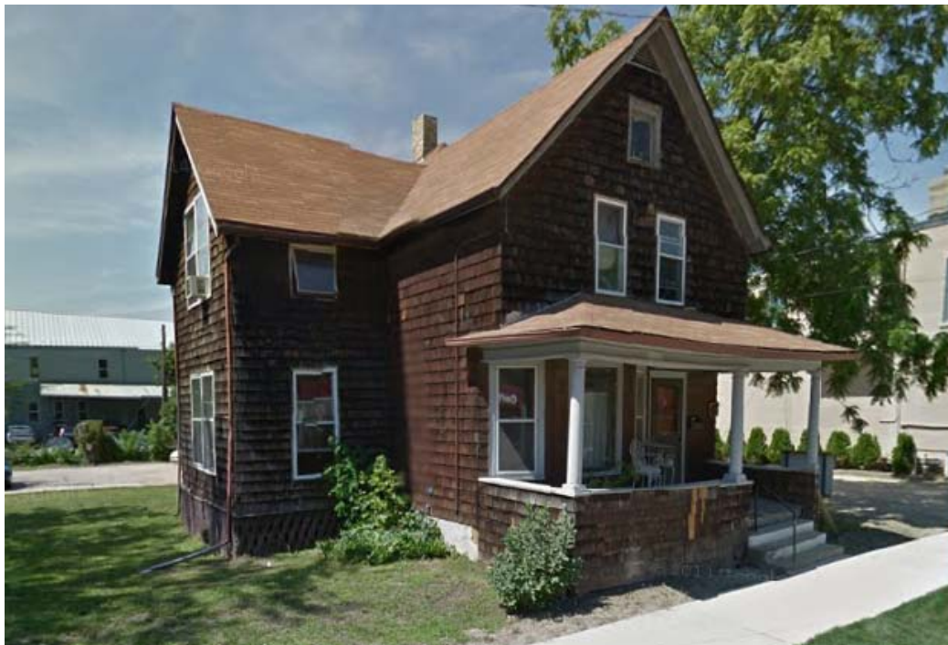
Google street view

Single family residence constructed in 1901.