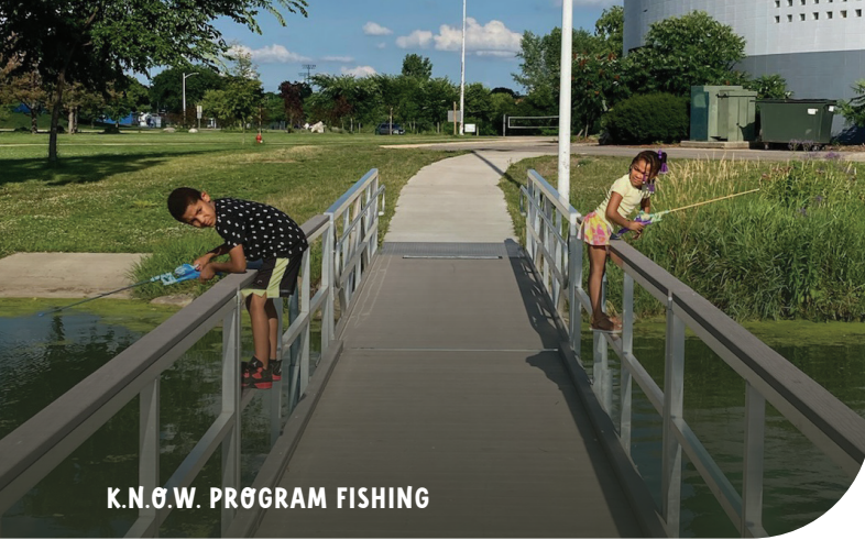
K.N.O.W. PROGRAM FISHING