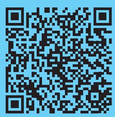
Scan to submit your nomination

Please nominate a youth, emerging leader, and/or adult who has demonstrated leadership and volunteerism while making significant contributions in the areas of: promoting peace, understanding, and improving communication & cooperation between diverse populations in Dane County.