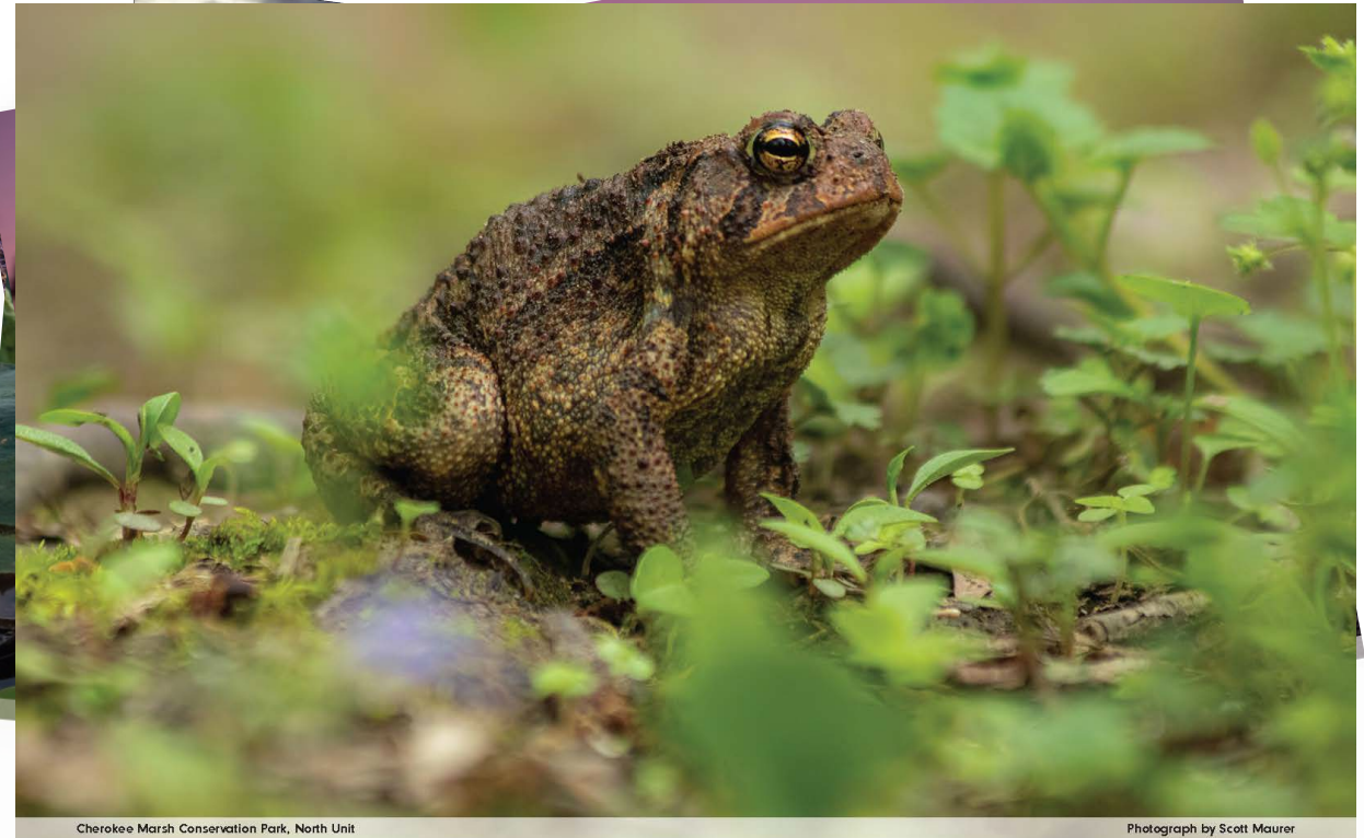
Cherokee Marsh Conservation Park, North Unit