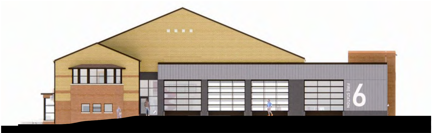
1 NORTH ELEVATION 1/16" = 1'-0"