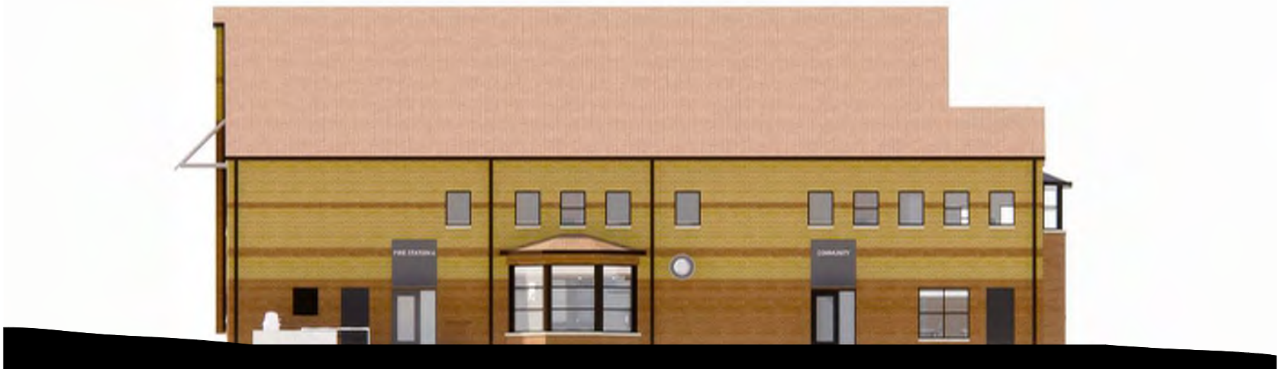
2 EAST ELEVATION 1/16" = 1'-0"