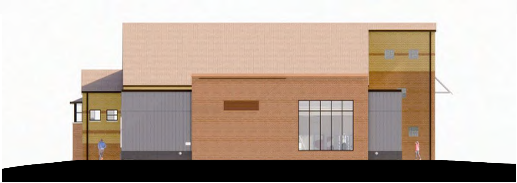
2 WEST ELEVATION 1/16" = 1'-0"