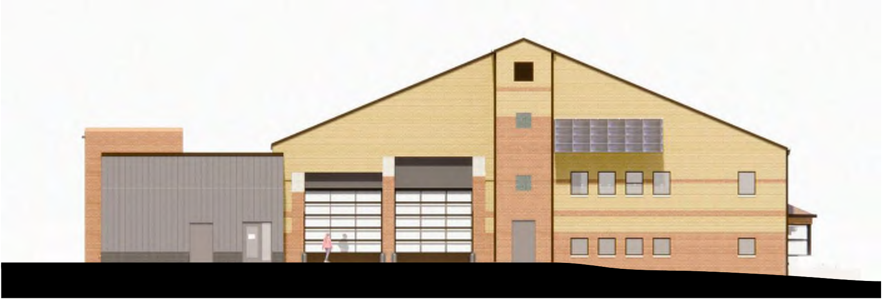
1 SOUTH ELEVATION 1/16" = 1'-0"