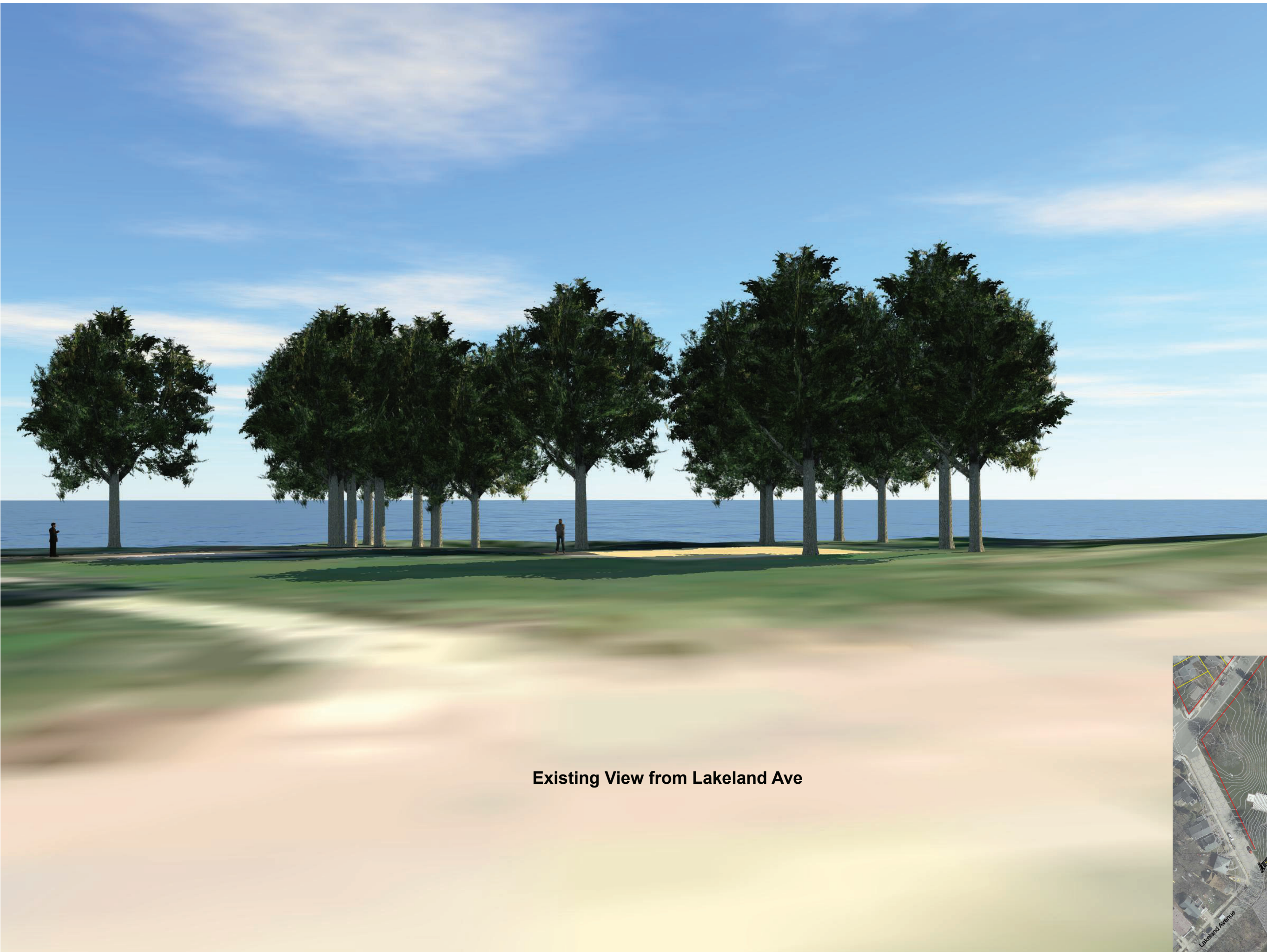
Existing View from Lakeland Ave

Olbrich Park - Atwood Ave/ Lakeland Ave Path Connection