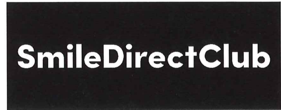
SIMULATED NIGHT VIEW