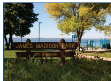
Scenes from James Madison Park