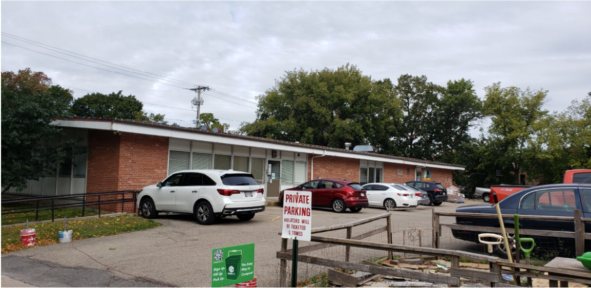
Exterior - South East Corner