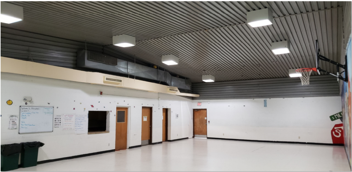
Interior – Sub-basement Gymnasium