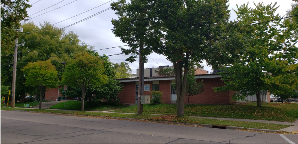
Exterior - South West Corner