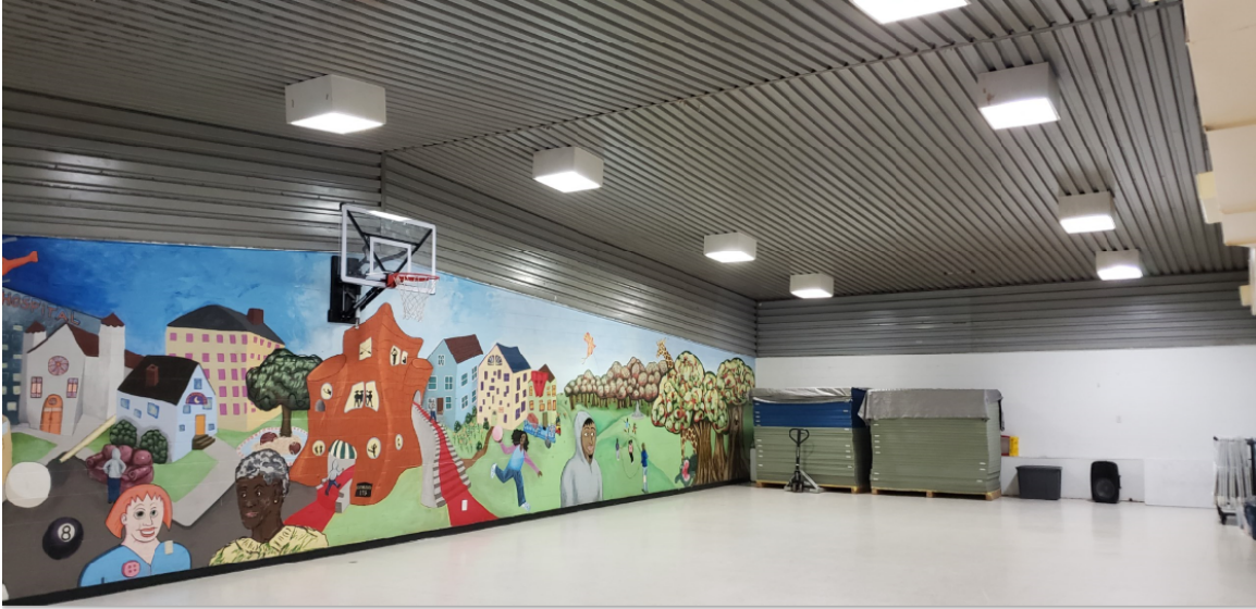
Interior – Sub-basement Gymnasium