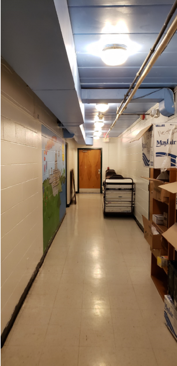
Interior – Basement Corridor