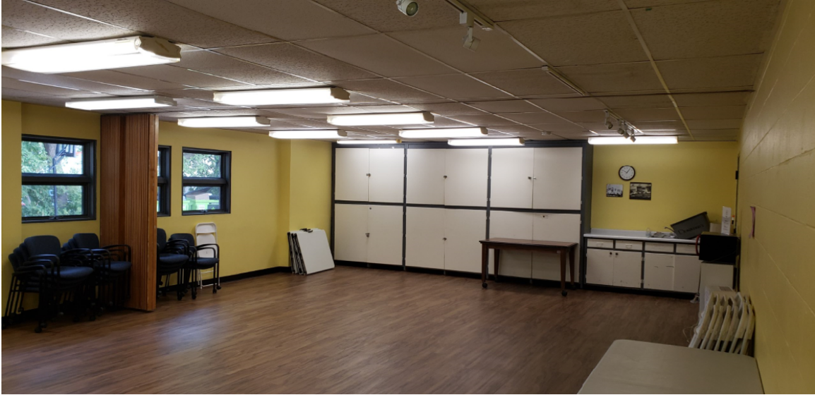
Interior – First Floor Meeting Area