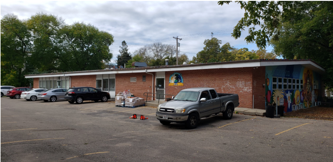
Exterior - North East Corner