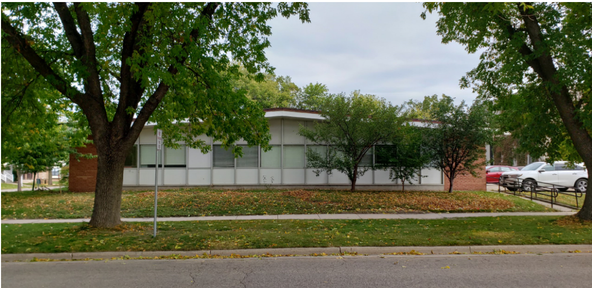
Exterior - South Façade