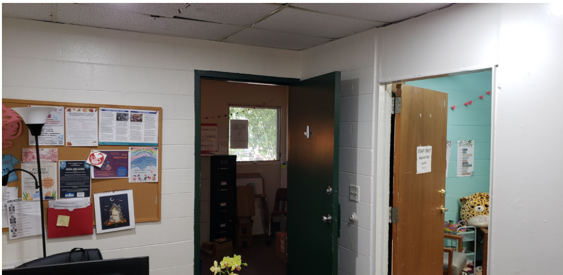
Interior – First Floor Office Area