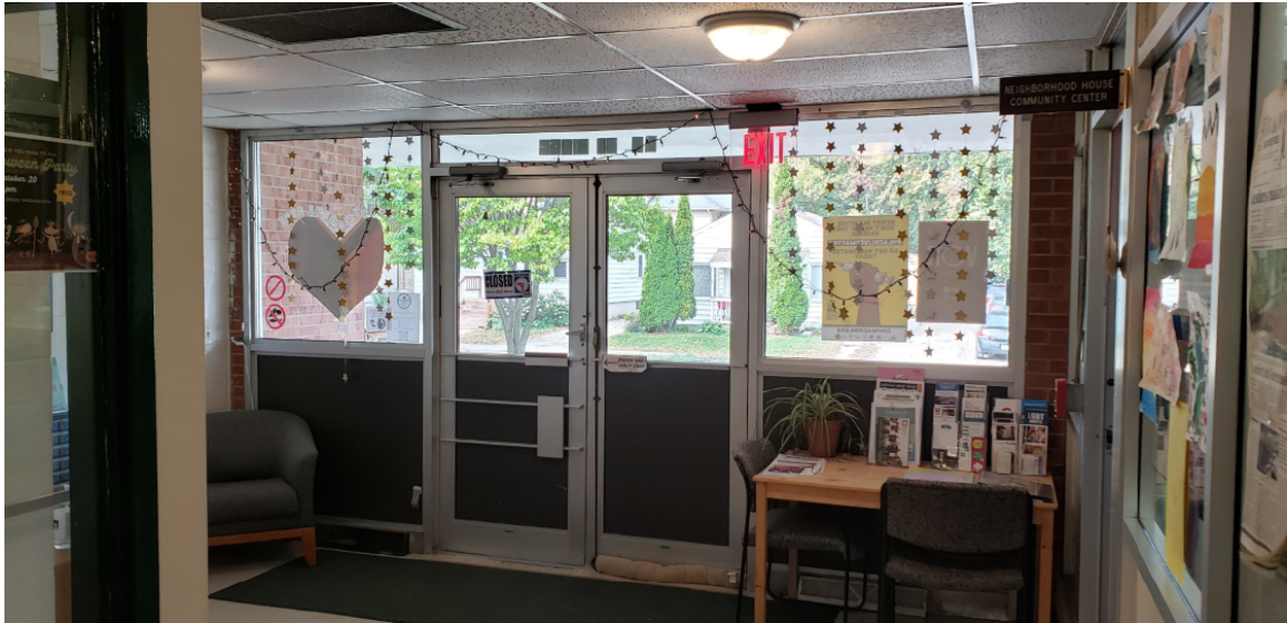
Interior – Entry Lobby