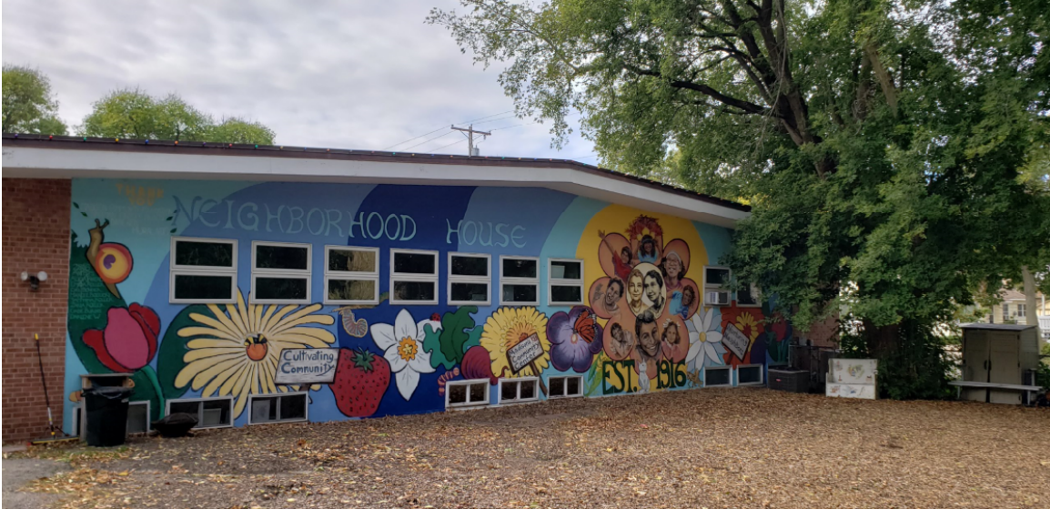
Exterior – North Façade