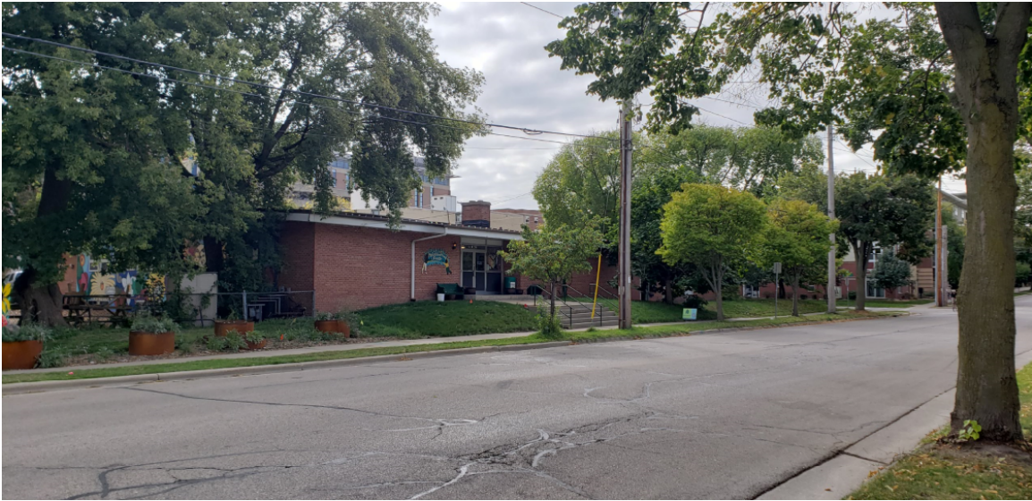
Exterior - North West Corner