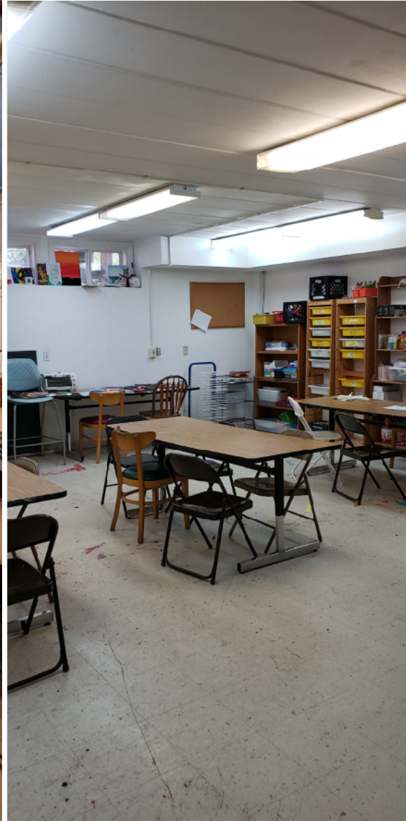
Interior – Basement Classroom