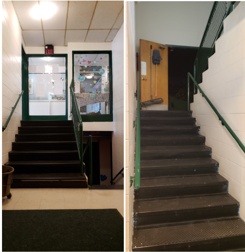
Interior – Stairwell