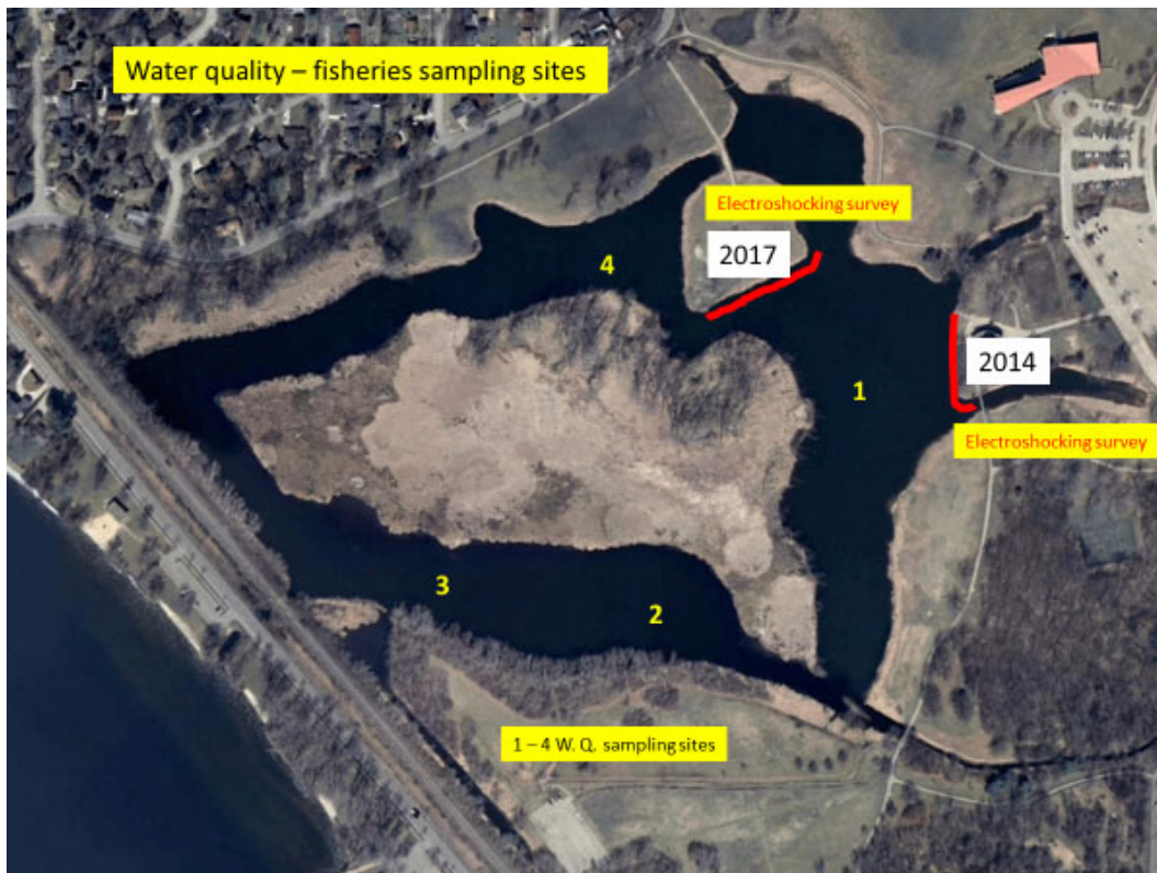
FIGURE 4: 2014 AND 2017 SAMPLE LOCATIONS

The highest water clarity measurements occurred at site 4 that also appeared to coincide with greater rooted aquatic plant growth in 2017, particularly coontail ( Ceratophyllum demersum ). While secchi measurements were not significantly different between 2014 and 2017, turbidity measurements using the Hach Turbidimeter 2100 suggested clearer water at three of four sites in 2017. These data appeared to reflect an increase of rooted aquatic plants in 2017, primarily coontail. Site 1 consistently displayed the lowest water clarity in both secchi and turbidity measurements.”