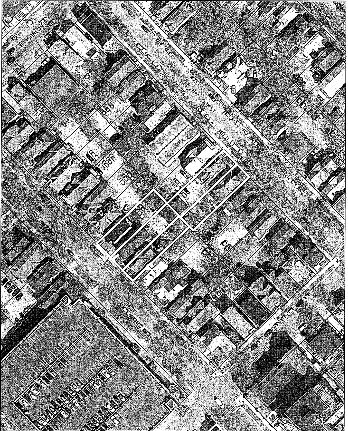
Date of Aerial Photography : Spring 2010