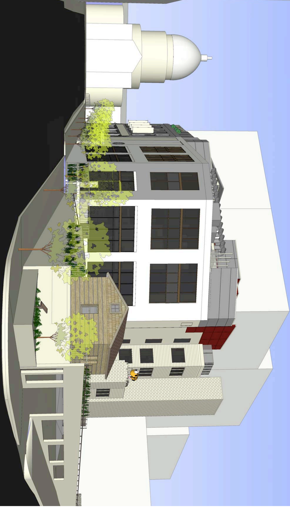
Madison Children's Museum ~ Garden Deck & Log Cabin Design Coalition, Architects ~ Madison, Wisconsin ~ 24 Jun 09