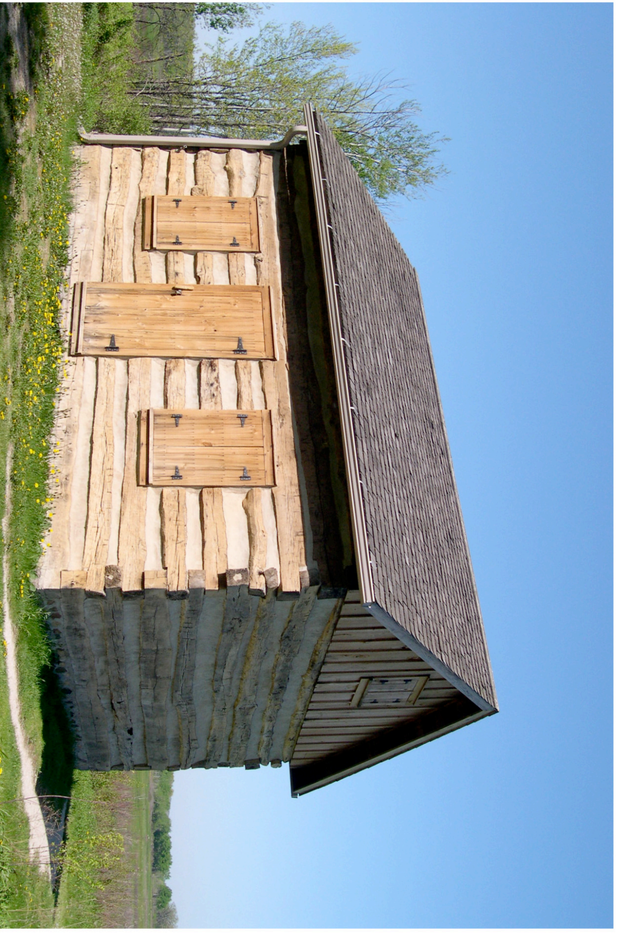
Photo of the recently restored Gotten Cabin ~ very similar to Madison Children's Museum's historic 1838 log cabin