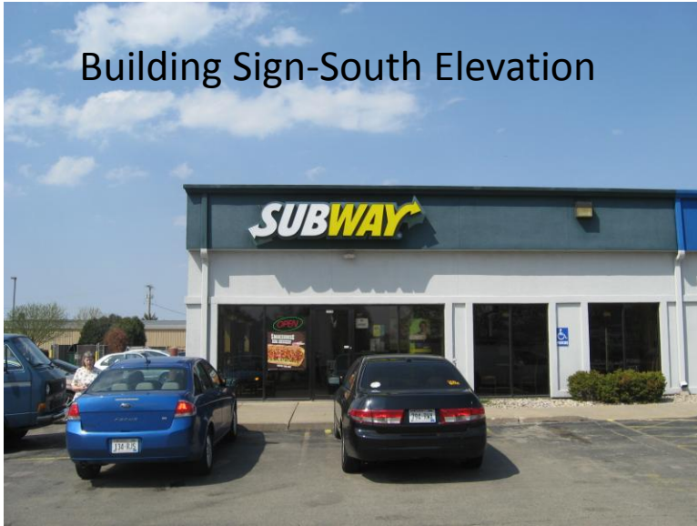
Building Sign-South Elevation