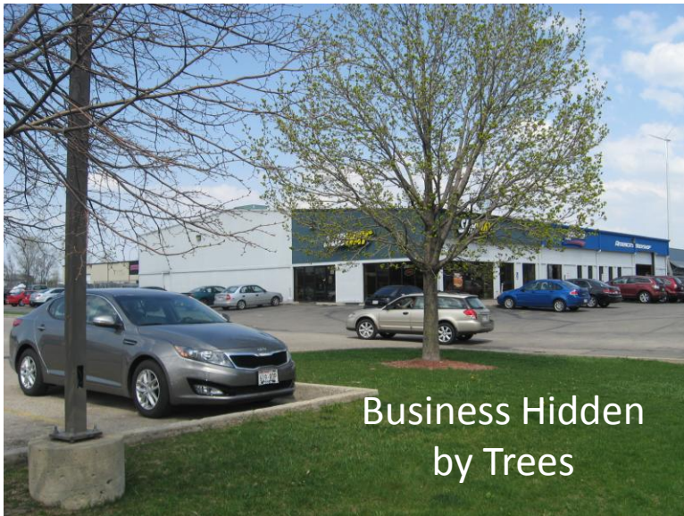
Business Hidden by Trees