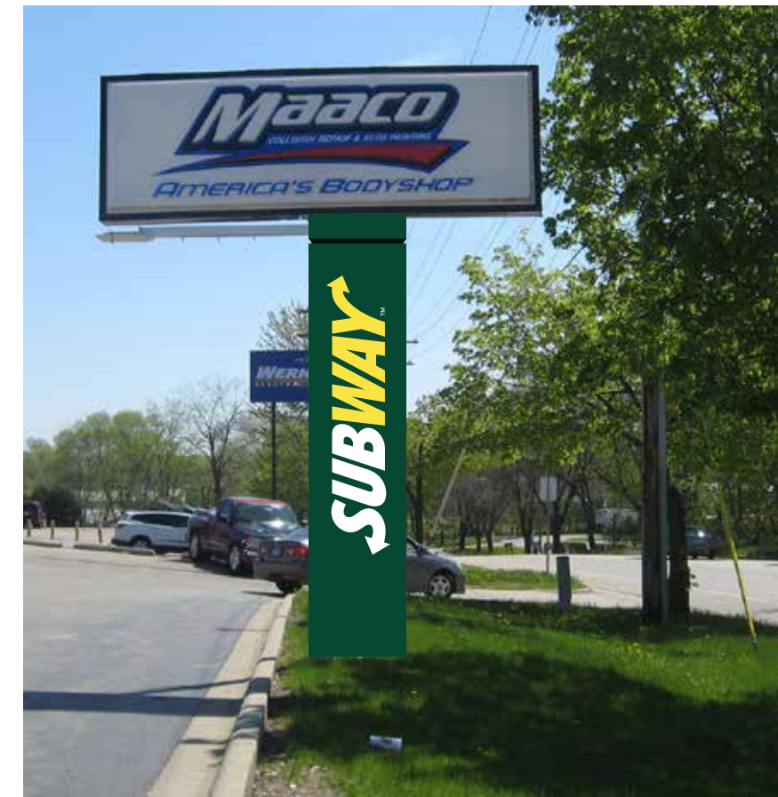
Sign in Place

Area of logo is 14 square feet per side.