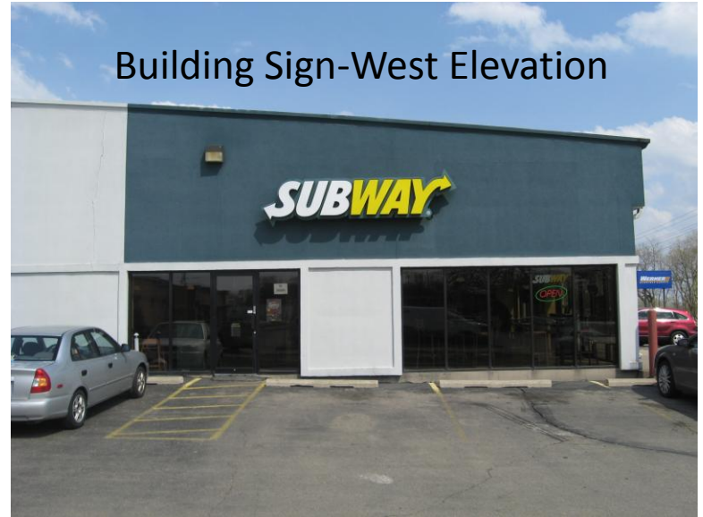
Building Sign-West Elevation