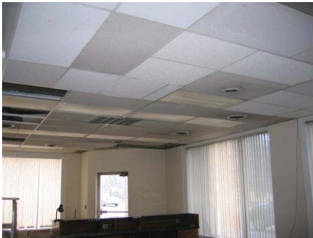
First floor lights.