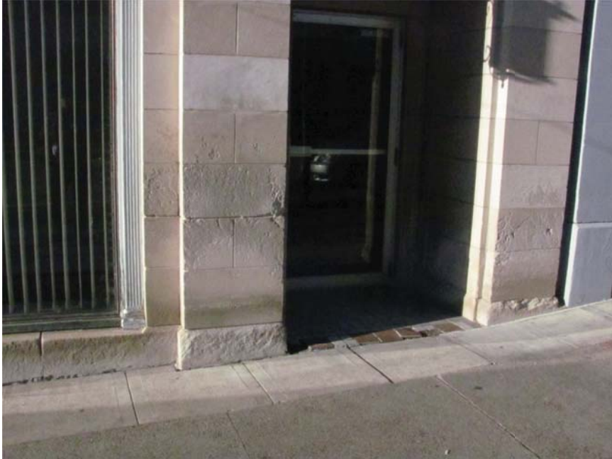
Figure 4. Portions of the limestone masonry near grade exhibit erosion and pitting of the face.