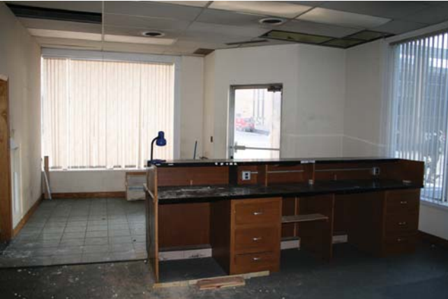
First Floor: View toward entry at corner of West Mifflin Street and North Fairchild Street