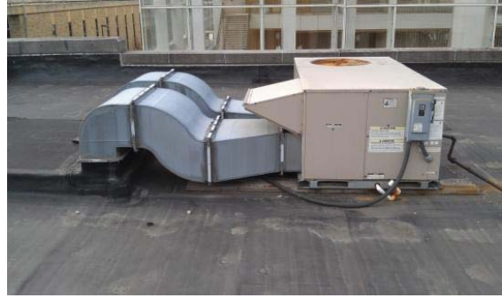
One of two packaged rooftop units