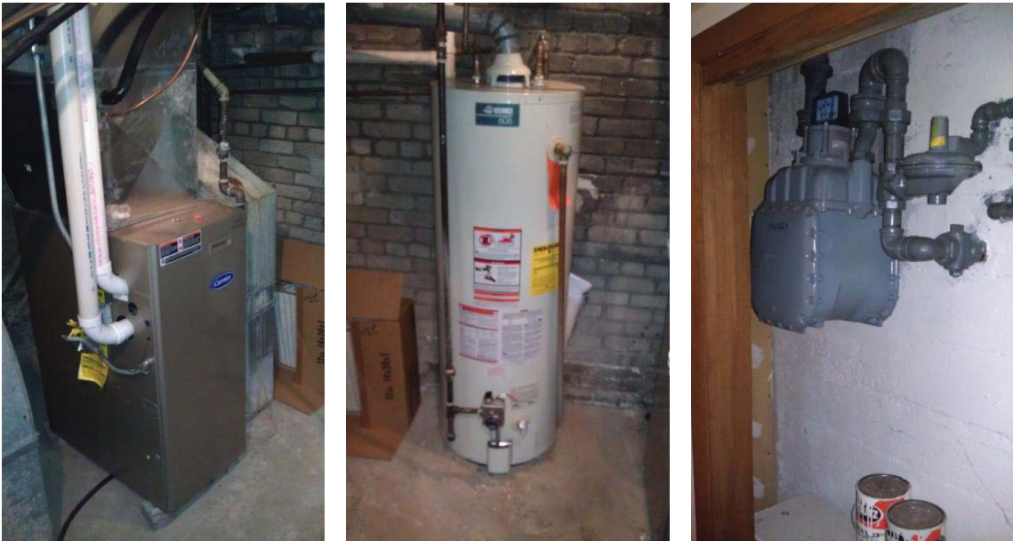
One of four identical furnaces, the water heater, and gas meter

The heating and cooling system consists of four basement furnaces and two packaged rooftop units. Two furnaces serve the basement, two serve the first floor, and the rooftop units serve the second floor. Hot water is provided by a gas-fired domestic water heater in the basement. The roof is pitched to drain into a single roof drain. Four condensing units associated with the furnaces are located on the roof. The sanitary system is a mixture of newer and existing piping. The roof drains into one corner of the roof with a single roof drain.