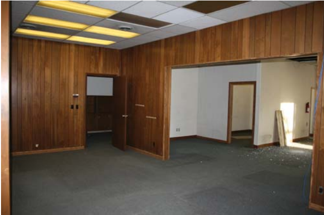
First Floor: View of office area