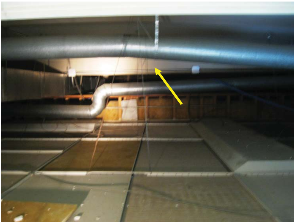
Photo 2 – Typical steel girder (encased) supporting 2 nd floor wood joists