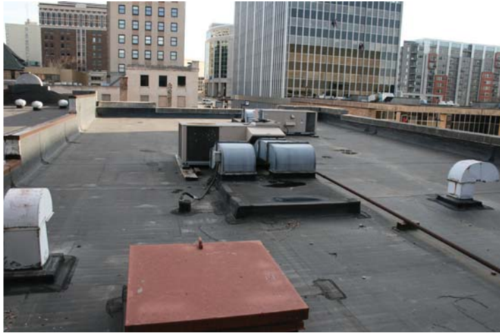
View of Roof