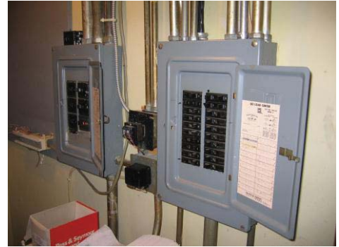
Electrical panels on 2 nd floor.