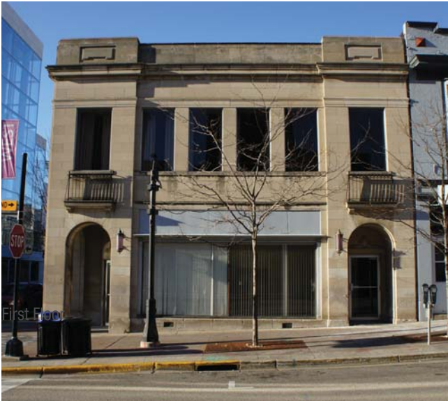
View of Front Facade