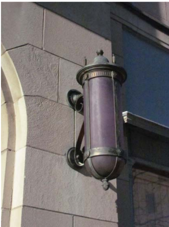
Figure 2. Left. Decorative brass and glass exterior light fixture.