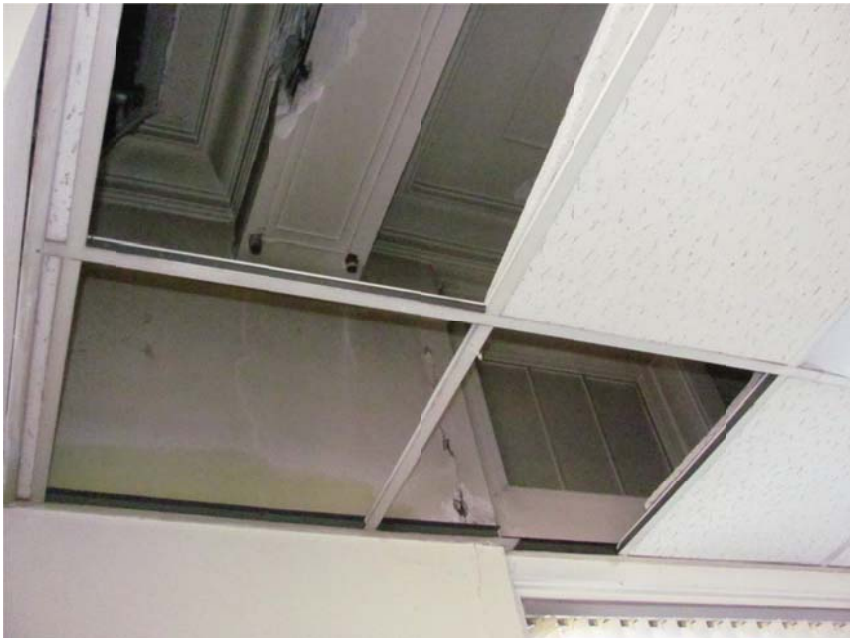
Figure 9. The original plaster ceiling and cornice are present above the suspended acoustical ceiling system. Also note the original transoms at the first floor storefront.