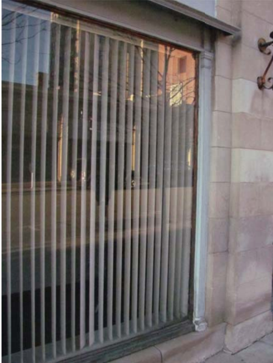
Figure 6. The storefront facing Mifflin Street has a bronze frame and fluted bronze pilasters as window jambs.