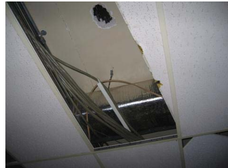
Electrical cables on 2 nd floor.