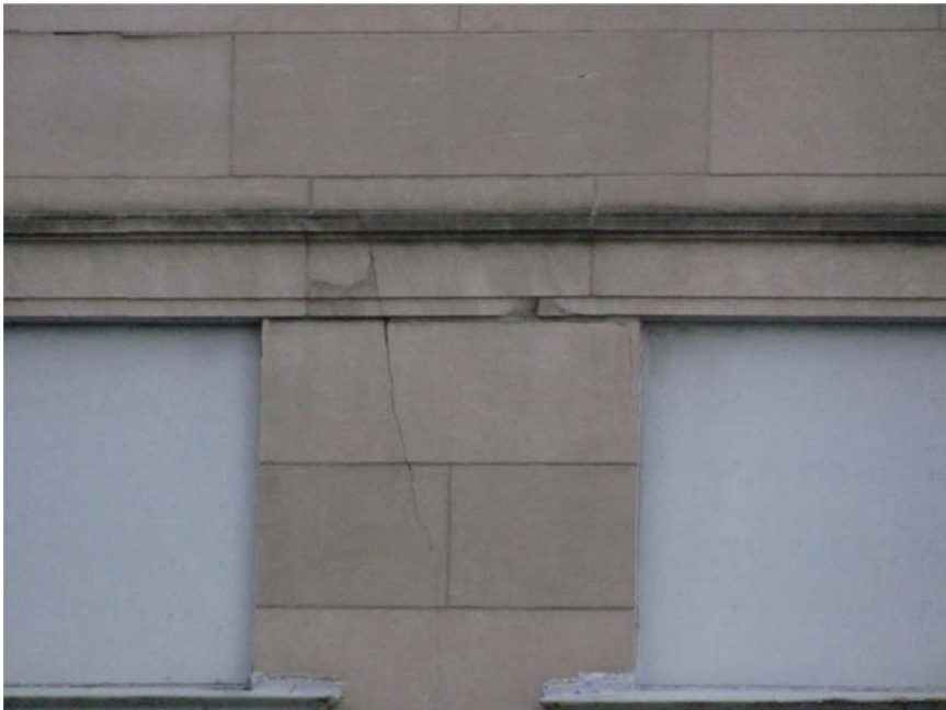
Figure 5. Cracking and spalling of limestone masonry at the head of a first floor window opening.