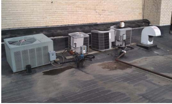
Condensing units serving the furnaces