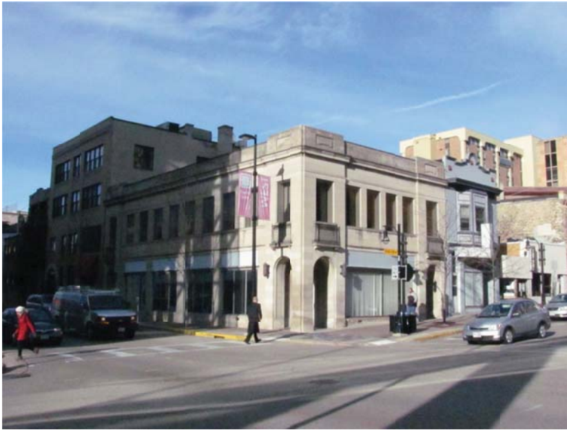
Figure 1. Overall view of 124 West Mifflin. The Mifflin Street facade is at right, while the Fairchild Street facade is at left.