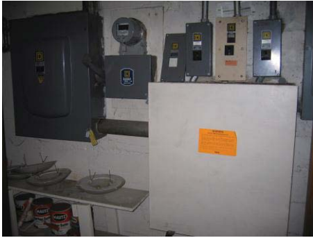
Electrical service in the basement.