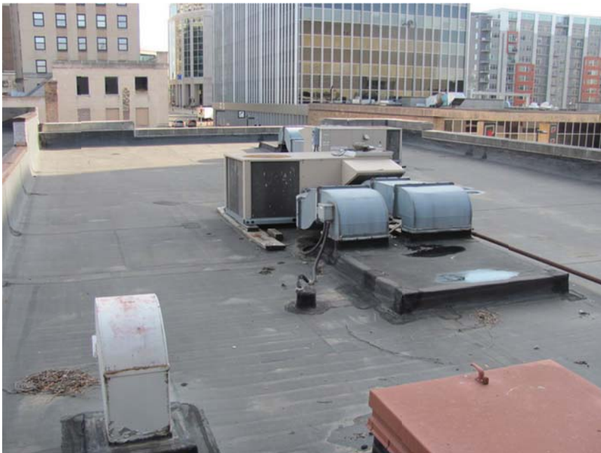
Figure 7. Overview of the roof.