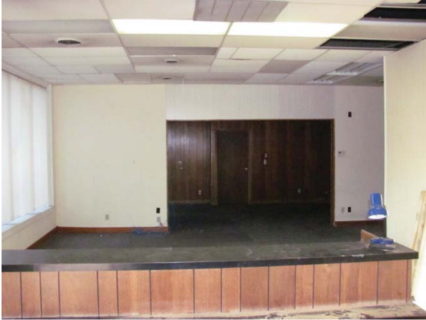
Figure 8. View of the interior.