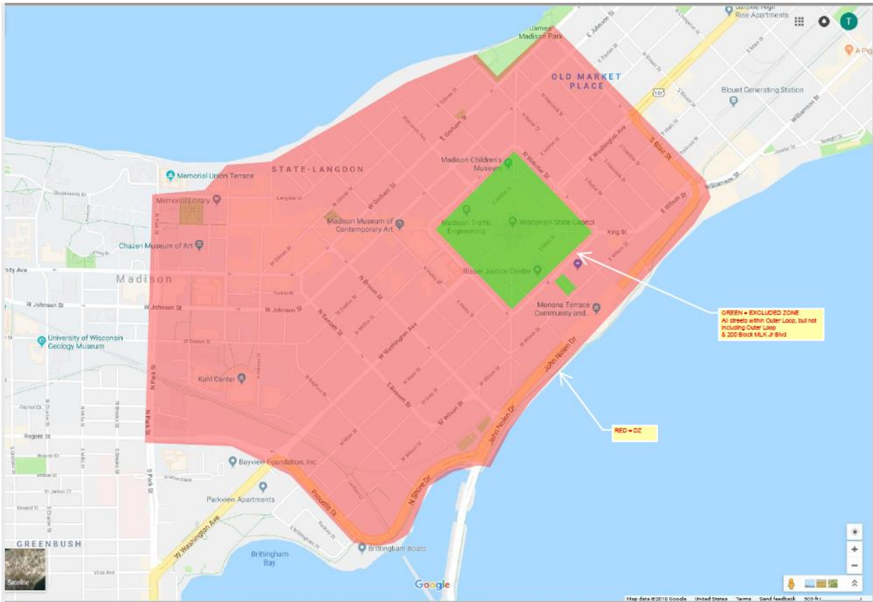
Sample view of Functional Classification Map to identify arterial & collector streets: (See full interactive map linked above for all street classifications in the DZ)