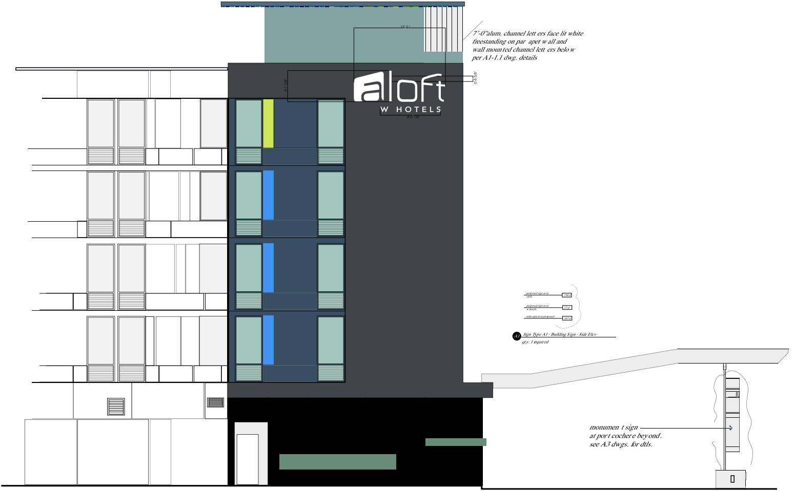
A1 Sign Type A1 - Rooftop Building Sign - Side Elevation qty: 1 required