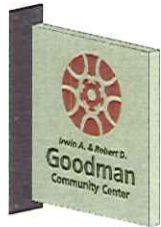
Flag ID Isometric View scale: none