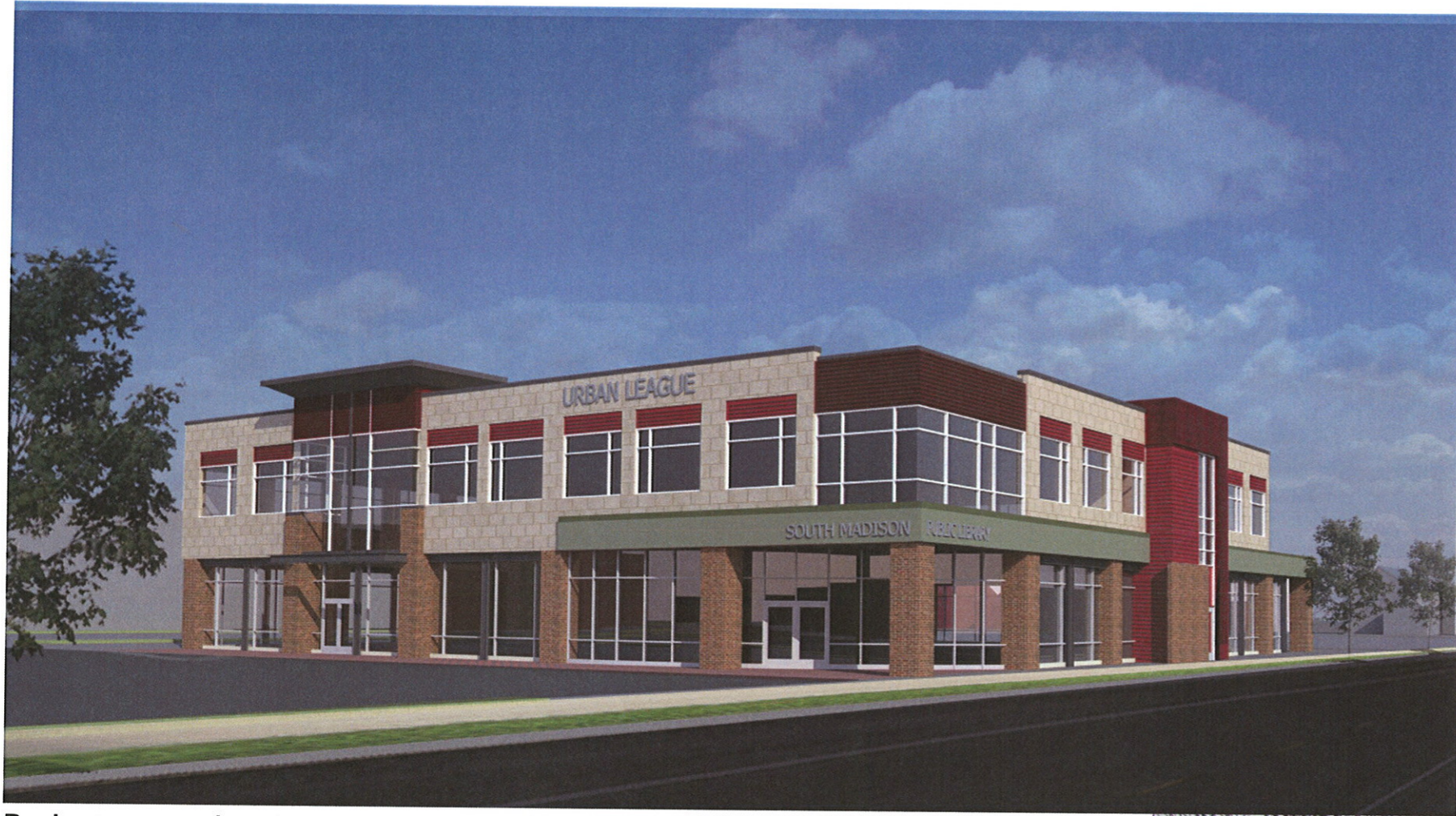
Project as previously approved.