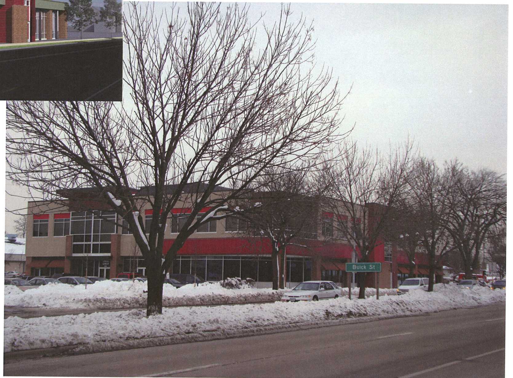
Project as built.