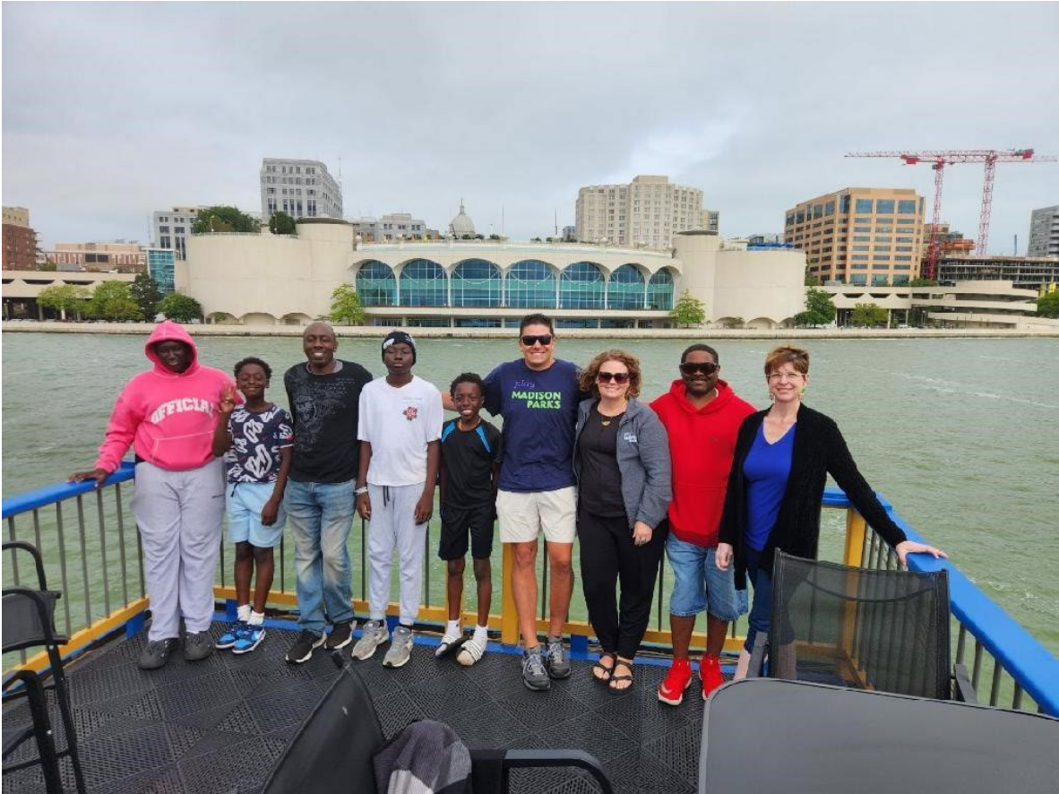
Summer concluded with WPCRC staff and KNOW Program participants enjoying Madison's own Pontoon Porch.