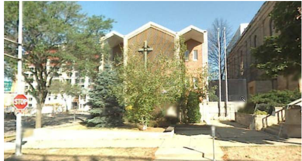
Google street view images and map