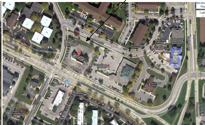
Google street view image and map