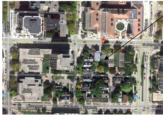
Google street view image and map