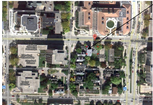
Google street view image and map