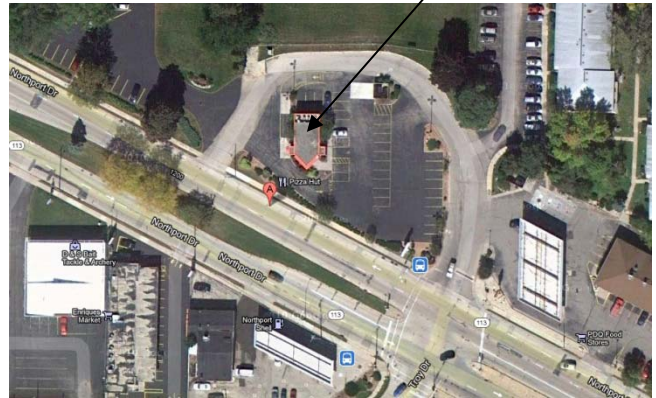
Google street view image and map

Applicant: Brad McClain, UW Credit Union