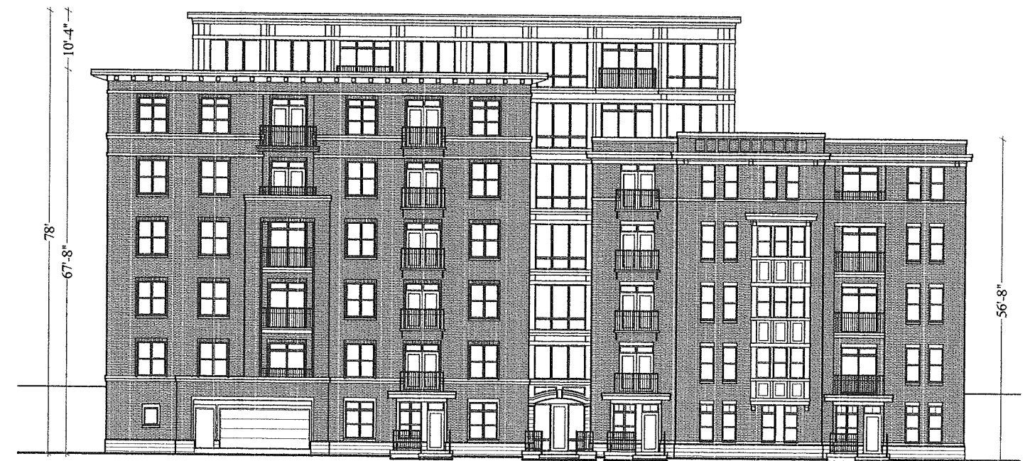
Iota Court Elevation as Currently Proposed