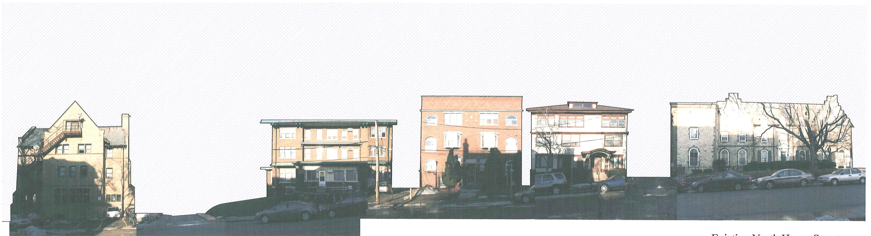
Existing North Henry Streetscape

625 N Henry in Context Henry Street Elevation @ 1" = 24'