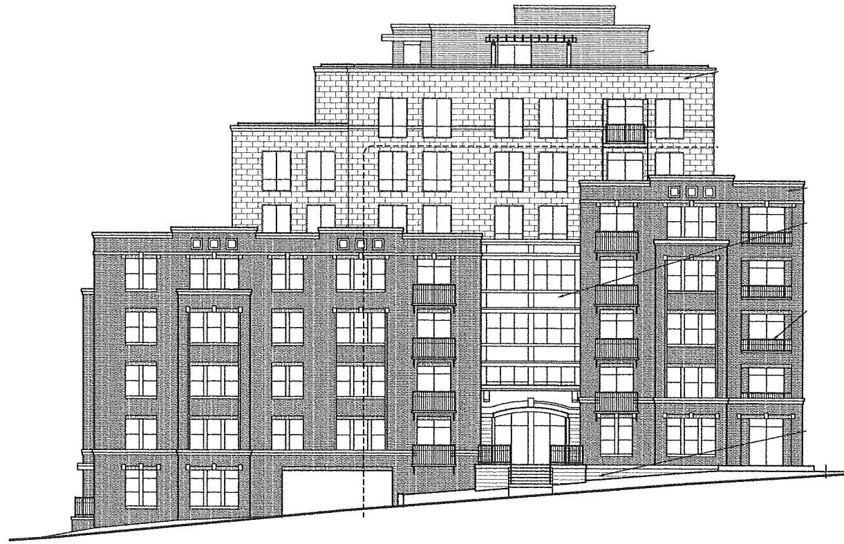
Henry St Elevation as Initially Proposed