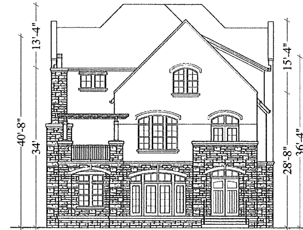
Theta Chi Langdon St Elevation