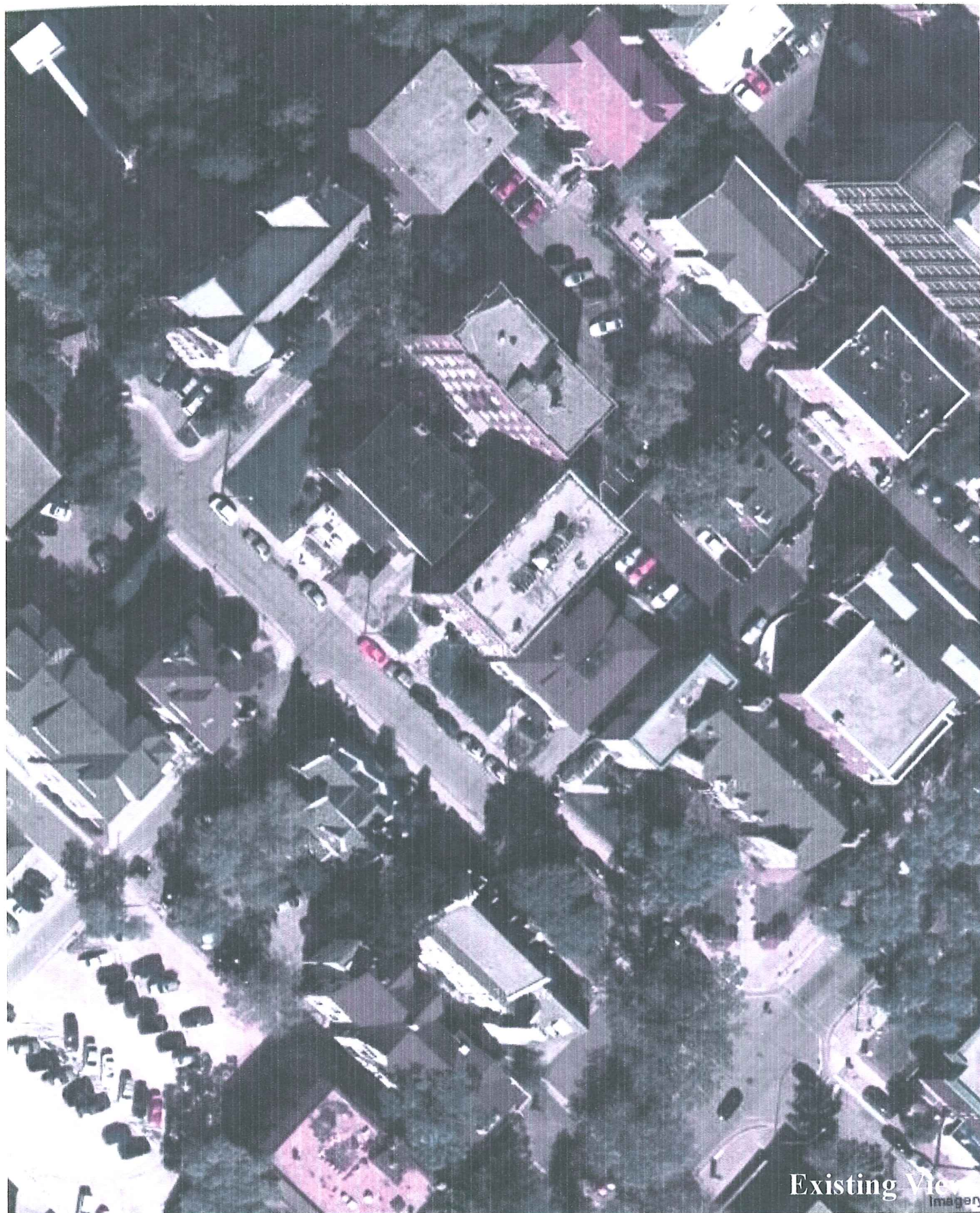
Existing View Imagery