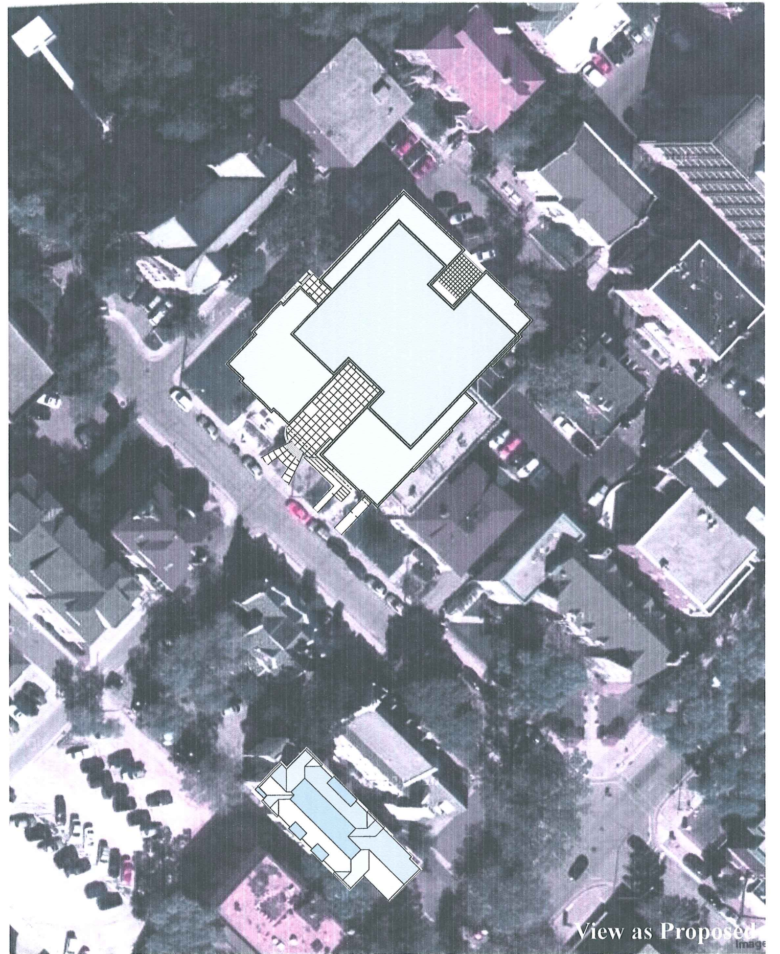
View as Proposed Image