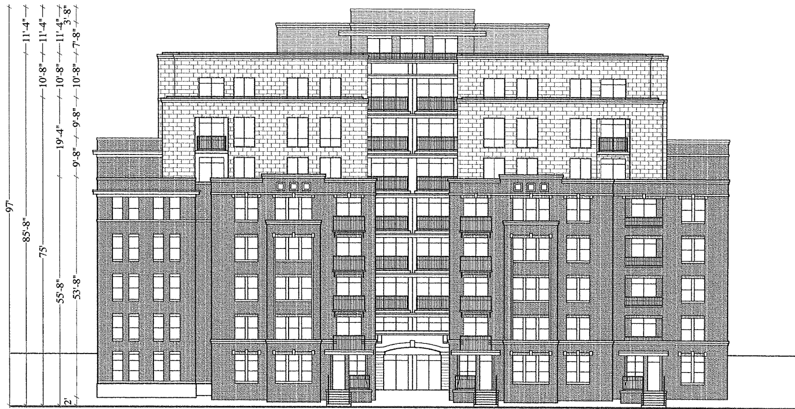
Iota Court Elevation as Initially Proposed