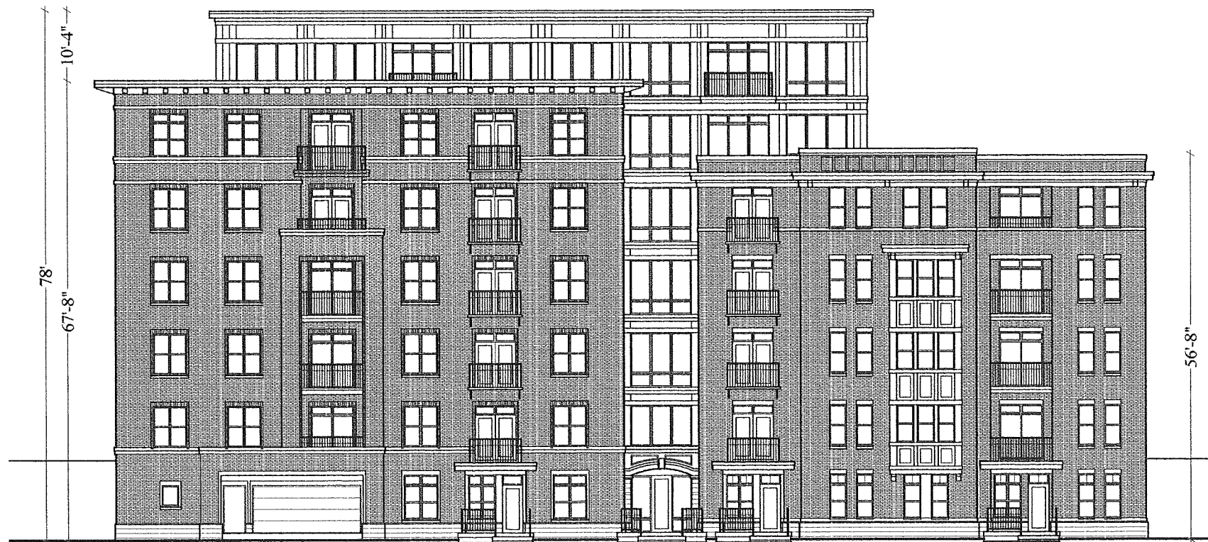
625 North or Iota Court Elevation