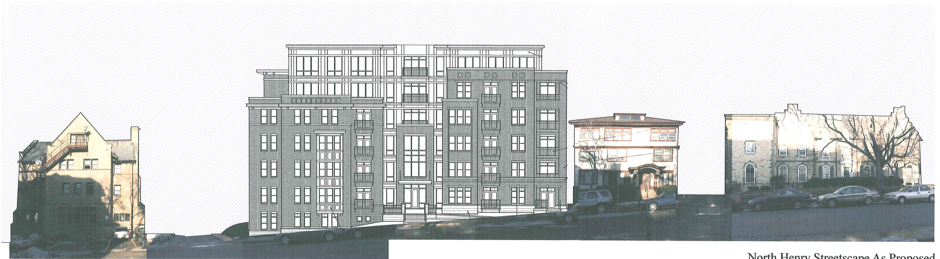
North Henry Streetscape As Proposed