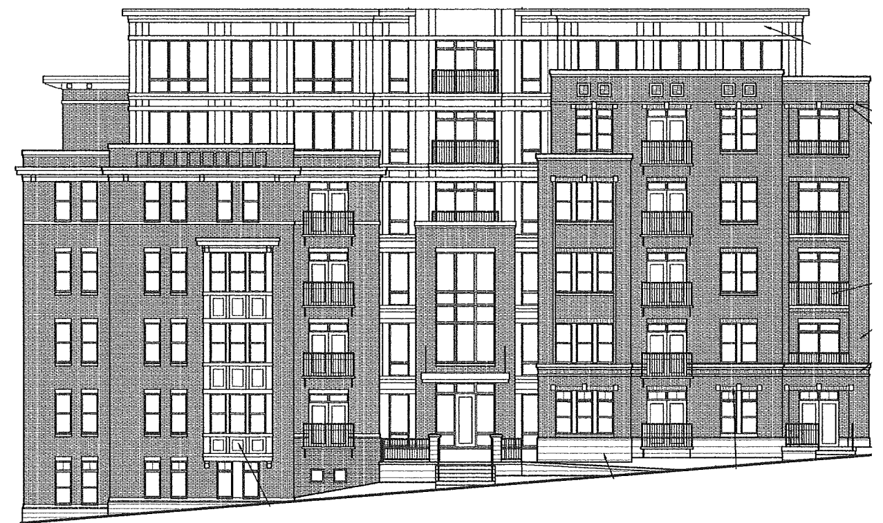
625 West or Henry St Elevation

12-13 625 N Henry in Context Elevations @ 1" = 20'