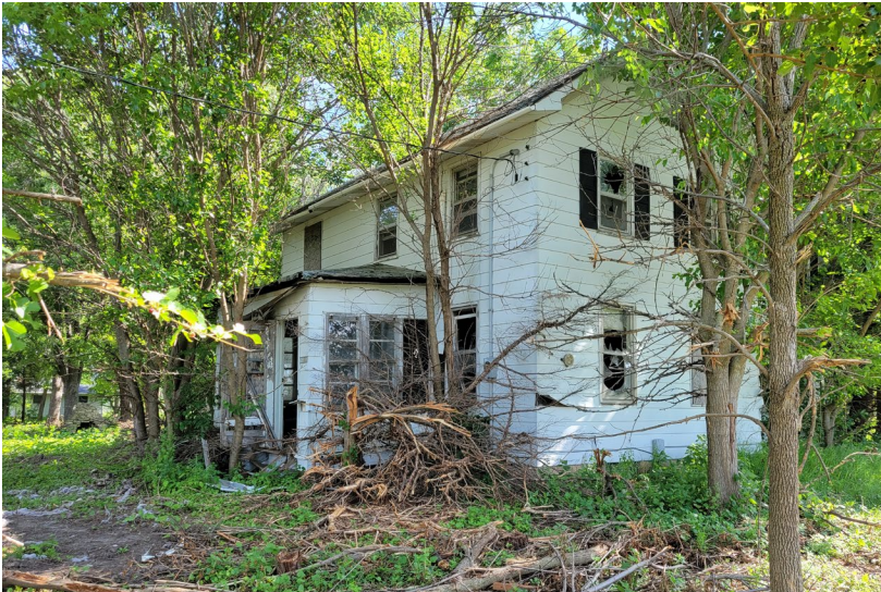
Submitted by the applicant

Single-family home and farmstead, unknown date of construction.