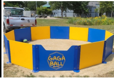
New Tenney Park Bike Rack New Mayfair Park Bench Warner Park Gaga Ball Pit