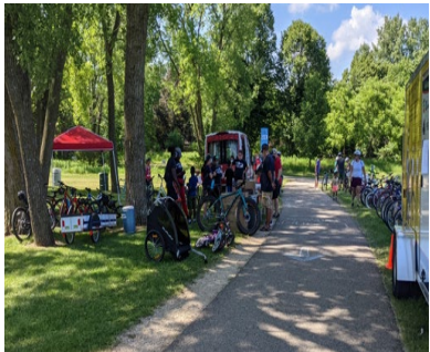
Marlborough Ride the Drive