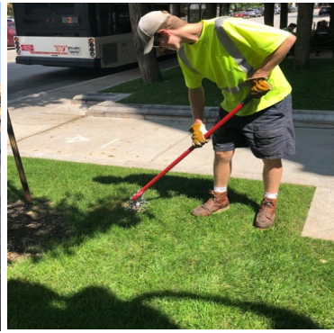
Concourse and State Street planter – summer annuals