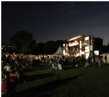
Garner Park Opera