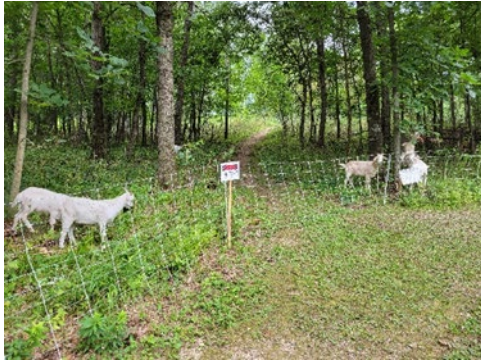
Grazing underway at Owen.

A 600-foot section of trail was established at Edna Taylor to restore a “loop” in the northeast portion of the park, after a significant portion of trail was closed last year to protect the burial mounds there. Thanks to volunteers with the Friends of Edna Taylor Conservation Park for helping to establish this trail.