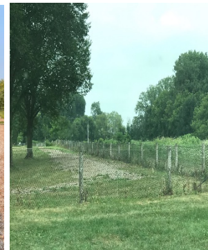
Warner Dog Park fence line – before/after