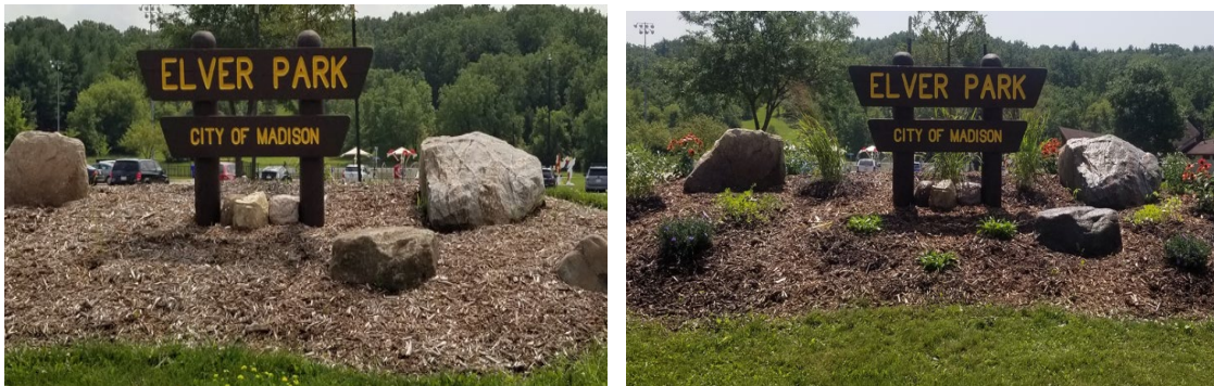
Elver Park – Signature bed beautification – before and after

The Landscape Maintenance Workers spruced up planting beds at a number of parks including Reston Heights, Warner, Garner, and Elver. Staff also improved the appearance of Kenneth Newville Park by repairing and painting benches and removing the heavily worn kiosk. In addition, the Construction staff installed new basketball courts at Baxter and Badger parks.