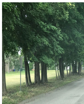
Burrows tree line – before/after