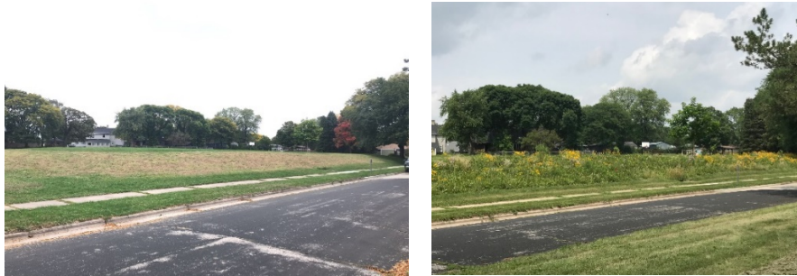
Portland Park – prairie at time of planting and one year later