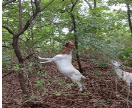
Goats can reach about 6 feet high.