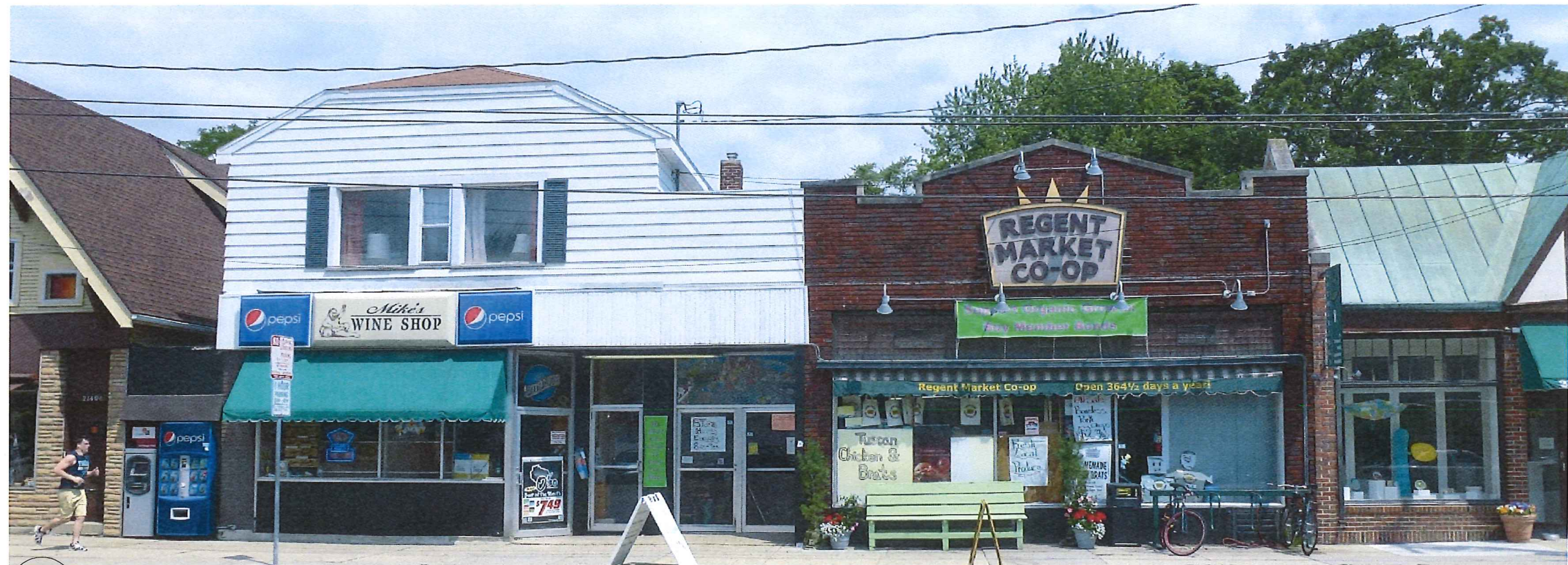
1a REGENT STREET PHOTO A2.0 Scale: 1/8" = 1'-0"