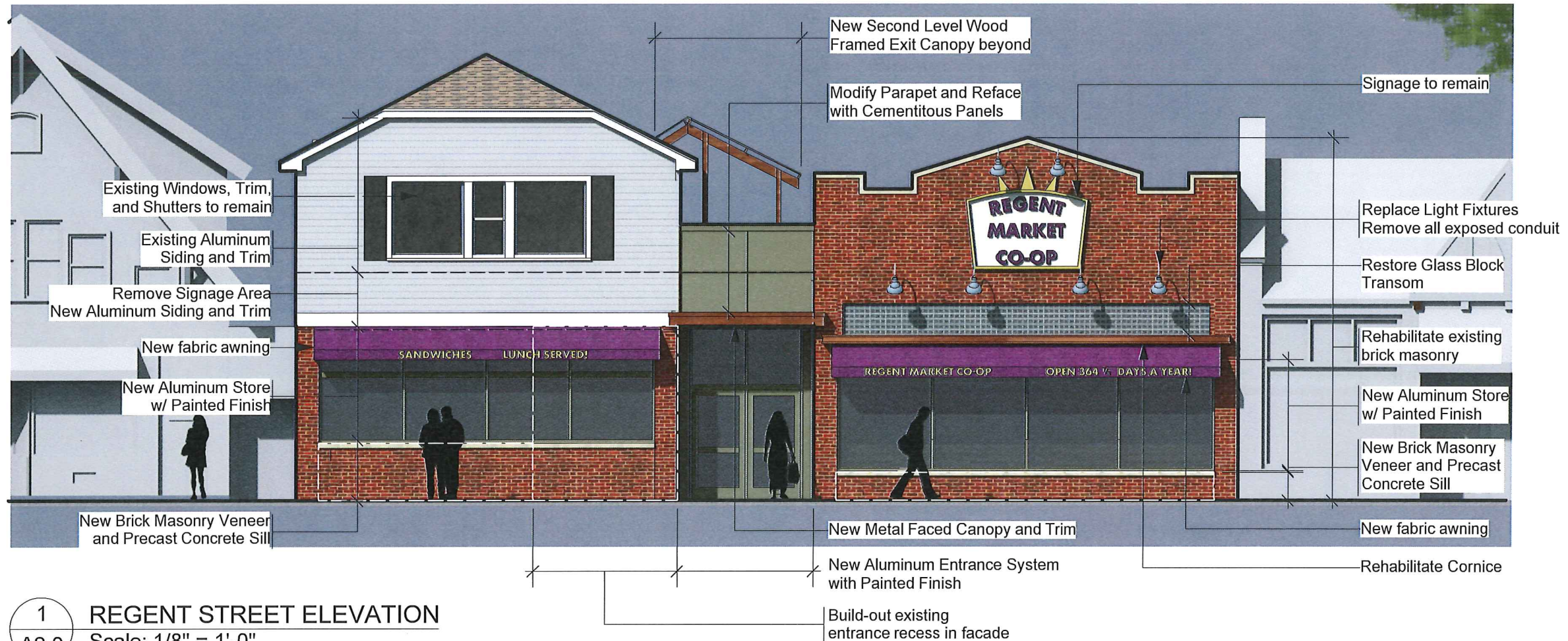
1 REGENT STREET ELEVATION A2.0 Scale: 1/8" = 1'-0"