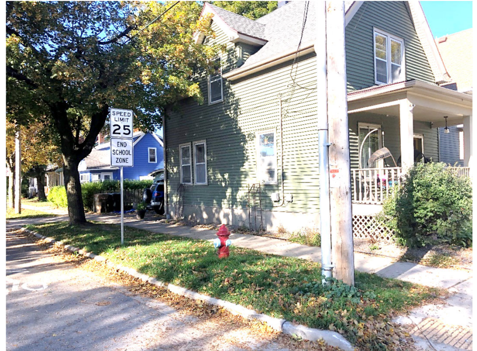
STREET VIEW, MIFFLIN