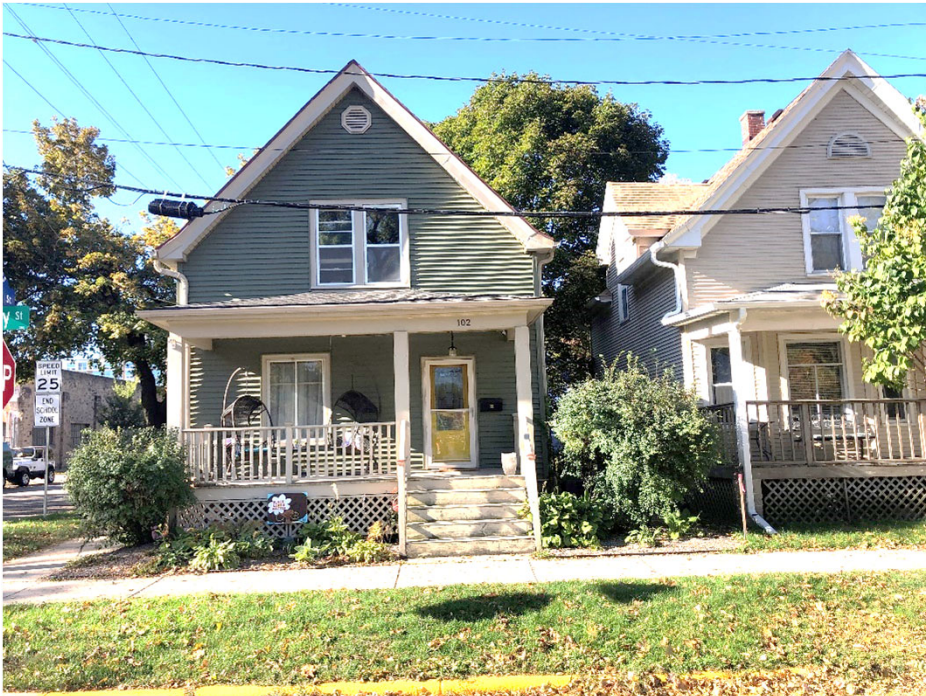
STREET VIEW, BREARLY