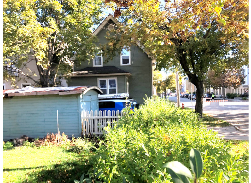
STREET VIEW, MIFFLIN