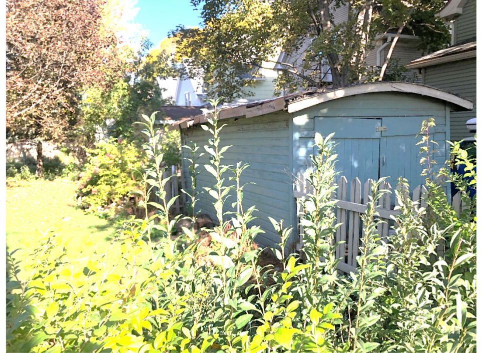
STREET VIEW, MIFFLIN