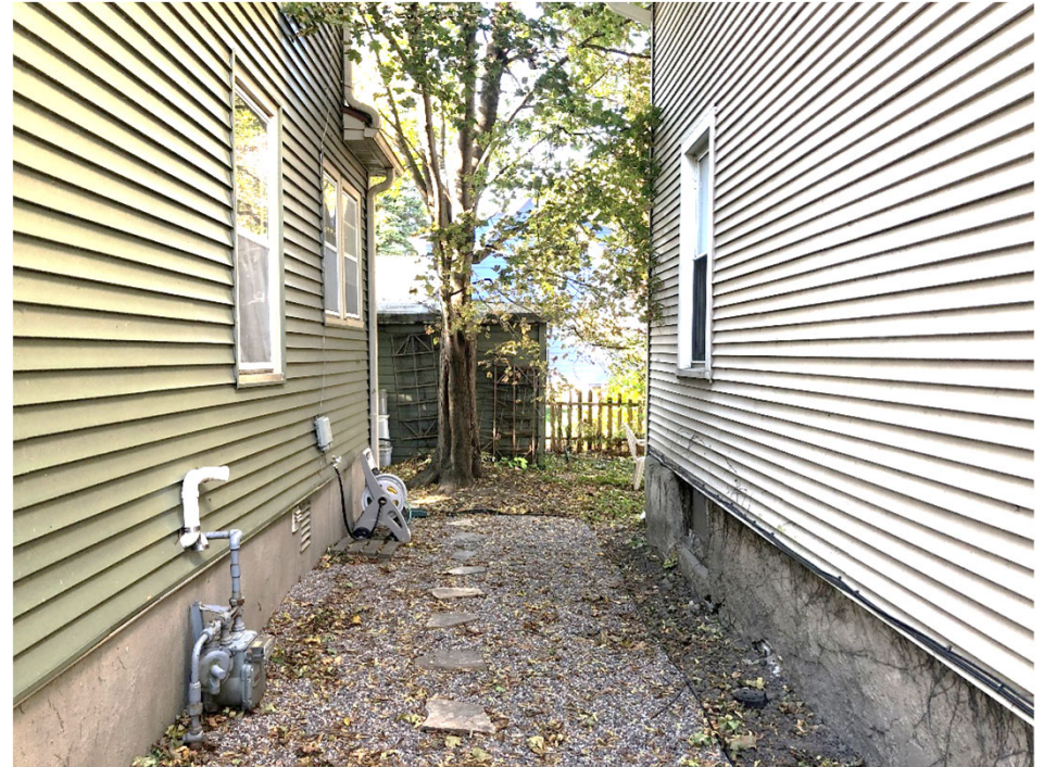
SIDE YARD AREA, LOOKING TOWARD PROPOSED GARAGE LOCATION