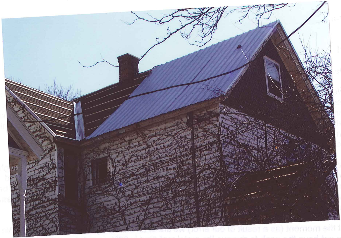
At the moment (as a result of our inability to raise the cash to remove the metal roof (that is 80% complete and paid for) and