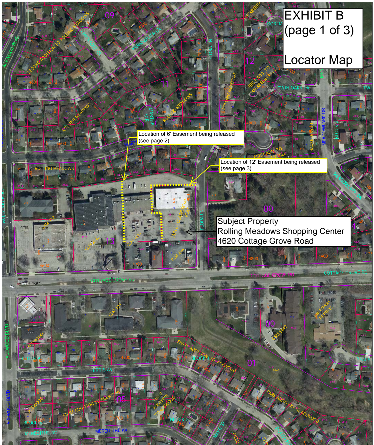
EXHIBIT B (page 1 of 3) Locator Map