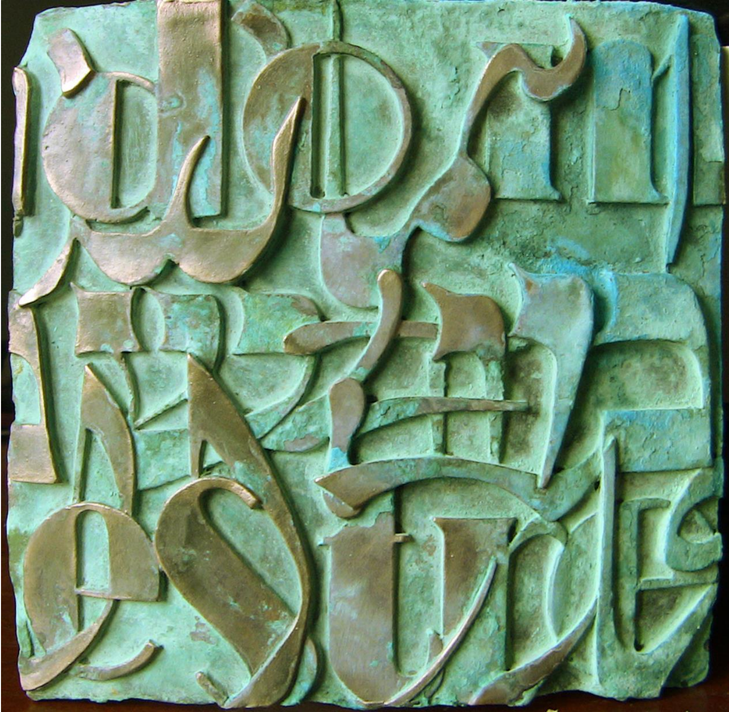
Cast Bronze detail