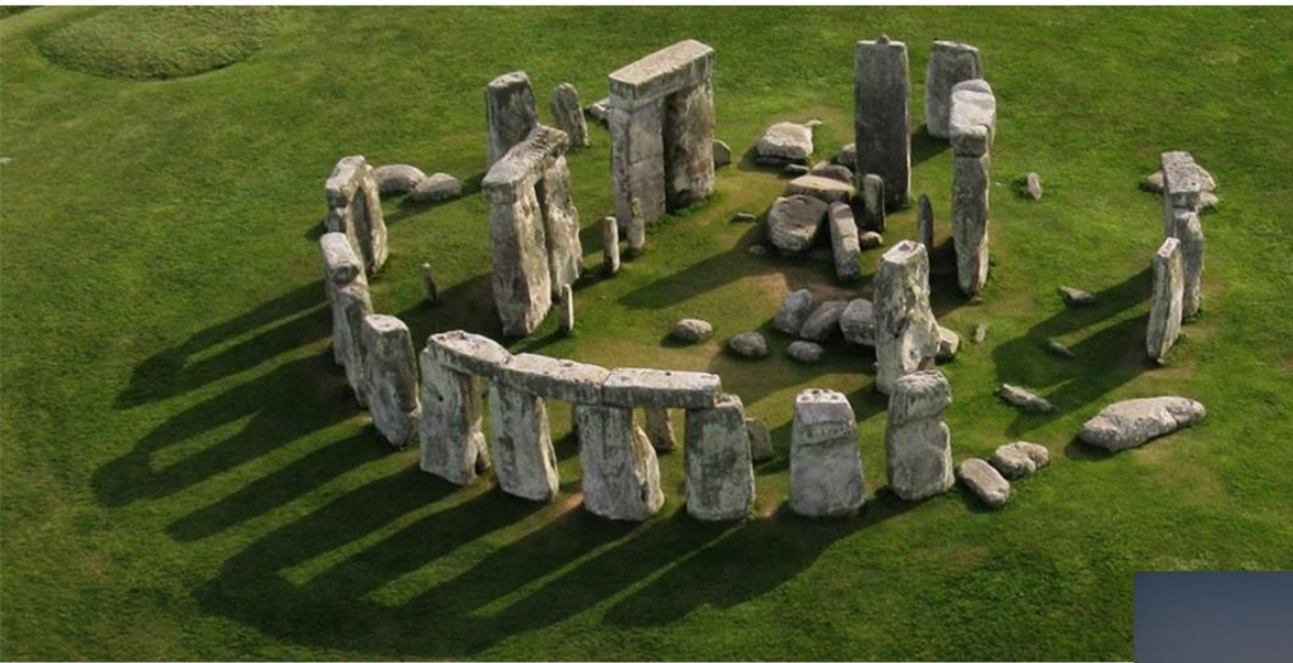
Prehistoric monument of Stonehenge