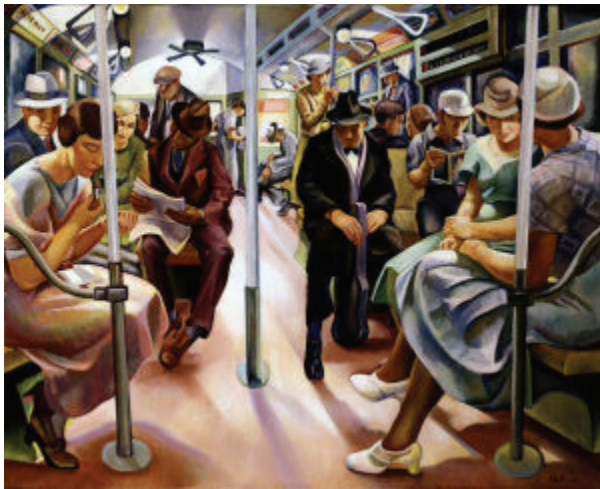
Exhibit of Depression-era art is illustrative comparison as state cuts public funding for arts

FEBRUARY 11, 2013 7:20 AM • GAYLE WORLAND | WISCONSIN STATE JOURNAL | GWORLAND@MADISON.COM | 608-252-6188