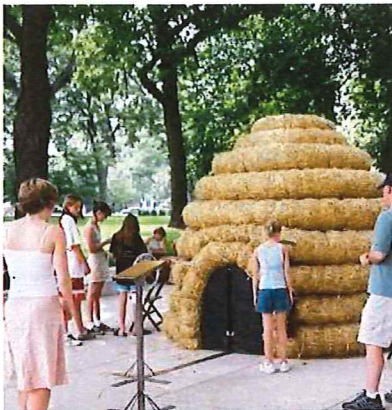
"The Beehive Project" by Chele Isaac, was an interactive public art project consisting of a large scale beehive, featuring a queen bee inside typing a story on an old typewriter. The public participated by helping to write the story.