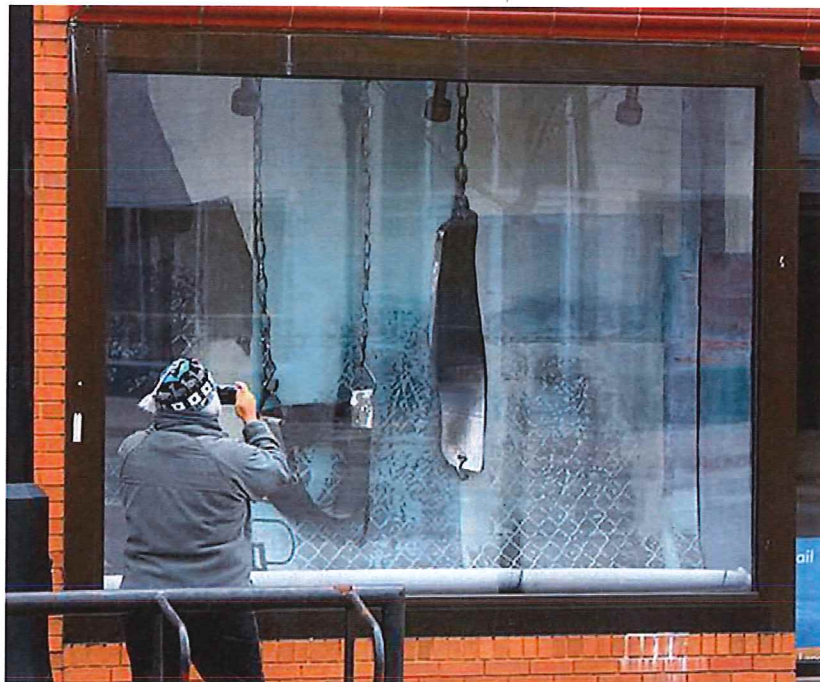
"This is Only A Façade" (2014) by Tyanna J. Buie Previous Blink project installed in ULI-owned storefront