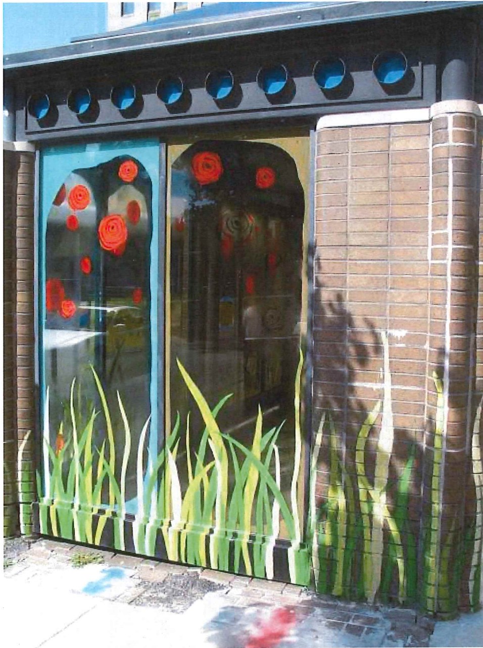
Destination, a BLINK Temporary Public Art Project (July 2007) Artists embellished seven bus shelters on the Capitol Square Artists had 1 day to complete their artwork, the public had one month to see it.