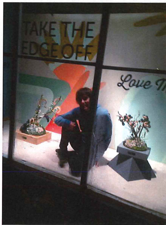
Top Image: From Solo Show at Otherlands “Rest” window installation Walkers Point Bottom Image: Riverwest Community Healing Storefront (w/artist for scale)