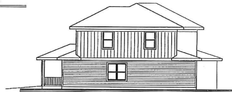
RIGHT SIDE ELEVATION SCALE 1/4" = 1'-0"