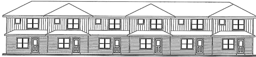
REAR ELEVATION SCALE 1/4" = 1'-0"