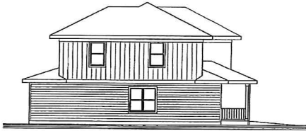
LEFT SIDE ELEVATION SCALE 1/4" = 1'-0"