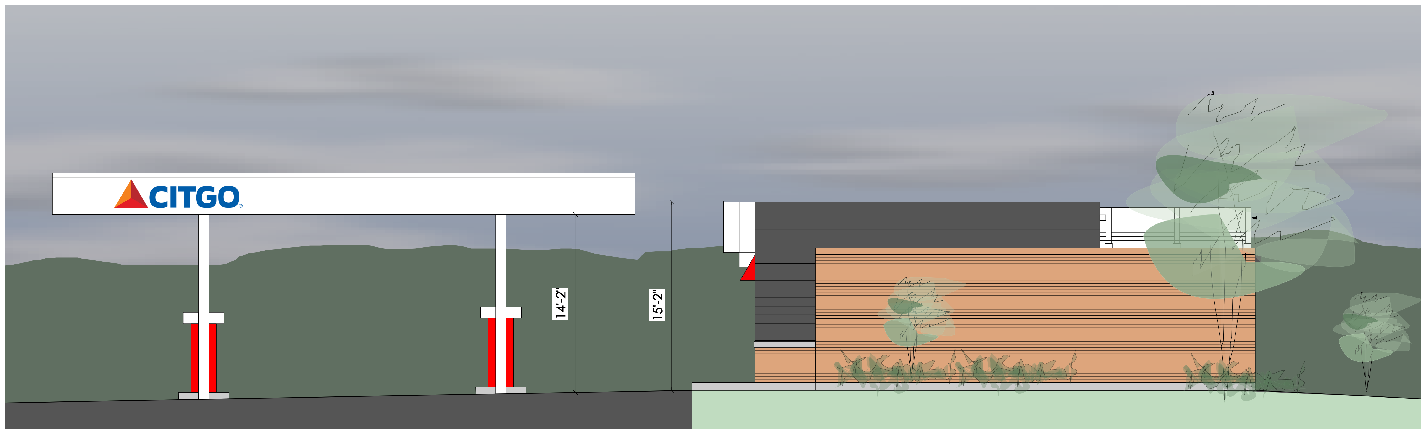
SOUTH ELEVATION (COTTAGE GROVE ROAD)

HORIZONTAL METAL PANEL MECHANICAL ROOF SCREEN. COLOR: WHITE TO MATCH EXISTING CANOPY