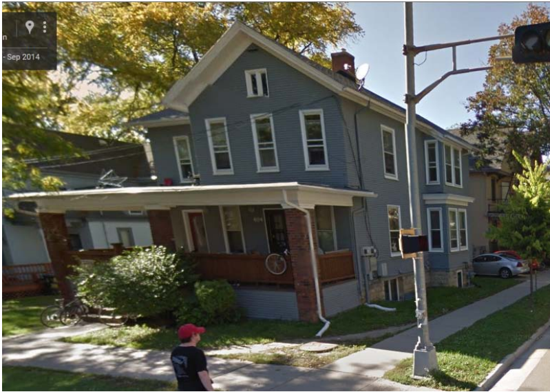
Google street view – 404 W Washington