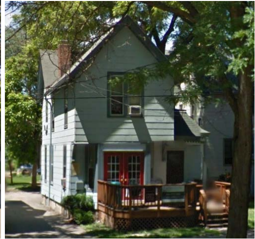
Google street view – 408 W Washington