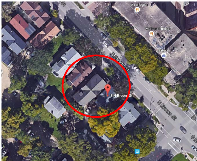
Google aerial view