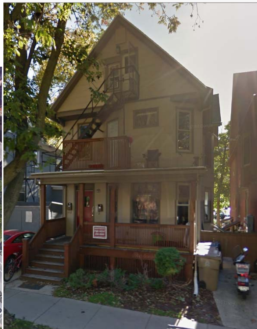
Google street view – 8 N Broom