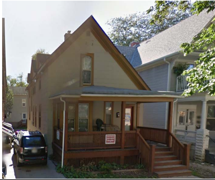
Google street view – 14 N Broom