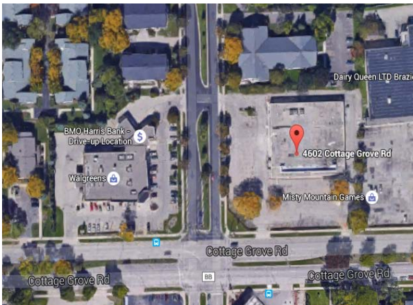
Google aerial view