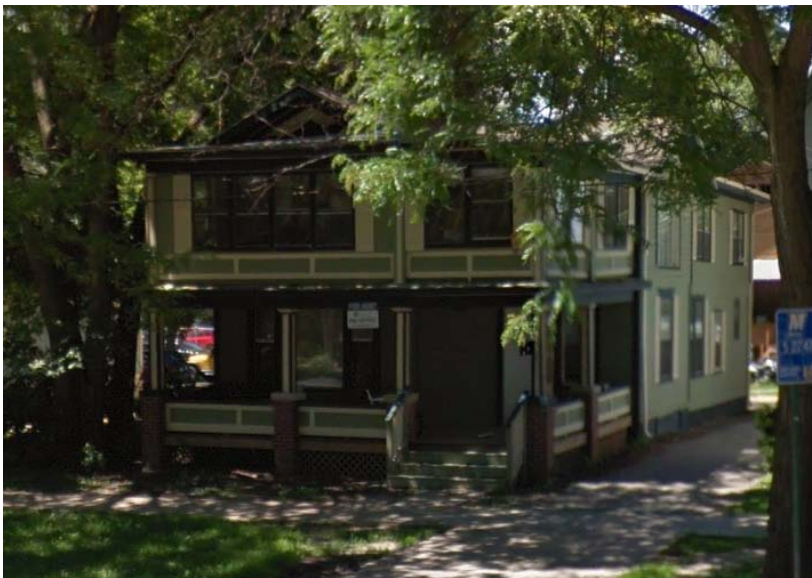
Google street view – 410 W Washington