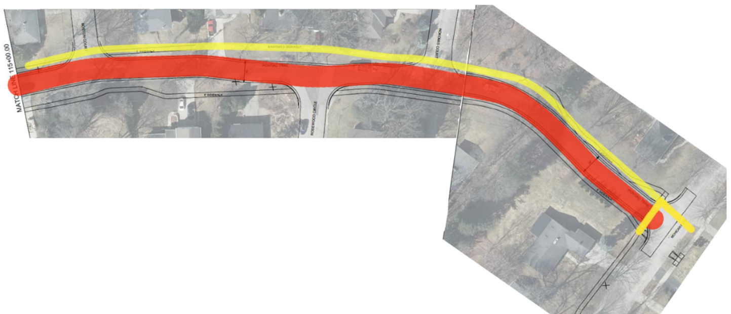
Figure 3 - North Segment - Single side. Preserves green space, large canopy trees, and reduces stormwater issues. Maintains historical characteristics and character of Summit Woods. Also, should preserve the large grouping of arborvitae trees that would likely be removed.