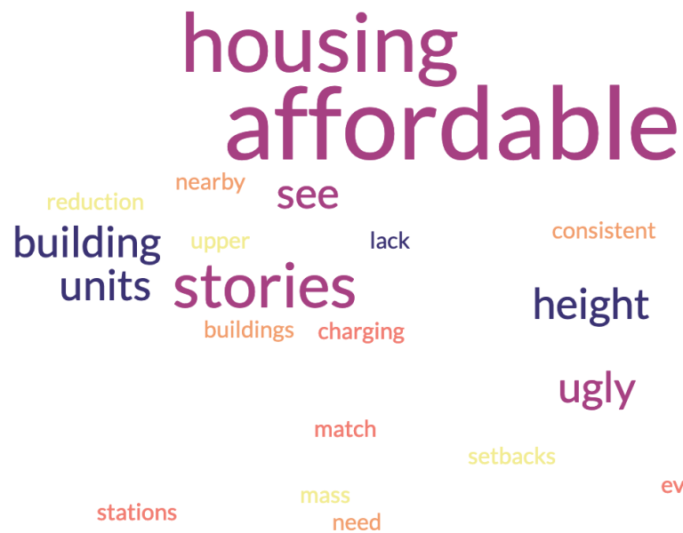
Figure 2. Word cloud of reservations among people who chose “support with reservations”

Among those who chose support with reservations, a common concern was affordable housing. This matches with all of the free-text responses, where a common theme was including affordable housing in any new development. This was not a common theme among people who chose “support”, who instead requested less parking in the development.