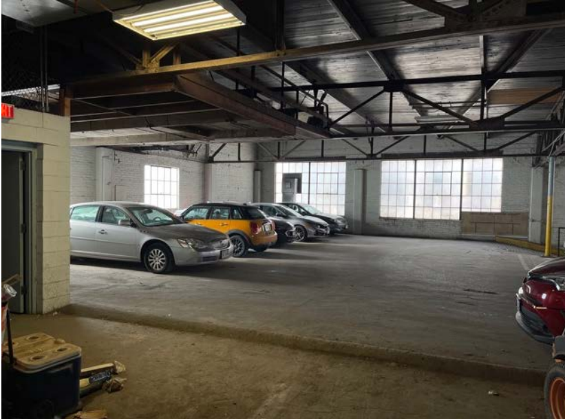
Upper level parking