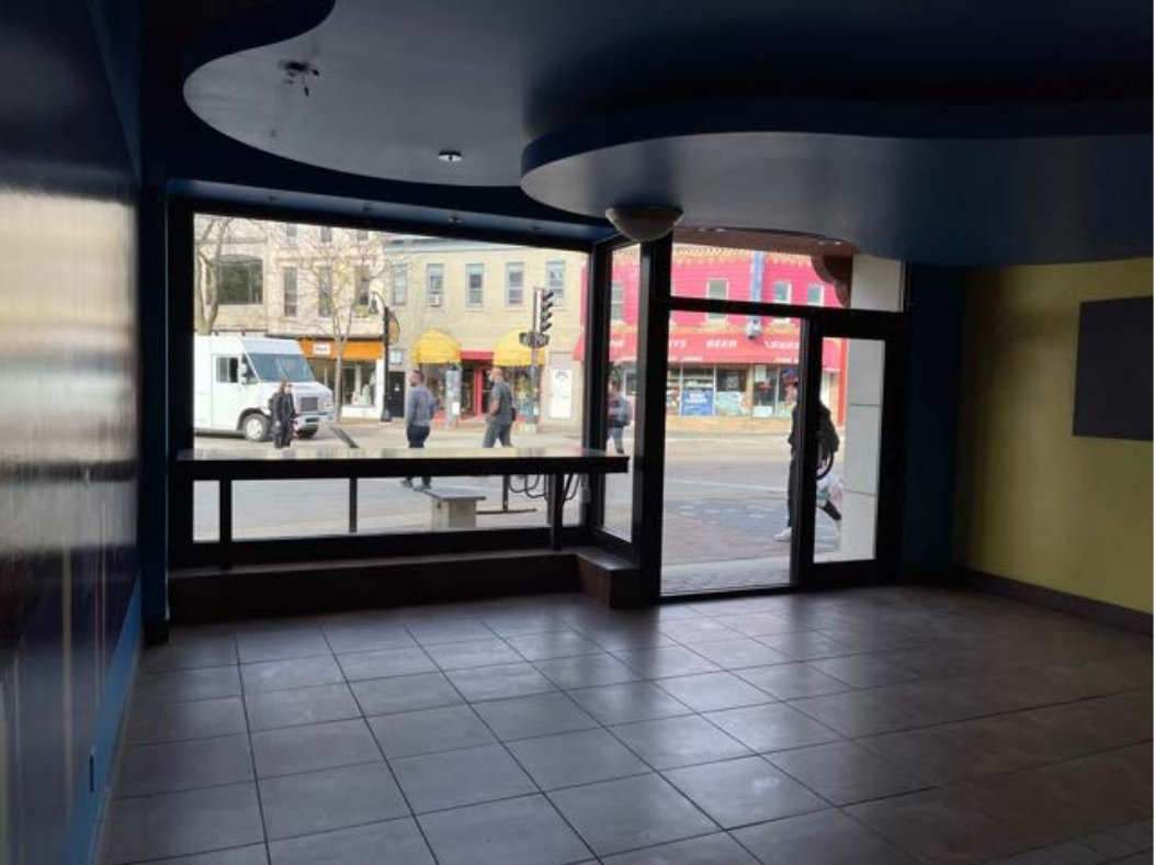
Former La Coppa gelato store