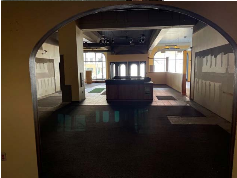
Former Room of One's Own space