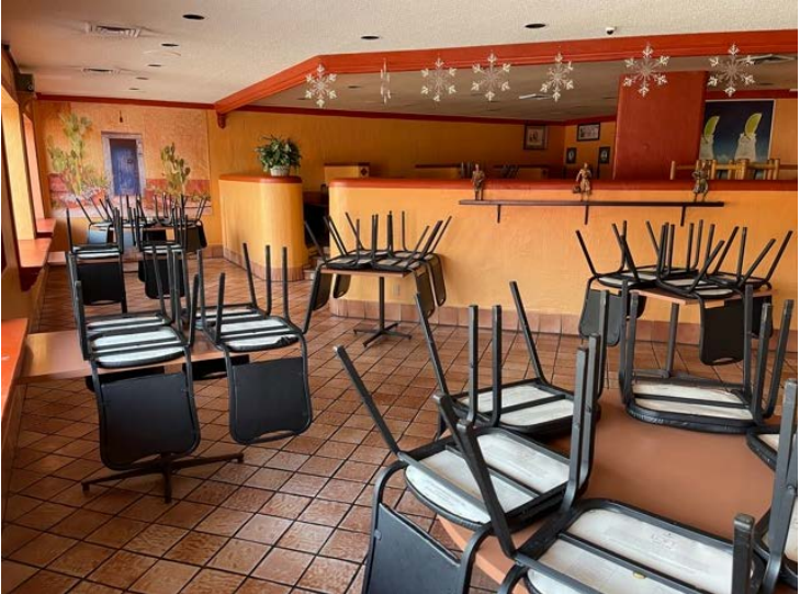
Former Casa de Lara restaurant on second floor