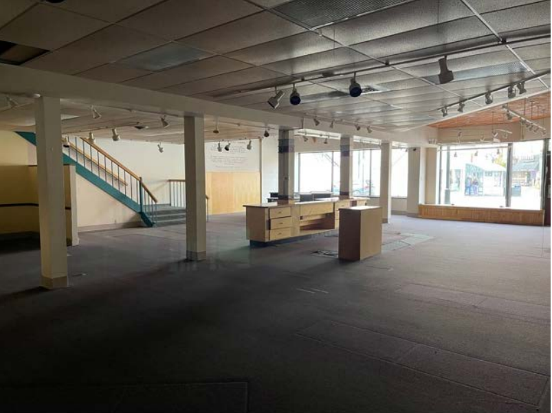
Former Community Pharmacy