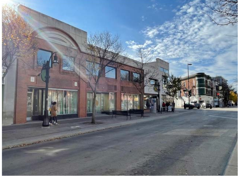
View from across State Street