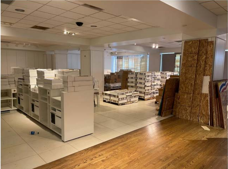
Former GAP space