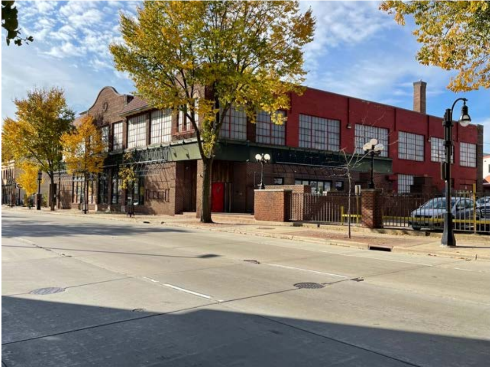
View from across Johnson Street