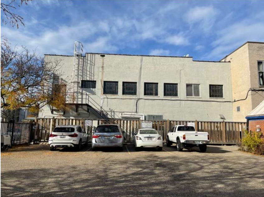
View of back of building