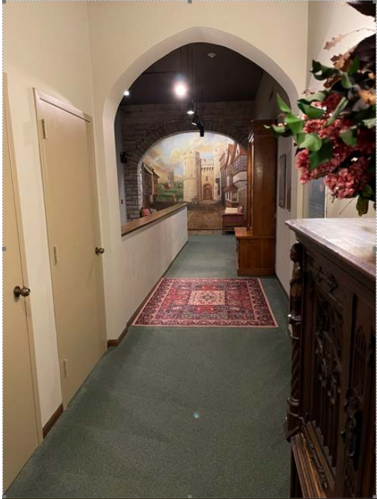
Second floor reception area for Canterbury Inn