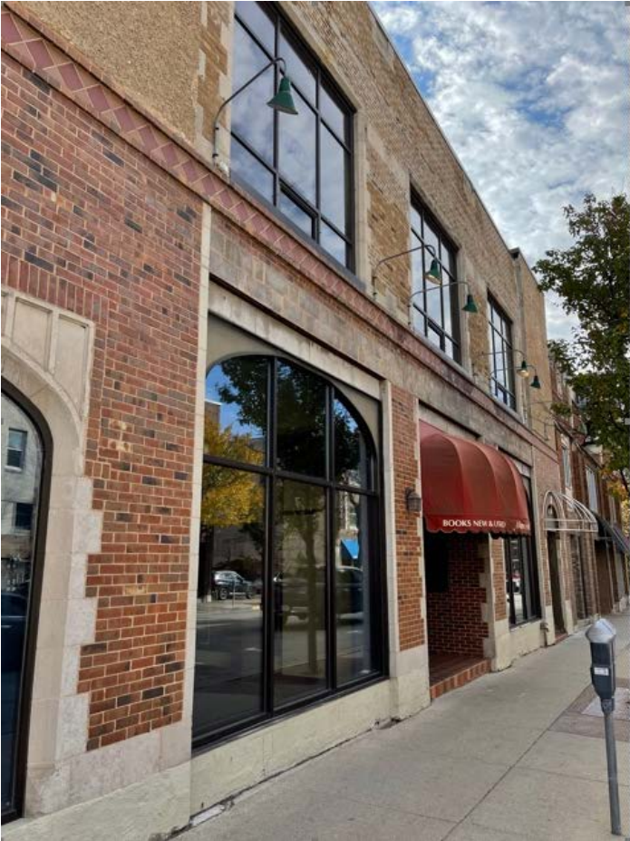
Façade from Gorham Street sidewalk