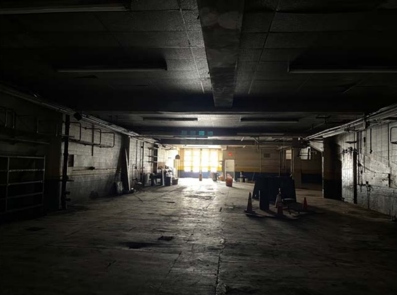
Service area of former Terry's Car Care