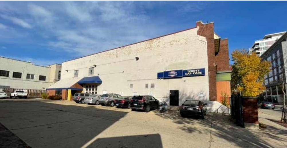
View of SW side of building (entrance to former Terry's Car Care)