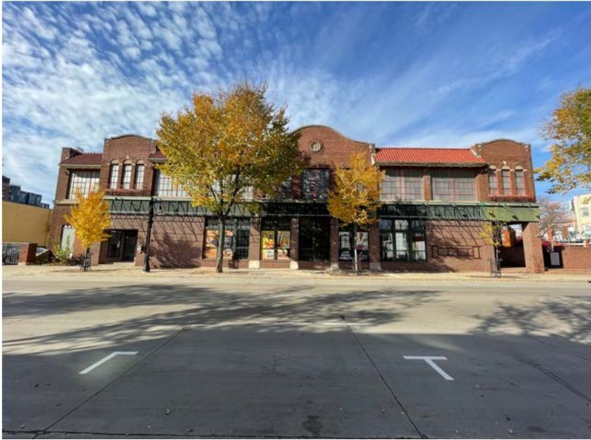
View from across Johnson Street