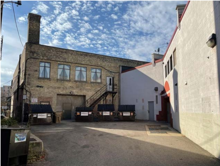
View from back alley