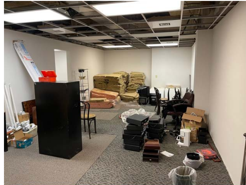
Former Stanley Kaplan space