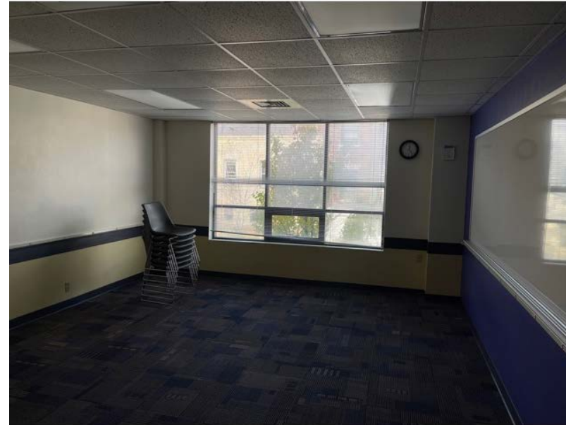
Former Stanley Kaplan space