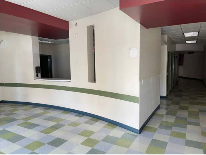
Former Interstate Blood & Plasma space