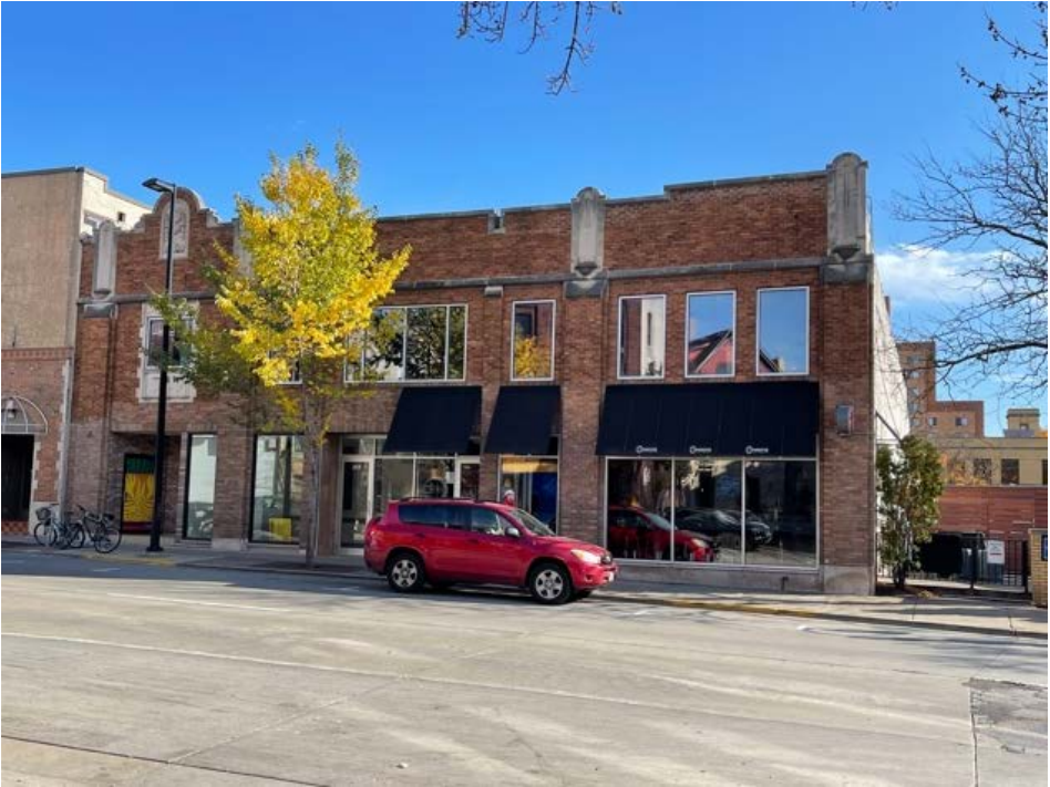
View from across Gorham Street