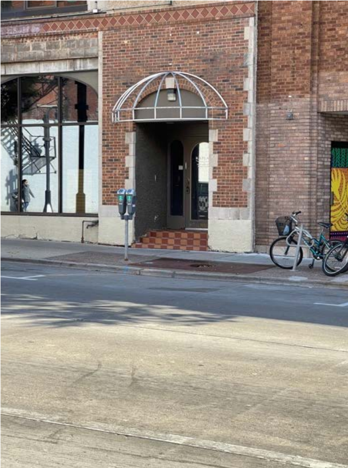
Entrance to former Stanley Kaplan (not accessible)