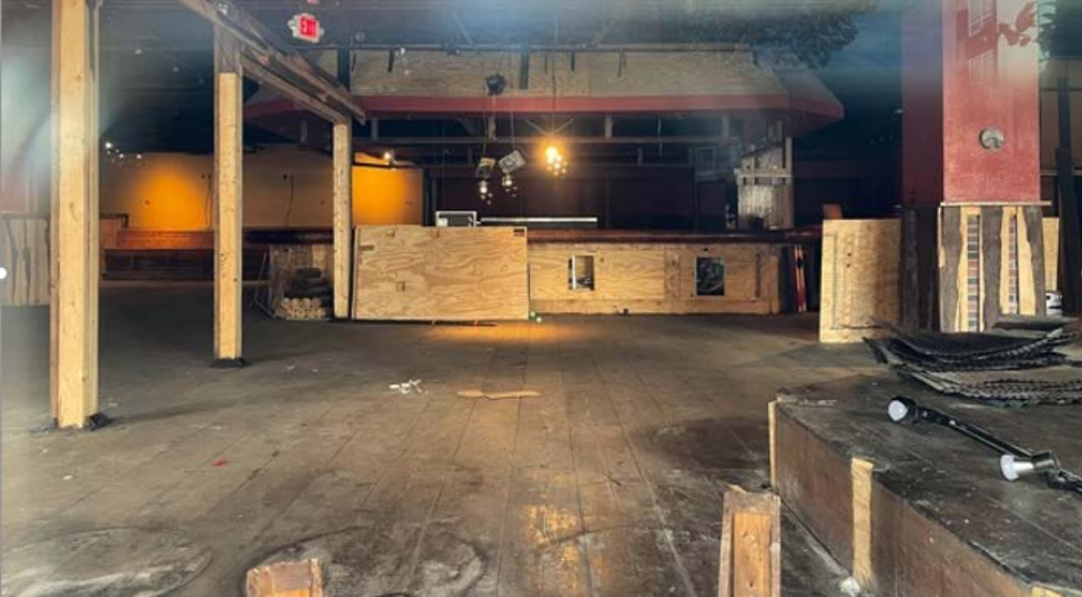
Former Red Rock Saloon space