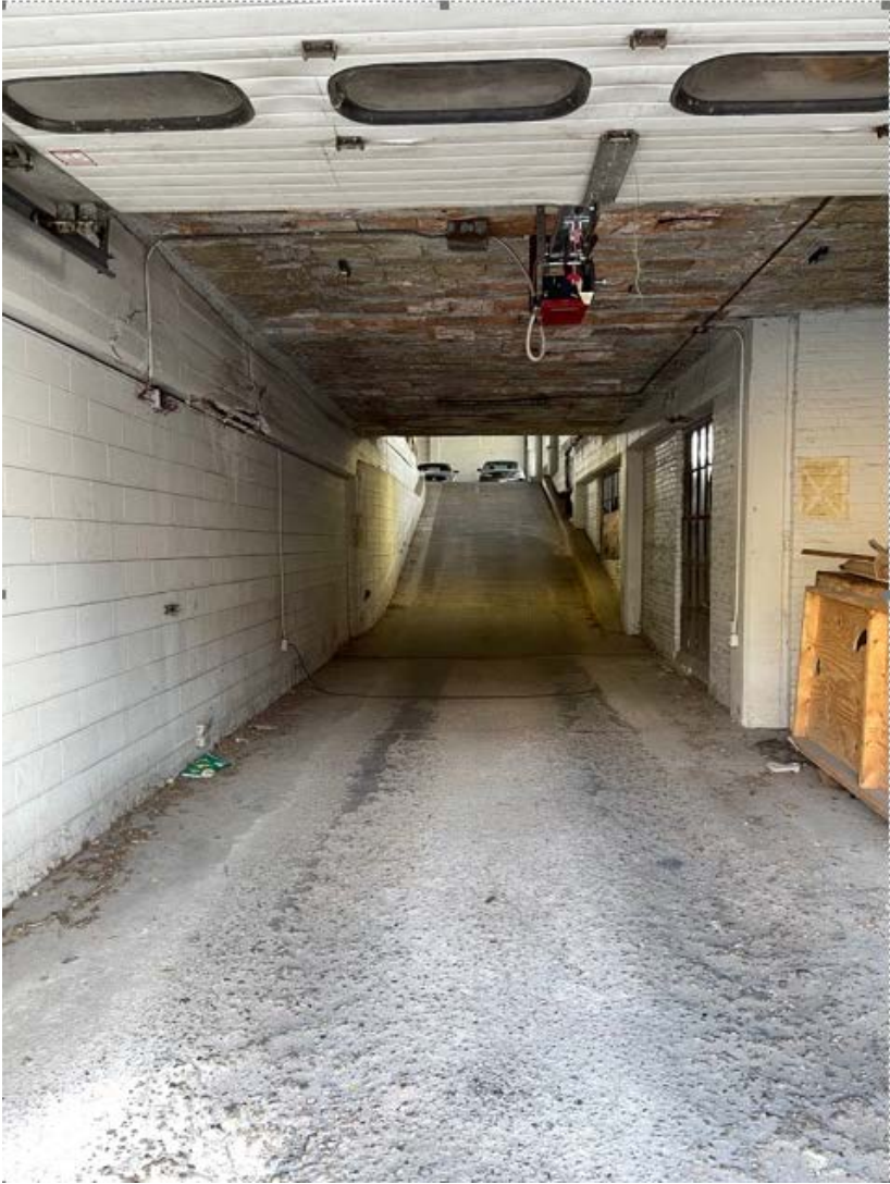
Ramp to upper level parking