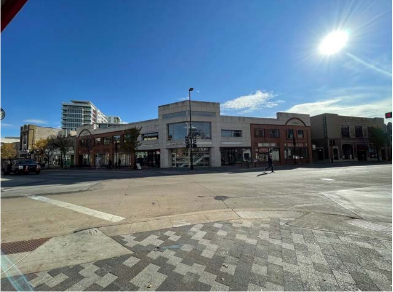
View from across intersection