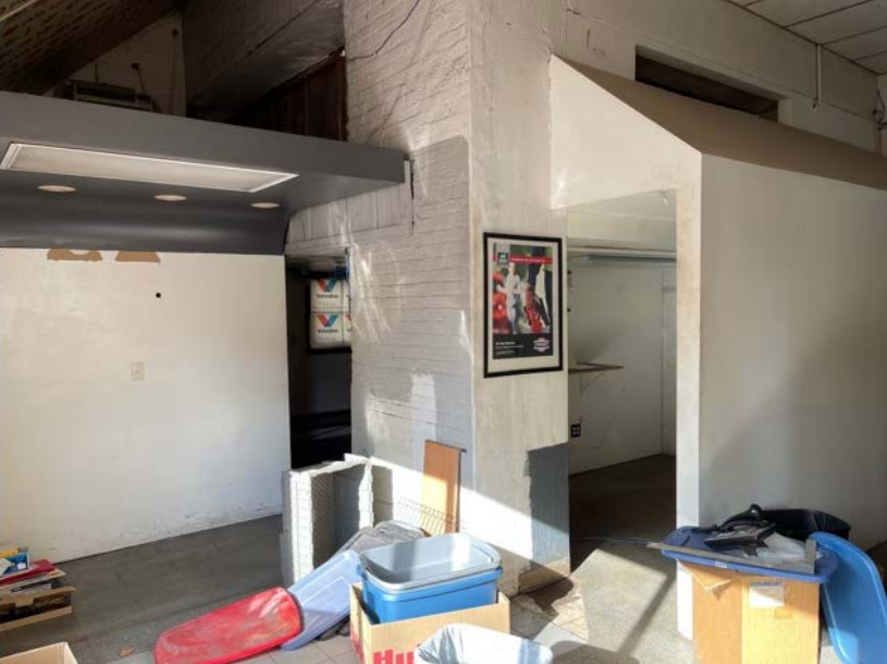
Former Terry's Car Care office