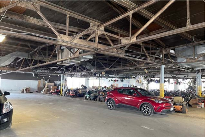
Upper level parking