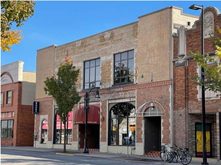
View from across Gorham Street