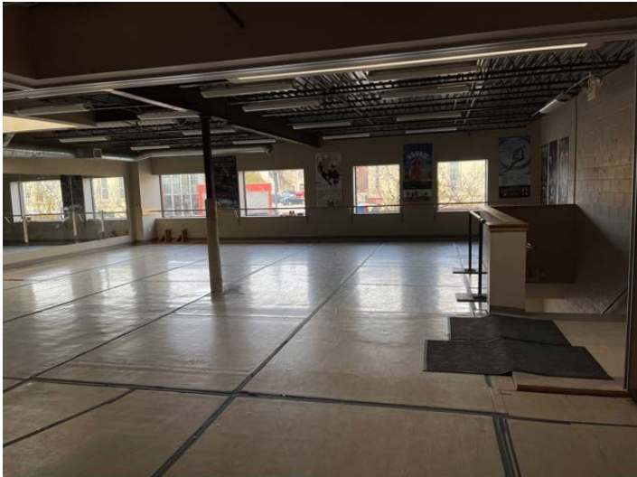
Former Kanopy Dance studio on second floor