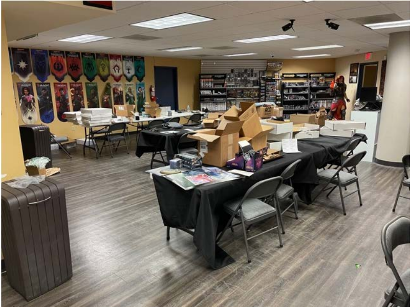
Powernine Games space in basement