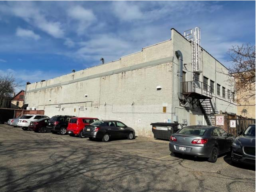
View of side of building