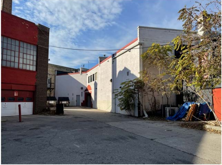
View from back alley