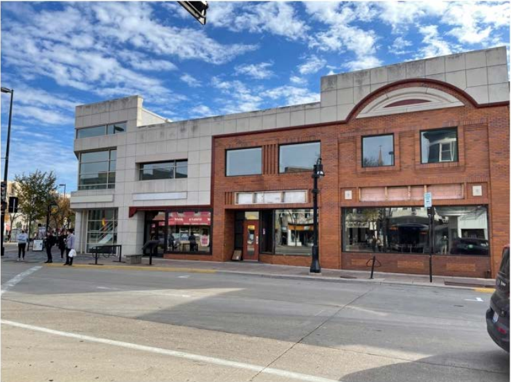
View from across Gorham Street